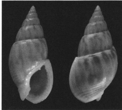
Kool, 2006. Holotype. 16.7 x 7.4 mm. – Basteria 70(4-6): 99.