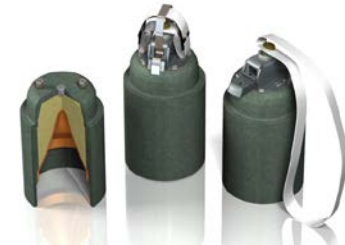
M42/M46 DPICM Grenades