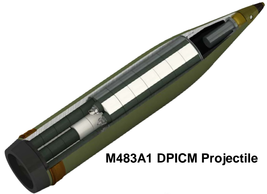
M483A1 DPICM Projectile