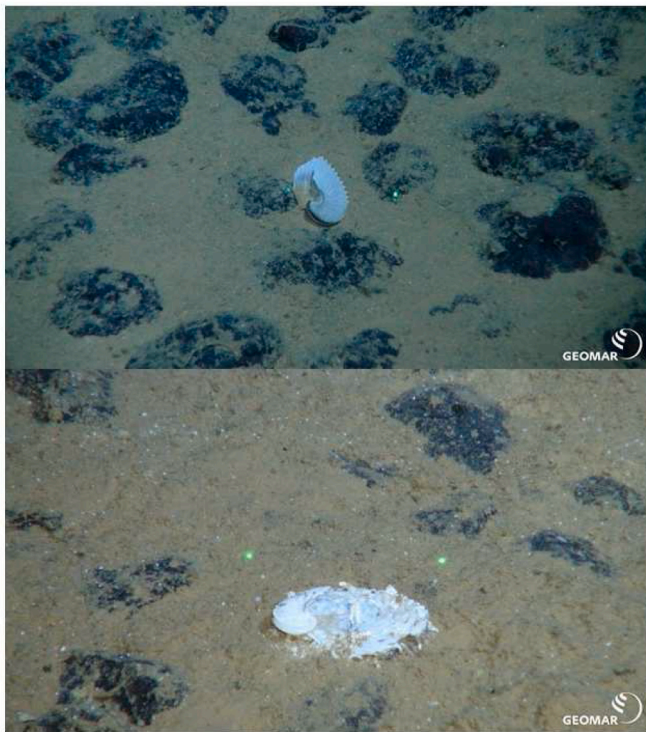
Fig. 2. Argonauta egg cases observed by ROV KIEL6000 in the area BGR-east during SO268 in 2019: a) an intact egg case and b) a partially degraded egg case. The distance between the laser dots is 6.3 cm.

collected. The seafloor area captured within each image was determined by measuring the spacing of the laser points in a subset of 3663 images using the PAPARA(ZZ)I software application (Marcon and Purser 2017). This resulted in an average image area of 10.85 m 2 . The 13 seafloor transects covered a total area of 446,293 m 2 . ROV surveys by ROV KIEL6000 in the study region also documented the egg cases opportunistically. These images were used as reference material and for illustration.