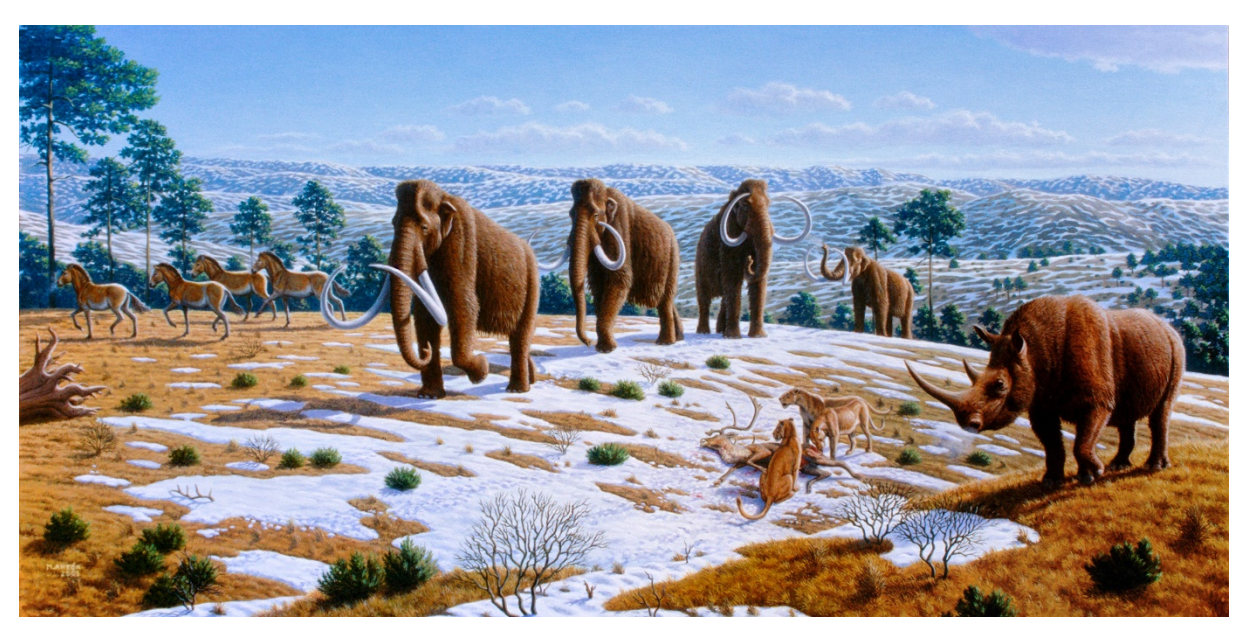
2: Middle Pleistocene fauna (painting by Mauricio Antón)

There were indeed times during the Pleistocene when Britain was partly covered with an ice sheet. At the height of a glacial period, the ice could be over a mile thick. The ice sheets differed in their extent at various times: one reached southern England, while others barely affected anywhere south of the River Trent. During these glaciations, areas outside the ice sheet would have tundra conditions resembling present-day Siberia or Alaska, with plants and animals adapted to the extreme cold. Creatures such as the woolly mammoth or woolly rhinoceros are well-known, and there have been local finds of mammoth remains.