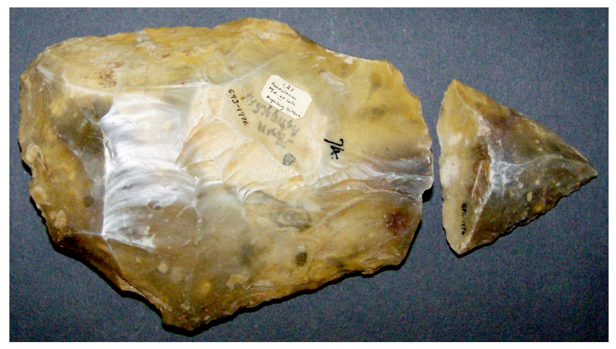
9: a broken handaxe from Highbury in Hitchin

There is even evidence from North Hertfordshire that shows Homo heidelbergensis behaving just like us. During the excavation of one of the clay pits in Hitchin, a broken handaxe was found, missing its tip. The missing part was found later, some distance away, where the use had thrown it in anger. These early humans were well adapted to their environment and knew how to exploit available resources. Hitchin has provided some of the best evidence in northwest Europe for early humans, with more than a hundred of their stone tools found.