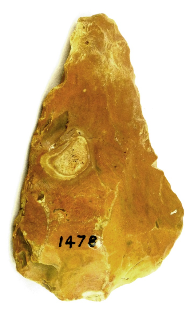
6: a handaxe from the Hitchin lake bed deposits (the orange colour typical of flint stained by iron dissolved in water)

Tundra conditions returned to Britain around 375,000 years ago, so the migrating herds of animals and the people following them remained