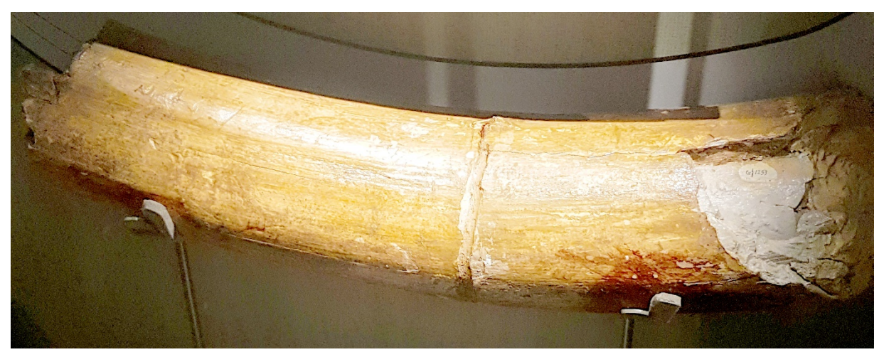
7: mammoth tusk fragments from Baldock, on display in North Hertfordshire Museum

Some Neanderthal tools have been found in North Hertfordshire. They include a miniature handaxe from Letchworth Garden City, a bout coupé handaxe from Hitchin and a poorly made Levallois point from Baldock. There are also some mammoth remains from Baldock, including part of a tusk now on display in North Hertfordshire Museum. It was found when the Salisbury Road estate was being built in 1920, close to the line of a winterbourne (a stream that flows only in winter) and had perhaps been chased into a boggy hollow where it was killed. We do not know if the rest of the skeleton is still underground, awaiting discovery.