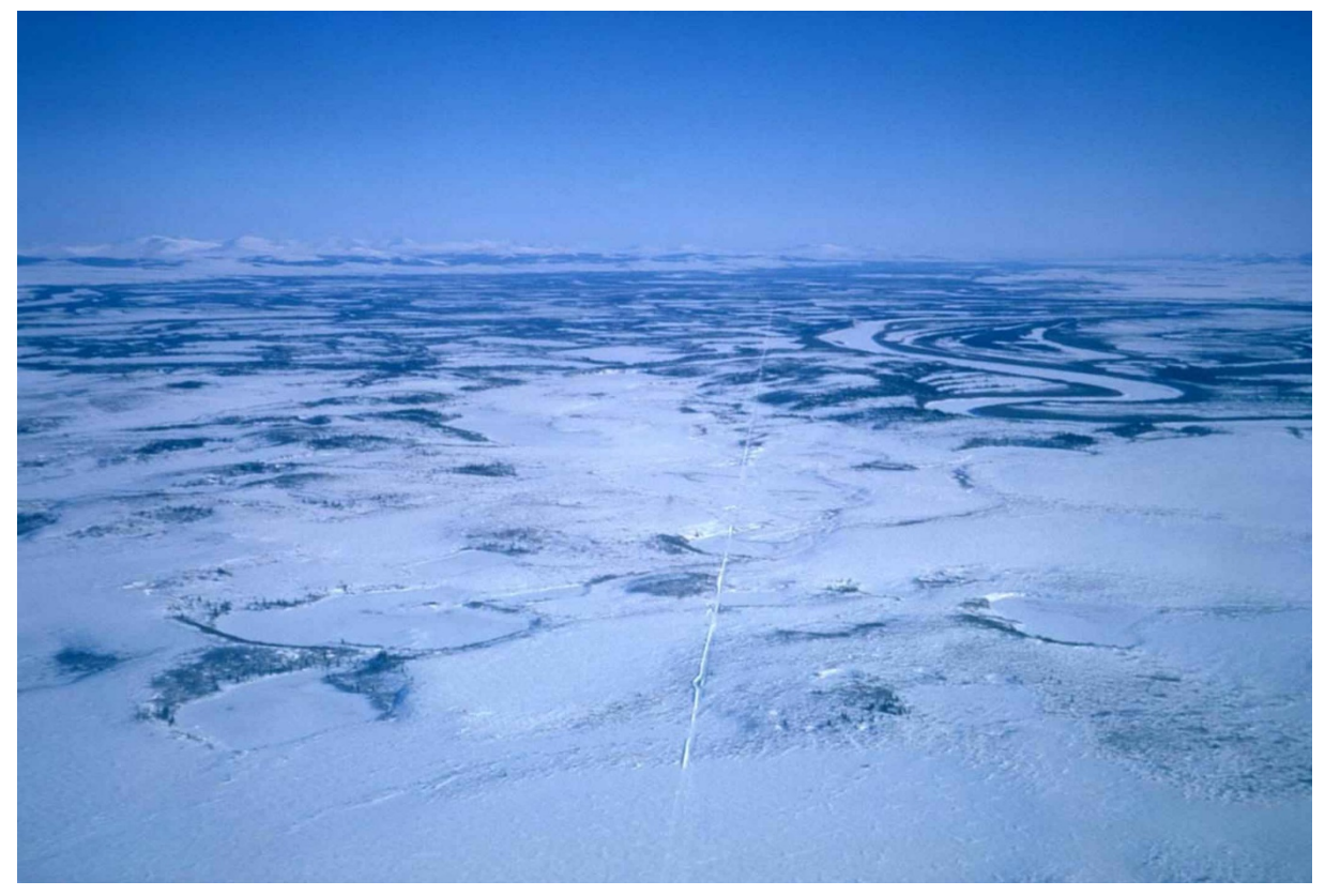
I: an Arctic ice sheet

Thinking about 'the lce Age' brings up images of tundra, mammoths, Neanderthals and great sheets of ice across the landscape. This simple picture is wrong in many ways. Firstly, there have been many different 'lce Ages' in the history of the earth. The most dramatic happened between 2.4 and 2.1 billion years ago, known as the Huronian Glaciation. About the same time, earth's atmosphere suddenly became rich in oxygen, and some scientists believe that the atmospheric changes reduced the temperature so much that the whole planet became covered in ice.