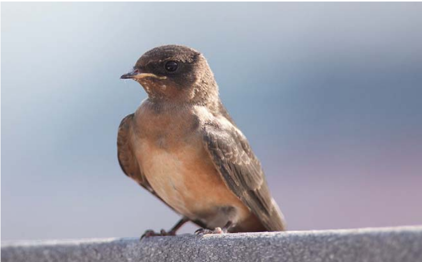
Juvenile Cliff Swallow x Barn Swallow hybrid, Orleans , © Christopher L. Wood. The underparts appear most similar to Barn Swallow, with the darker breast that is offset from the paler belly. Note the paler head with dark markings on the throat, which are intermediate between Barn Swallow and Cliff Swallow. See note p. 307.