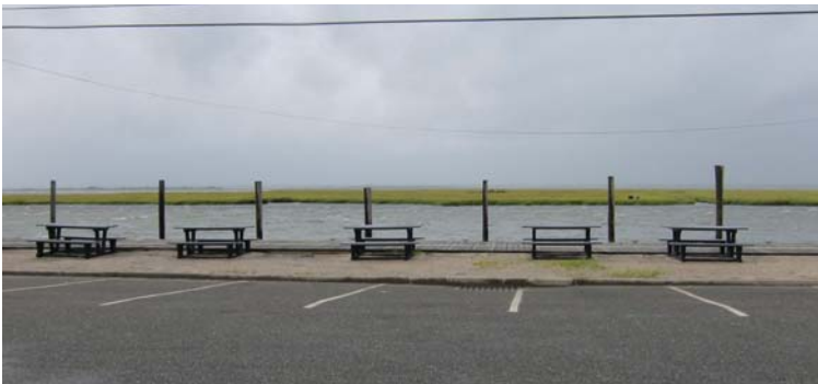
Irene at landfall in New York, 28 Aug 2011; The parking lot and bayside marsh at Gilgo Beach, Suffolk, 28 Aug 2011; 9:30 EDT (middle) and 16:30 EDT (bottom)