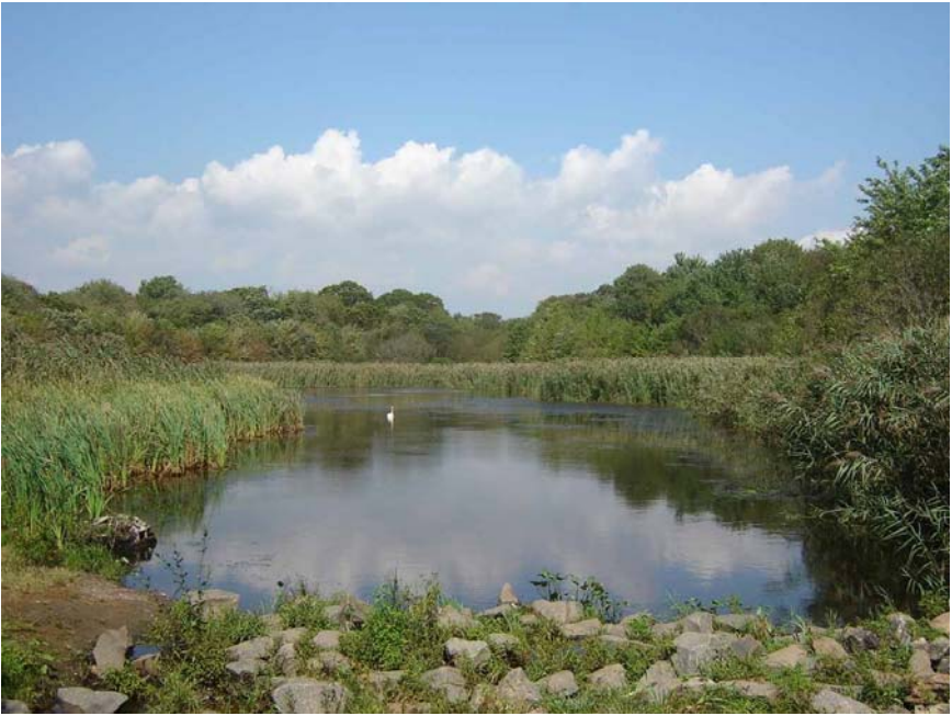
Massapequa Preserve, Nassau, See article on breeding by Least Bittern at this site, pp. 290-292.