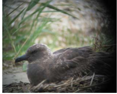
Leach's Storm-Petrel, New York Harbor, Kings, 28 Aug 11, South Polar Skua, Sea Cliff, Nassau, 28 Aug 11