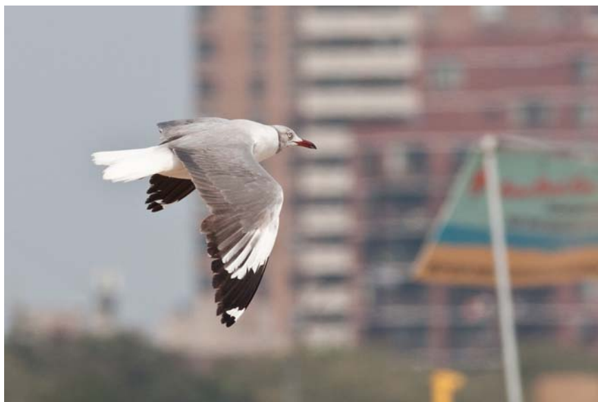
Gray-hooded Gull ( Chroicocephalus cirrocephalus ), Coney Island, Kings; top image 2 Aug 11, © Steven D'Amato; lower image 1 Aug 11, © Peter Post.