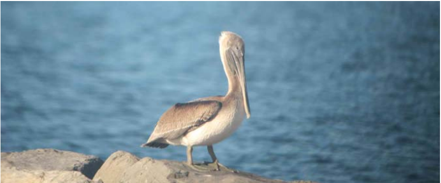
Brown Pelican, Patchogue, Suffolk, 30 Aug 11