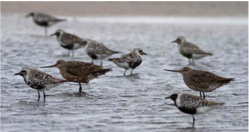
Hudsonian Godwits and Black-bellied Plovers, Floyd Bennett Field, Kings, 28 Aug 11