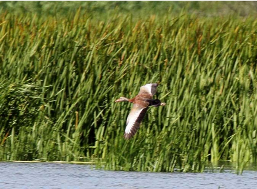
Black-bellied Whistling-Duck, Randolph, Cattaraugus, 25 Aug 11, © Dominic Sherony.