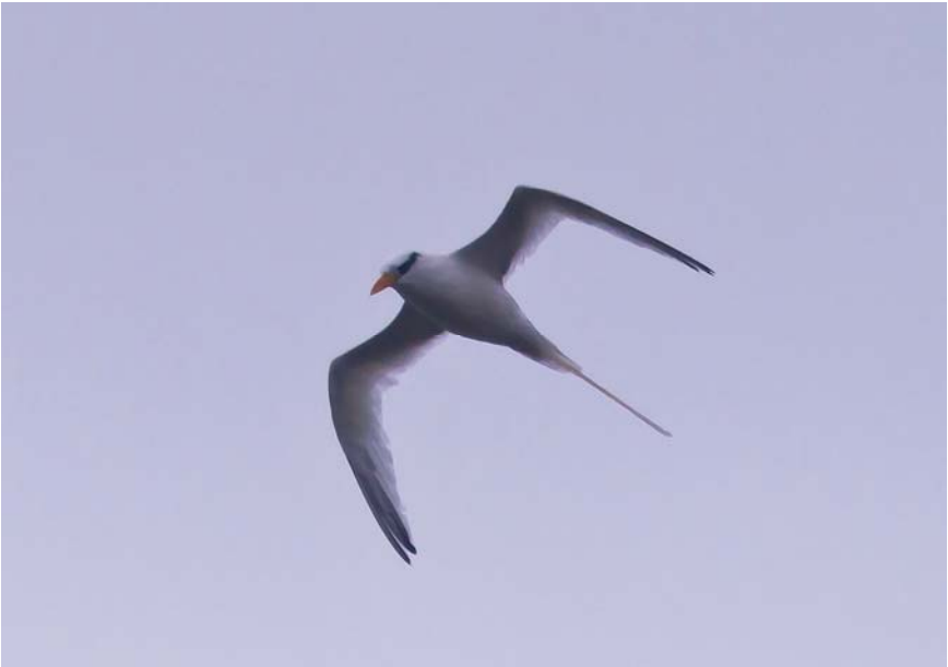
Bridled Tern (juvenile) and White-tailed Tropicbird, near Jones Inlet, Nassau , 28 Aug 11, © Steve Walter.