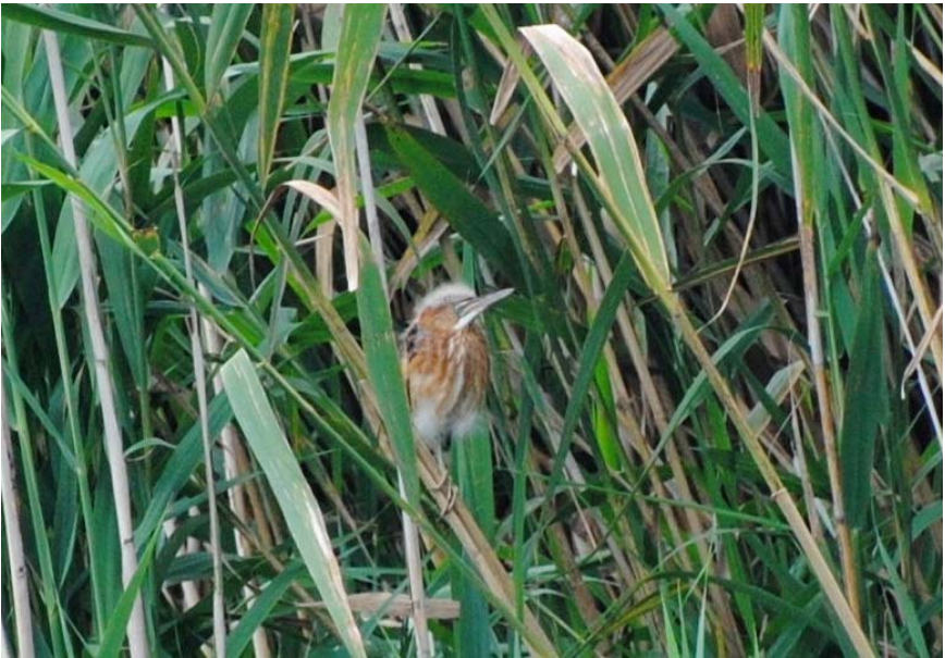
Juvenile Least Bittern, Massapequa Preserve, Nassau, 24 Jul 11