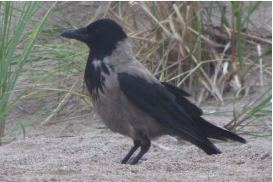
Hooded Crow ( Corvus cornix ), Great Kills Park, Richmond, 22 Jun 11, © Corey Finger.