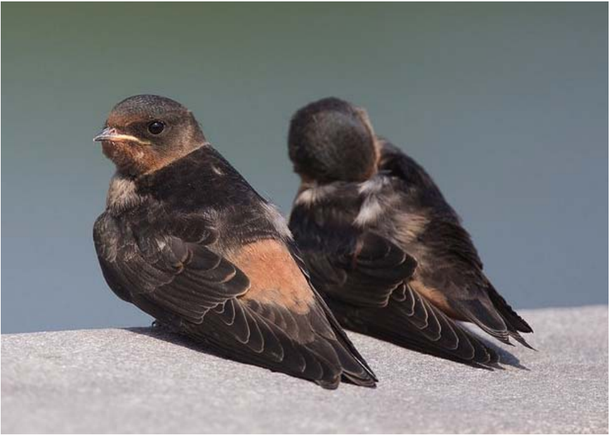
Juvenile Cliff Swallow x Barn Swallow hybrid, Orleans , © Christopher L. Wood. From above, this bird appears very similar to Cliff Swallow with a contrasting tawny rump. Note, however the more strongly forked tail and odd face pattern. See note p. 307.