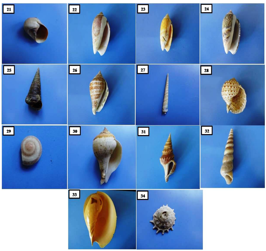
Figure 3: Distribution of Gastropods in Pulicat Lagoon.