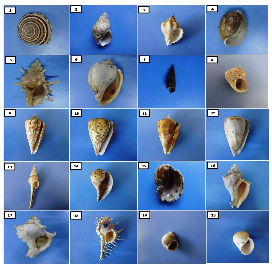
Figure 2: Distribution of Gastropods in Pulicat Lagoon.

Gastropods and bivalves are generally benthic organisms and they are frequently used as bio indicators of aquatic health. A similar study was conducted at a few localities from the Raigad District the Maharashtra West Coast of India. Nearby 22% bivalves and 78% gastropods were recorded throughout October 2010 to September 2011 (Khade and Mane, 2012). In total 55 species of molluscs representing 13 orders, 30 families and 39 genera were recorded from the mangroves of Uran, Maharashtra (Pawar, 2012). An analogous study was carried out at Dadar and Juhu beach in Mumbai that revealed the availability of 19 genera and 14 families collectively on both coast lines. Most number of Bivalves belonged to the Cardidae while maximum Gastropods were from Trochidae family (Joshi et al., 2013). The study revealed that there is a good diversity of molluscs.