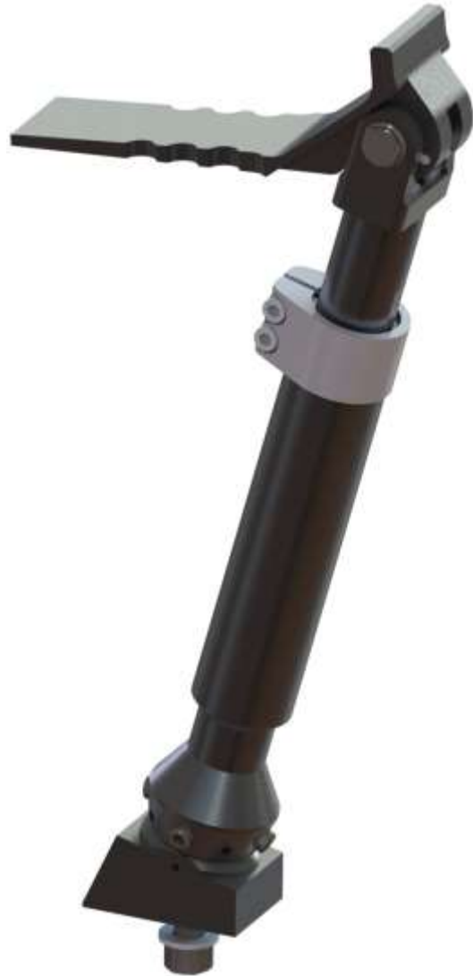
Illustration: Hipo-gross-Aqua ( CAD Animation )

The Hipo-gross-Aqua is the first waterproof prosthetic hip joint available for hip disarticulation patients.