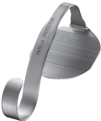
RESECTED PATELLA PROTECTOR OM 82-0075 3 1/2" (83mm) length