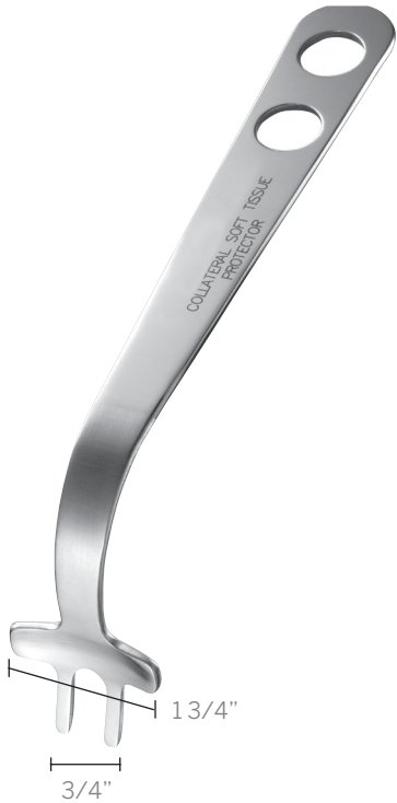
COLLATERAL SOFT TISSUE RETRACTOR OM 82-0060 9 1/8" (232mm) length