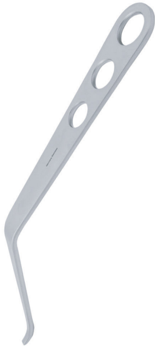
TIBIAL RETRACTOR OM 82-0034 9" (229mm) 3 hole