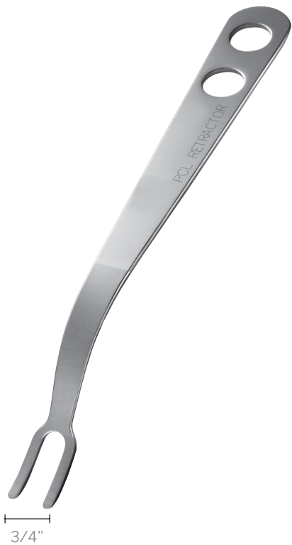
PCL RETRACTOR OM 82-0055 10 1/2" (267mm) length