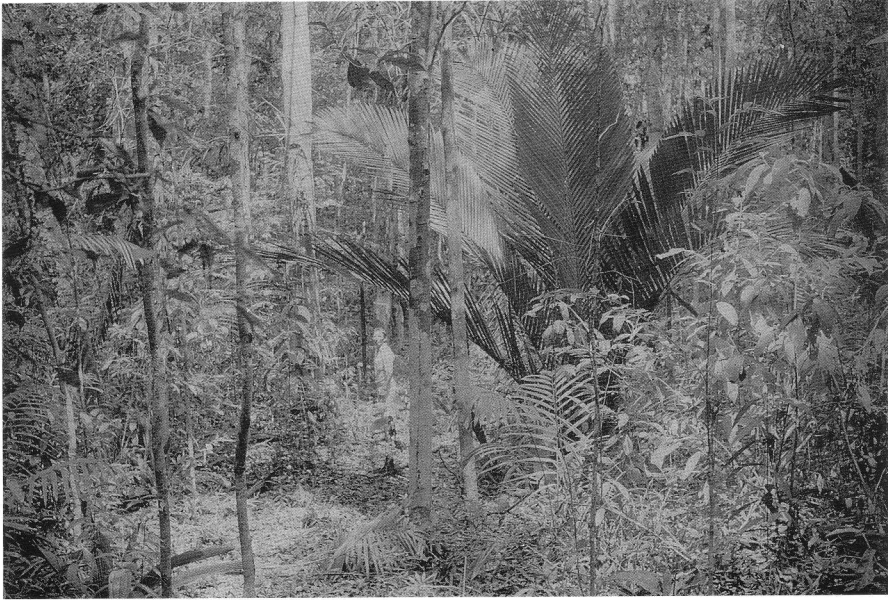
2. Orbignya sagotii in one of the Jari forests studied.

ovate, reddish-brown, and the rachis bears some 140 mature fruits. Each fruit has one single seed within the thick and hard mesocarp. Found in association of Ananas ananosoides , the species occurs most frequently in poor sandy soils. The only known economic importance of this palm is that the leaves are used to cover local dwellings.