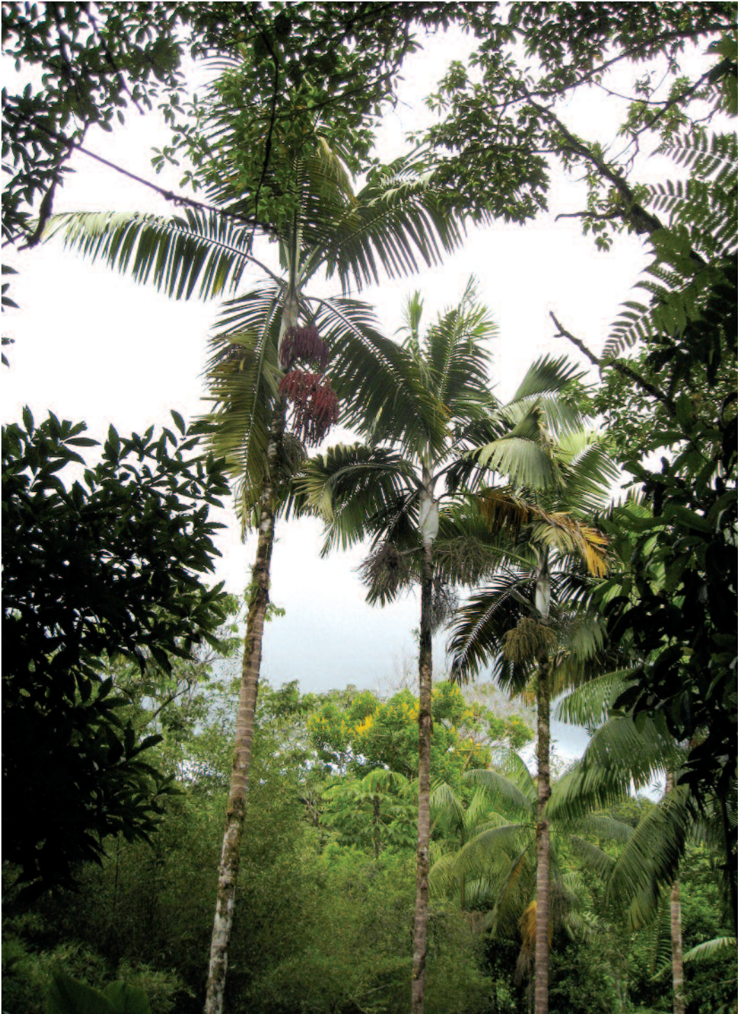
8. Row of mature Heterospathe barfodii trees at Las Cruces Biological Station, Costa Rica.

Conservation status: This palm meets the criteria for threat category Critically Endangered (CR B1ab(i,ii, iii, iv, v), C2(ai, aii), D; IUCN 2001) as it is only known from a small population at a single location, and