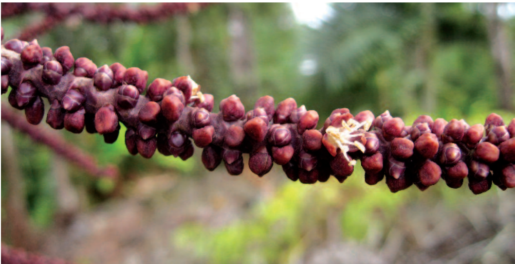
6. Staminate flowers of Heterospathe barfodii on rachilla at anthesis (Photo: John Dransfield).