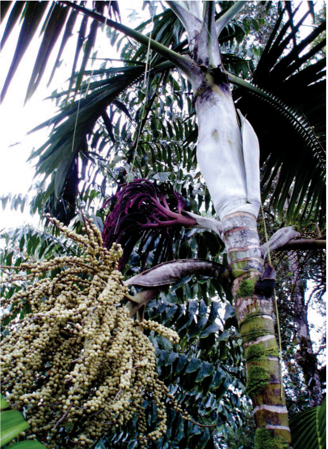
5. Heterospathe barfodii growing at Floribunda Palms and Exotics, Hawaii, showing crownshaft, inflorescence and developing infructescence.