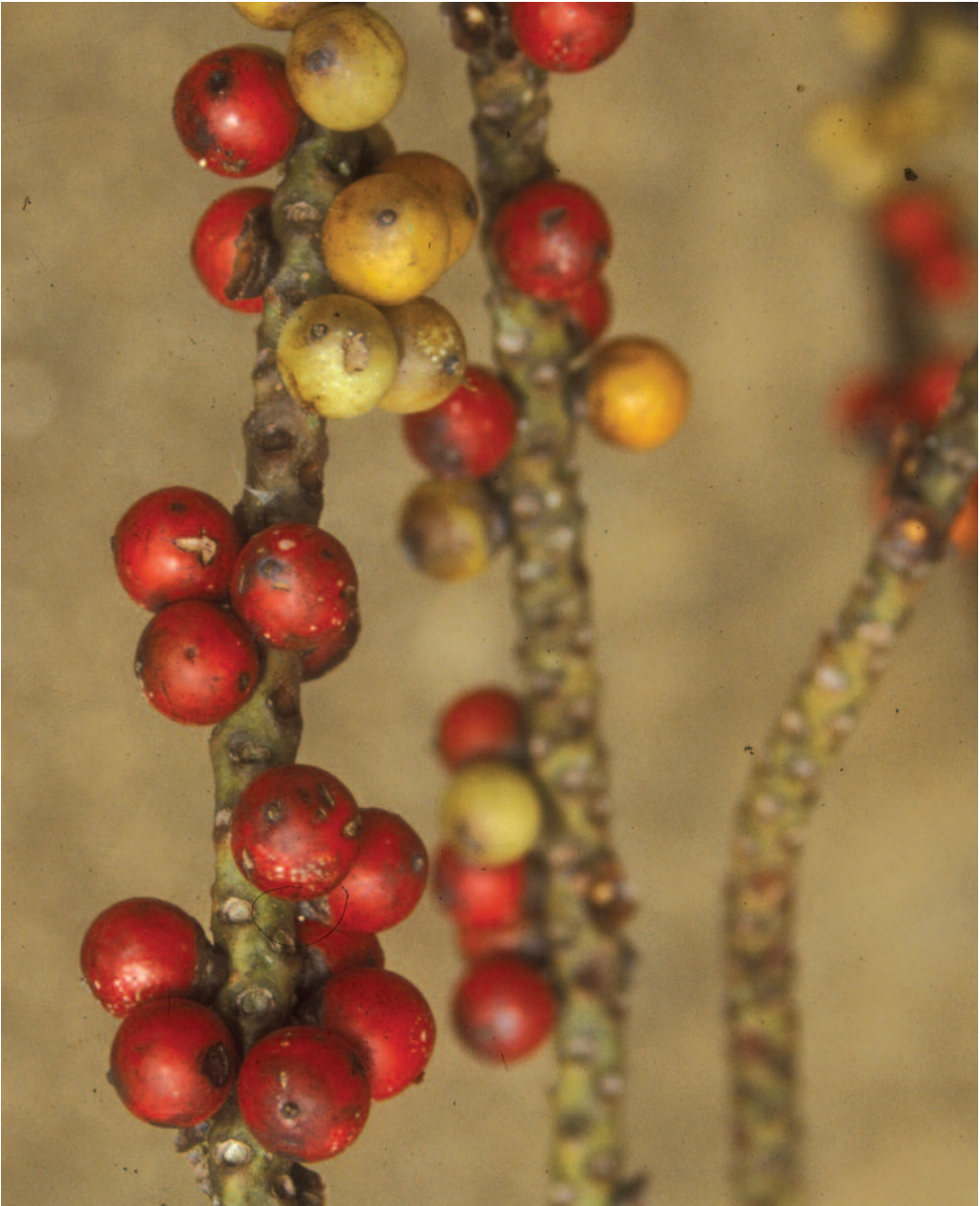
7. The fruits of Heterospathe barfodii.

trifid. Pistillate flower immature, bud ca. 4.9 mm long, ca. 2.7 mm in diam., globose-ovoid, deep maroon; gynoecium ca. 2.1 mm long, ca. 0.9 mm in diam., perianth imbricate. Fruit 1 cm in diam., spherical, surface striate, red when mature; perianth cupule clasping; stigmatic remains subapical; endocarp thin bony, dark brown; occasionally bilobed with two developed carpels or one developed and one partially developed carpel. Seed 7 mm in diam., spherical, pale brown; endosperm ruminant; embryo basal.