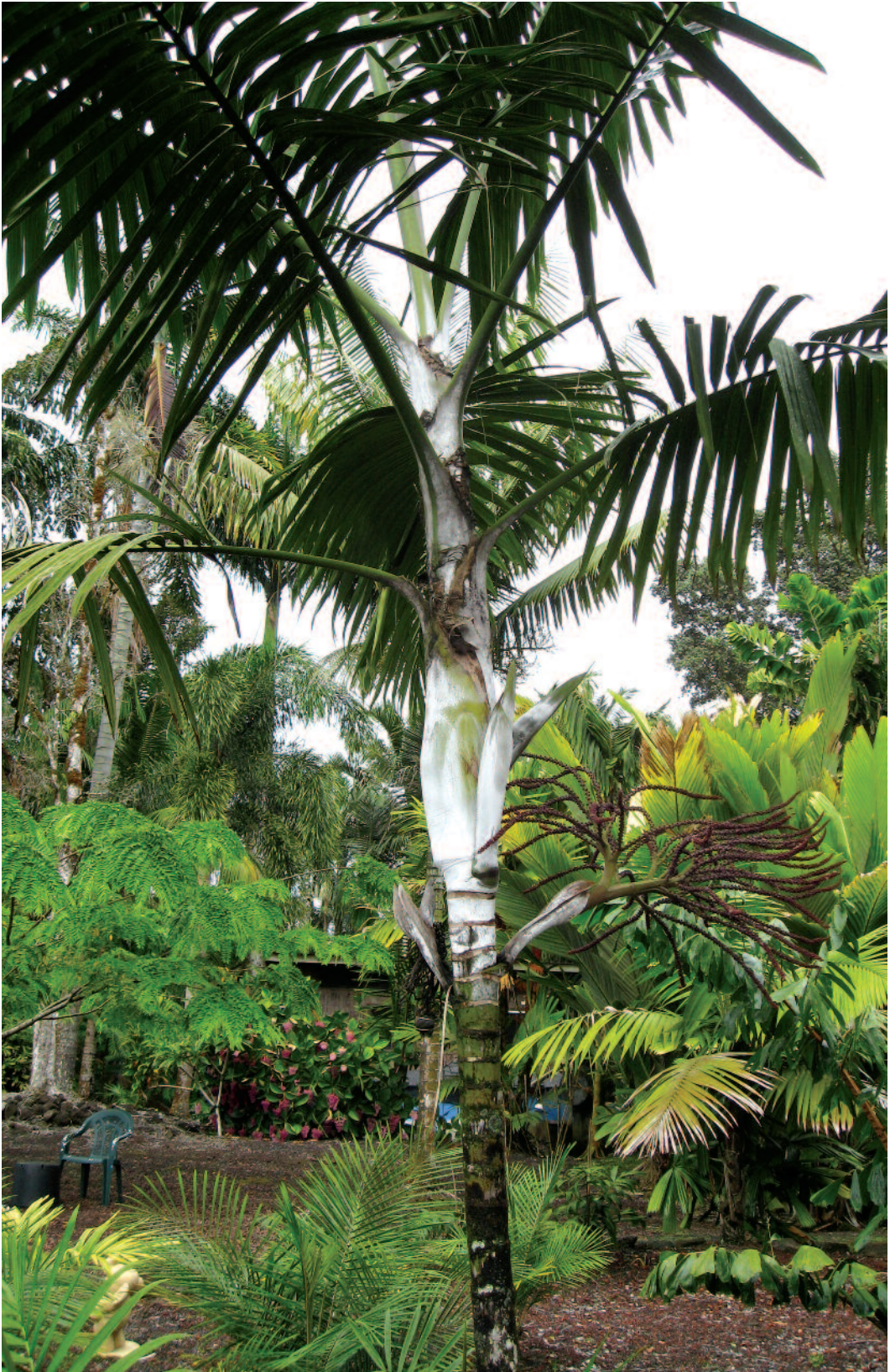
4. Heterospathe barfodii growing at Floribunda Palms and Exotics, Hawaii.