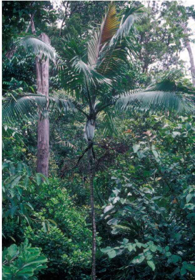
1. Heterospathe barfodii in type locality, showing habit.

2 Floribunda Palms, P.O. Box 635, Mountain View, HI 96771, USA