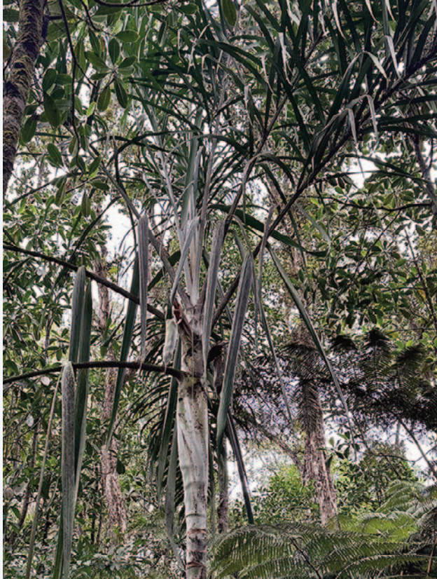
Chrysalidocarpus basilongus with its pendulous basal leaflets.