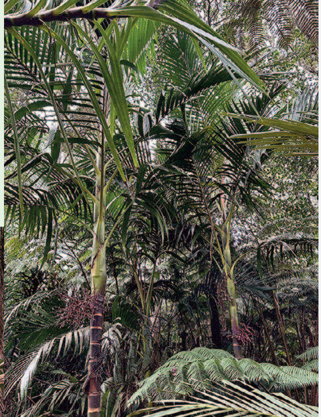
Calyptrocalyx albertisianus with an emergent red leaf (below).