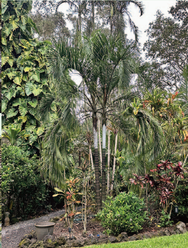
Chrysalidocarpus ambostrae (below).