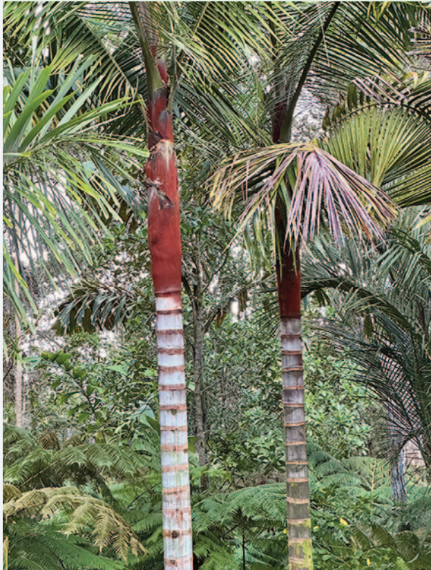
Chrysalidocarpus lastellianus .