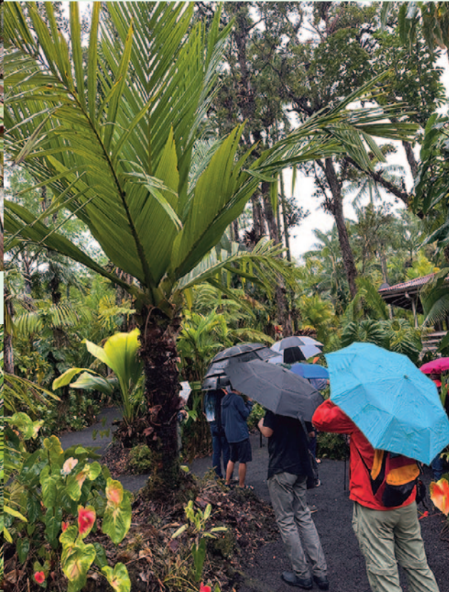
After a wonderfully sunny and unusually dry biennial, finally umbrellas made an appearance.