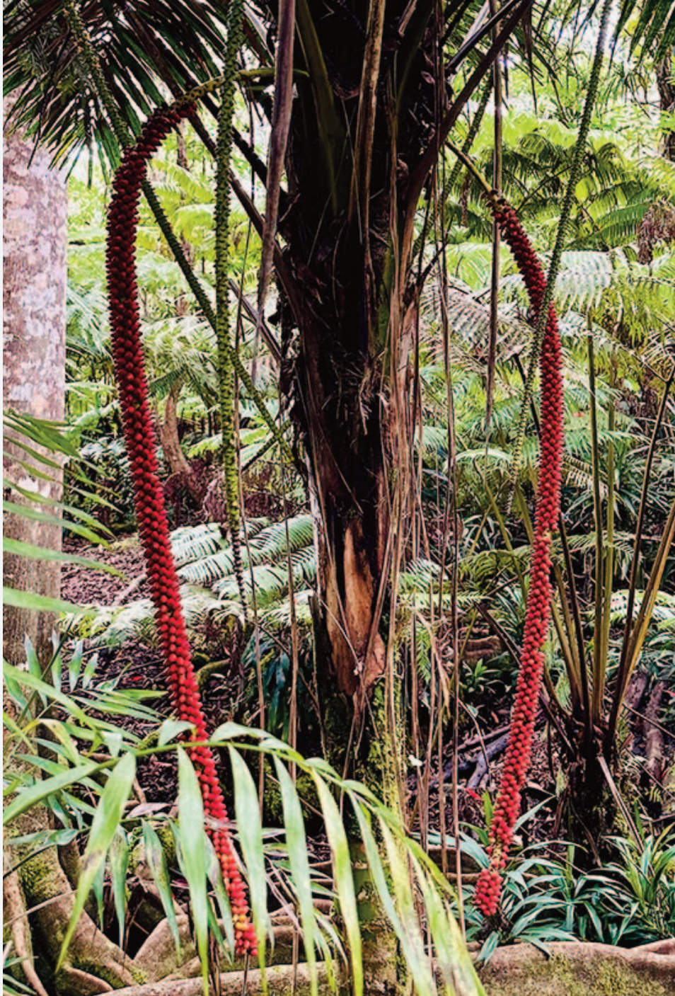
The bright red, long and unbranched inflorescence of Laccospadix australasicus in the Cloud Forest.