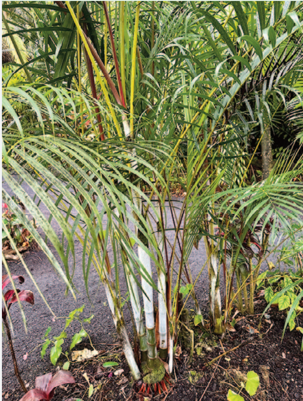
A form of Chrysalidocarpus arenarum , with beautiful red petioles.