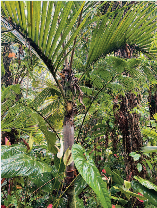
Chambeyronia lepidota , found in high elevations in New Caledonia (below).