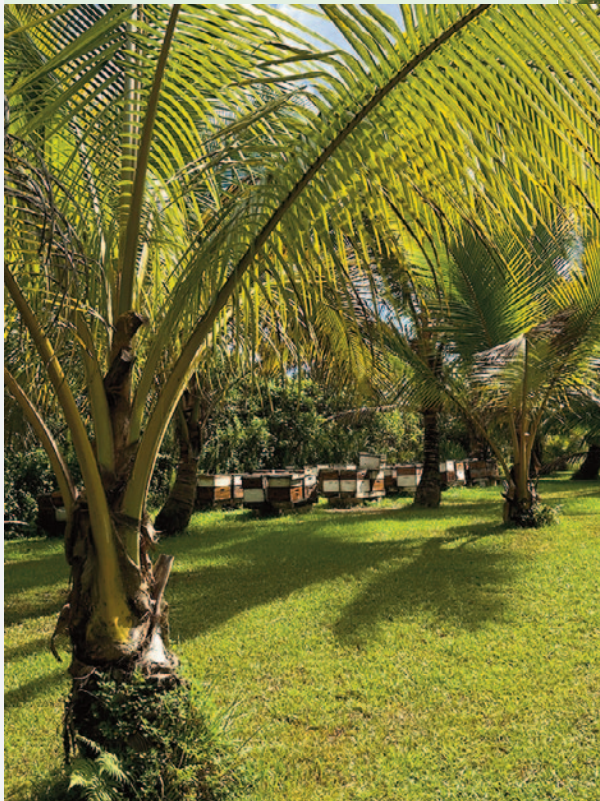
Coconut grove and apiary.