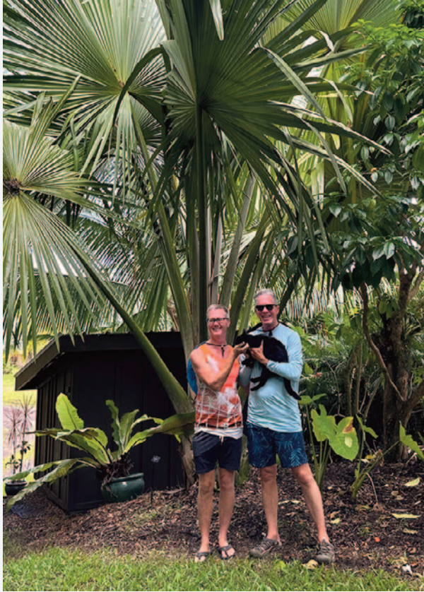
Our gracious hosts with Puna (the cat) and a splendid Tahina spectabilis .