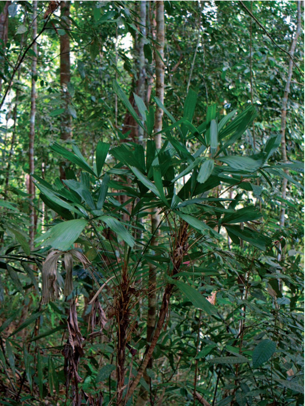
3. Licuala hairulii , with stemmed habit.

× 6–8.5 cm; lateral leaflets narrowly elliptic with truncated apex, progressively smaller towards base, 2–4 costulate, 13–16 × 1–3 cm. Inflorescence interfoliar, spreading to patent, ca. 17–36 cm long, spicate or bifurcating with only 1 partial inflorescence; prophyll 14–21 ×