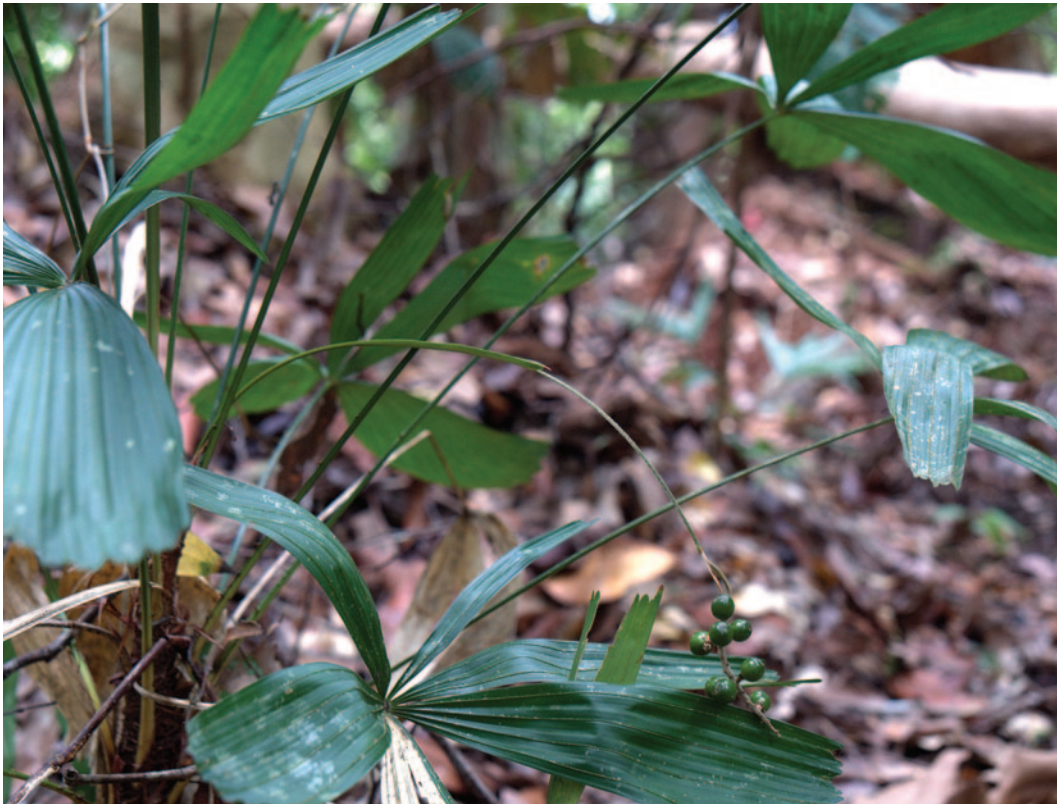
4. Licuala hairulii , inflorescence with immature fruits.

like to 2\text{--}3.5 \times 0.2 cm, covered with caducous indumentum subtending a spicate or bifurcating rachillae; rachillae 2–5 cm long, ca. 1 mm diameter, densely covered with fine translucent white and brown simple hairs. Flowers (based on young fruiting specimen) solitary, loosely arranged around the rachillae, on floral stalk, floral stalks subtended by small scale-like triangular bracts; calyx membranous, striate, cyathiform with pedicelliform base and truncated apex, covered with simple hairs at pedicelliform base and apically glabrous, 1.3\text{--}1.5 \times 2 mm; corolla tubular at base breaking into 3 lobes, drying black, fleshy, glabrous, striate, lobes 3 \times 2 mm; androecium and gynoecium not seen. Immature fruits globose, glabrous, smooth epicarp, green, 6 mm across.