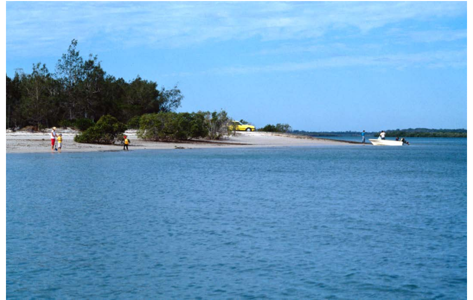
Legal fishing is allowed in declared FHAs – Burrum declared FHA, Wide Bay Burnett.