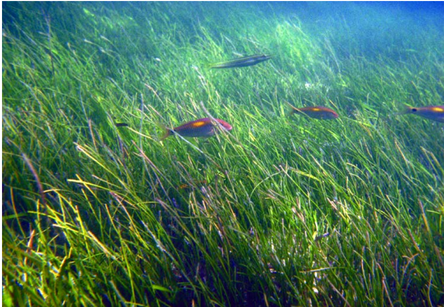
Seagrass meadows, like all fish habitats in declared FHAs, are protected.