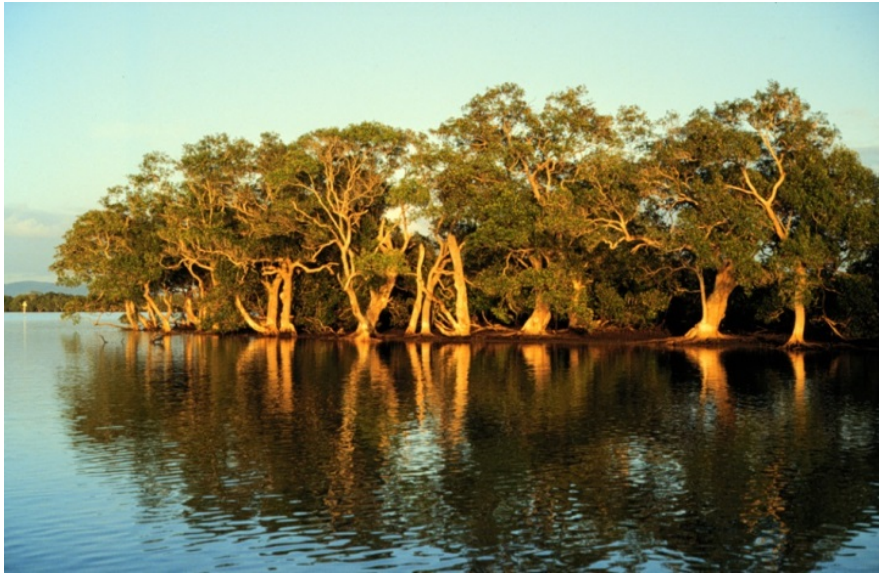
Jumpinpin-Broadwater declared FHA, South East Queensland.