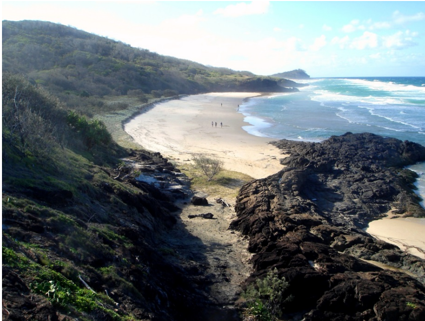
Fraser Island declared FHA, South East Queensland.