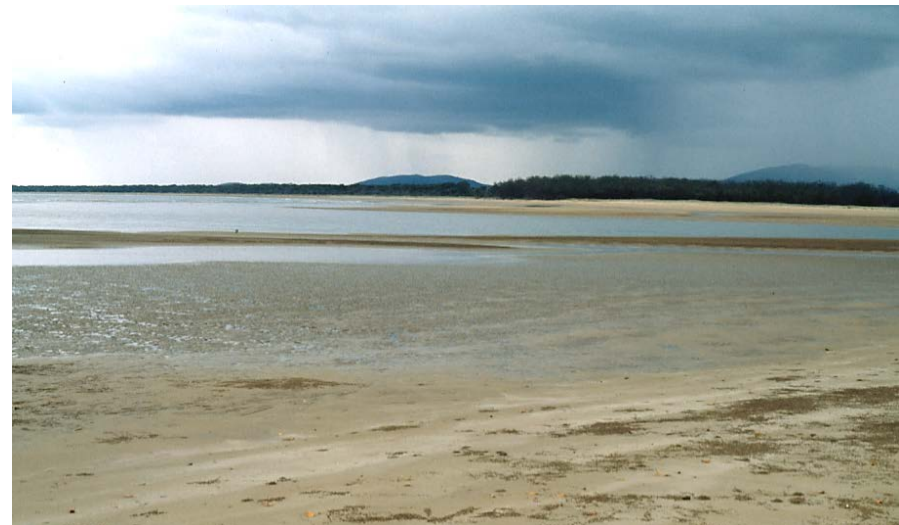
Eurimbula declared FHA, Central Queensland.

government also plays an important role in planning, development, environmental protection and compliance.