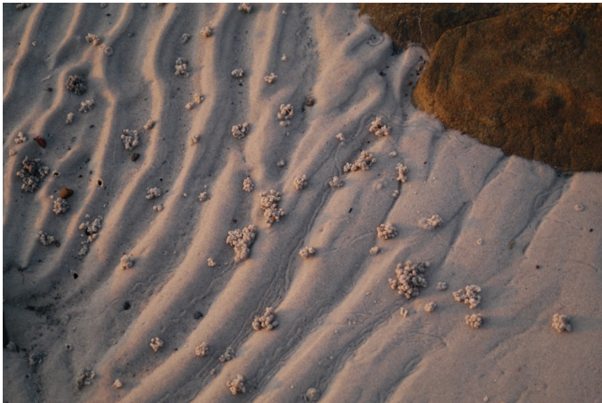
Unvegetated fish habitats are protected in declared FHAs.