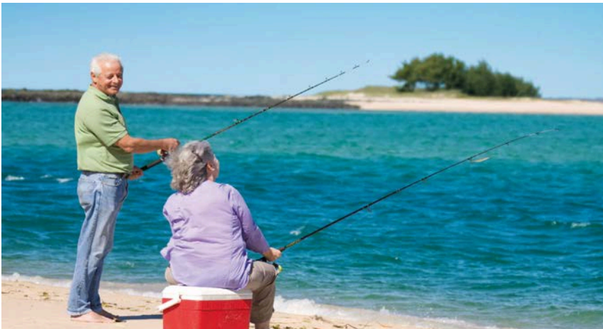
Fishing at Elliott River declared FHA, Wide Bay Burnett.