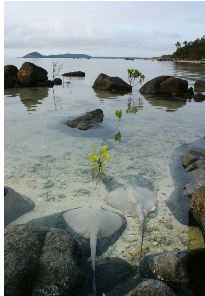
Healthy fish habitats support fish and fisheries.

Strengthen declared FHA policy – QPWS will ensure legislation, policies and planning processes are effective to manage the declared FHA network.