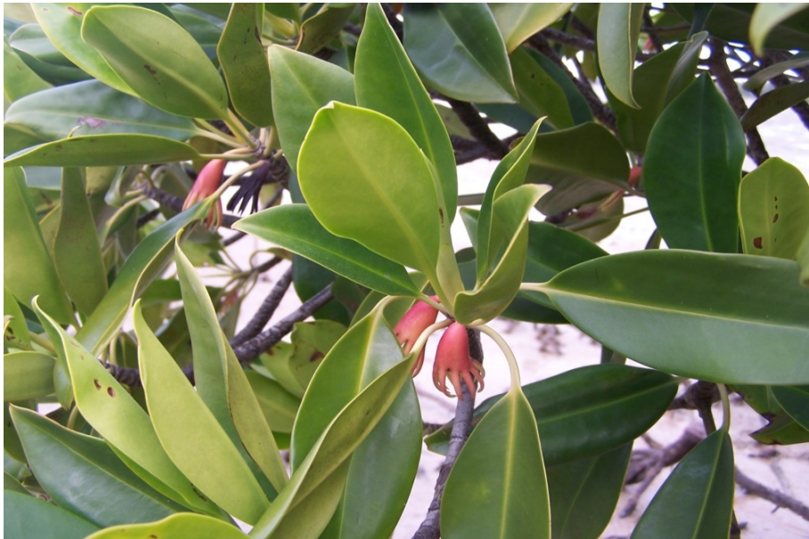
Large-leafed orange mangrove.