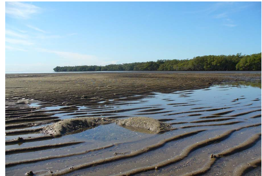
Kippa-Ring declared FHA, South East Queensland.

Implementation of this strategy will occur over the next five years within the existing QPWS budget and resources available, and using external funding as it becomes available.