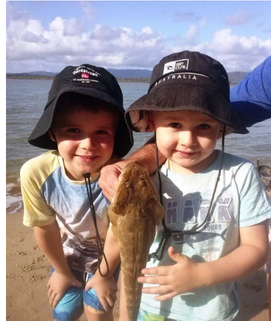
Healthy fish habitats = healthy fisheries.