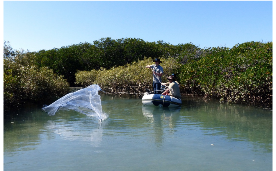
Ecological and fisheries research is allowed and encouraged in declared FHAs.