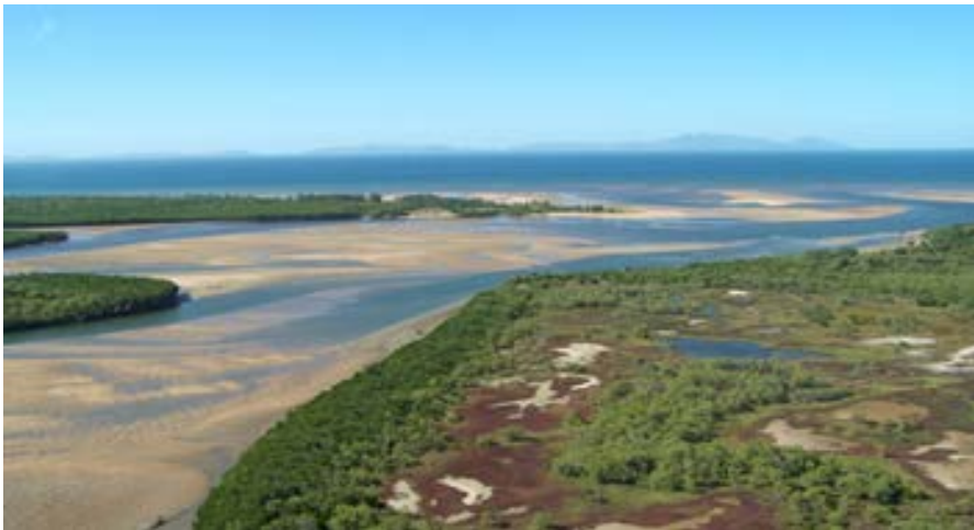
Cattle-Palm Creeks declared FHA, North Queensland.

The management of the declared FHA network focuses on statutory roles and approvals in a strong legislative setting.