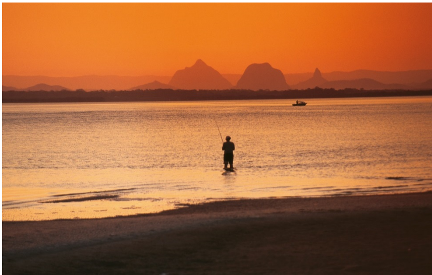
Pumicestone Channel declared FHA, South East Queensland.