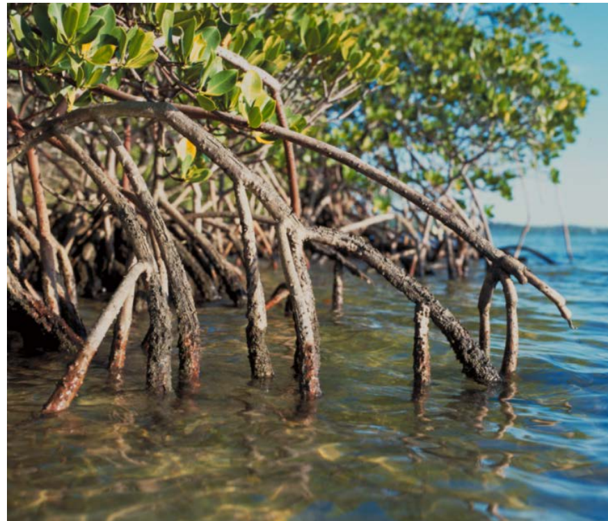
Hinchinbrook declared FHA, North Queensland.

In 2012 the first assessment of the declared FHA network was undertaken. The assessment considered the status of each declared FHA