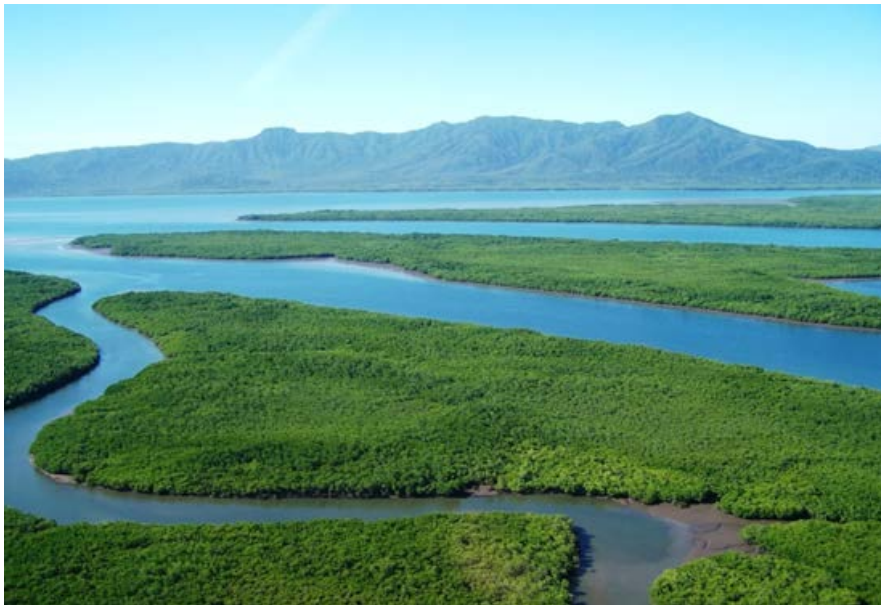
Hinchinbrook declared FHA, North Queensland.

The Queensland Boating and Fisheries Patrol undertakes declared FHA compliance. Challenges when undertaking declared FHA compliance investigations include establishing whether the activity occurred within a declared FHA by locating boundaries 'on the ground', identifying the person/s responsible for offences and achieving successful restoration outcomes.