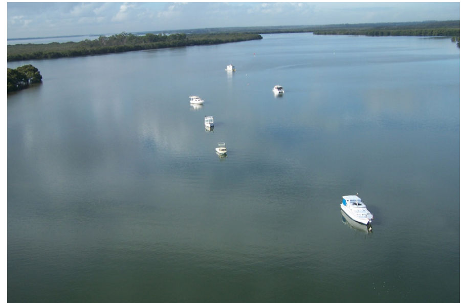
Above: Pumicestone Channel declared FHA, South East Queensland.