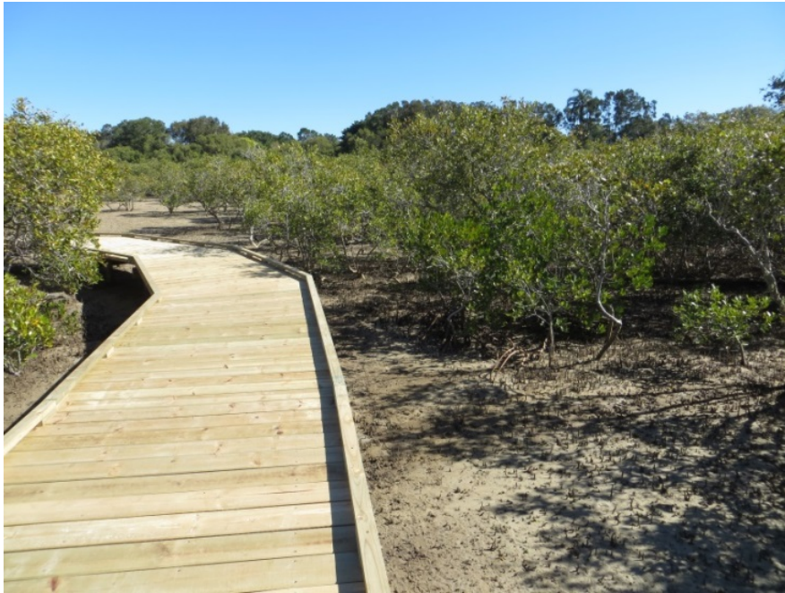
Currumbin Creek declared FHA, South East Queensland.