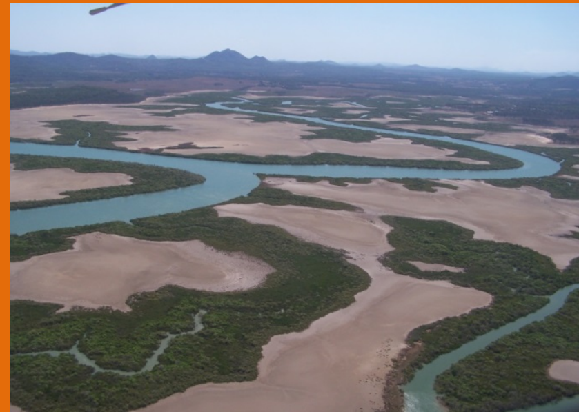
Cawarral Creek declared FHA, Central Queensland.

Due to these actions the Cawarral Creek declared FHA is now one of the most well-researched declared FHAs, and will likely achieve a greater rating in the next assessment report.