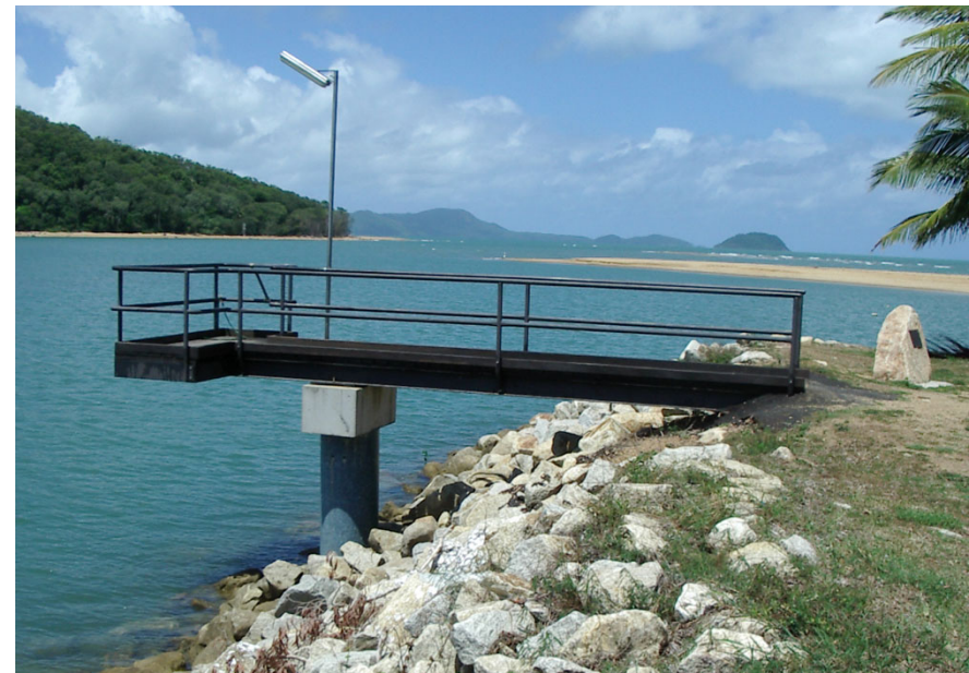
Fishing platforms may be approved in declared FHAs.

In management A areas, development is limited to activities like constructing public fishing infrastructure, ensuring public health and safety, maintenance of existing structures, constructing temporary structures, installing underground public infrastructure, managing fisheries resources or fish habitats (e.g. installing a boardwalk for access), research and education, and environmental restoration. In management B areas construction of some private structures (e.g. pontoons, boat ramps, revetments, buoy moorings) and beach replenishment may also be allowed.