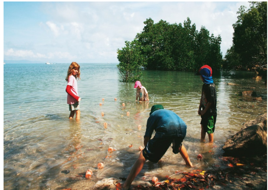
Children fishing, Far North Queensland.

Consolidate the declared FHA Network – QPWS will ensure a comprehensive, adequate and representative declared FHA network that effectively supports the state's fisheries through the protection of critical fish habitats.