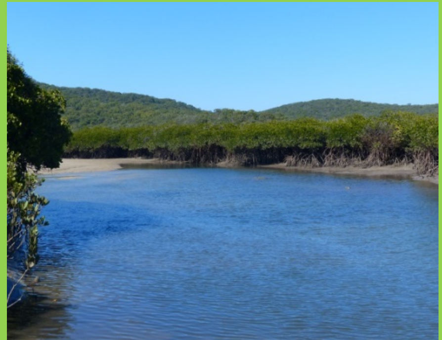
Leekes Creek, Great Keppel Island, an area nominated by the community for FHA investigation.

The investigation program is an example of where external funding has provided an opportunity to advance the objectives of the Declared FHA Network Strategy to benefit the network.