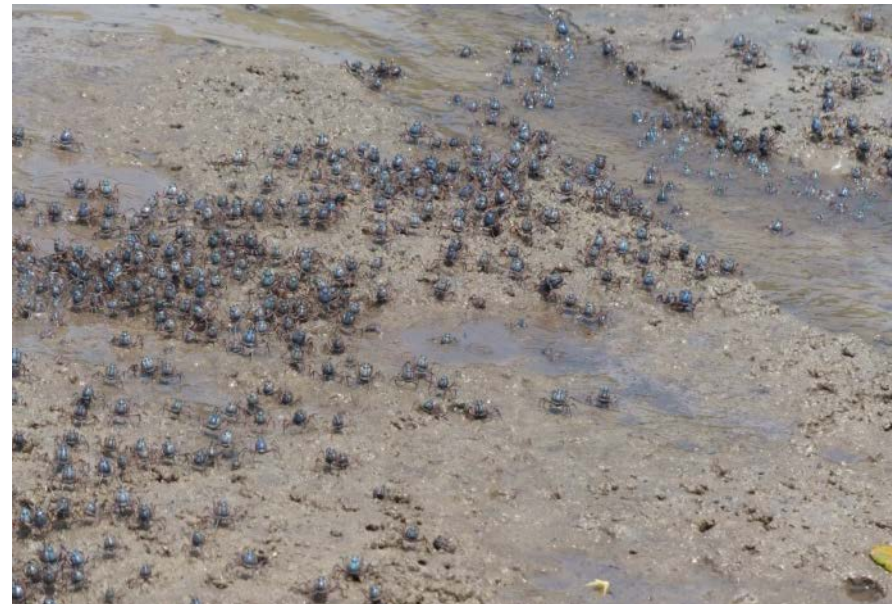
Soldier crabs in Leekes Creek, Central Queensland, an area under FHA investigation.