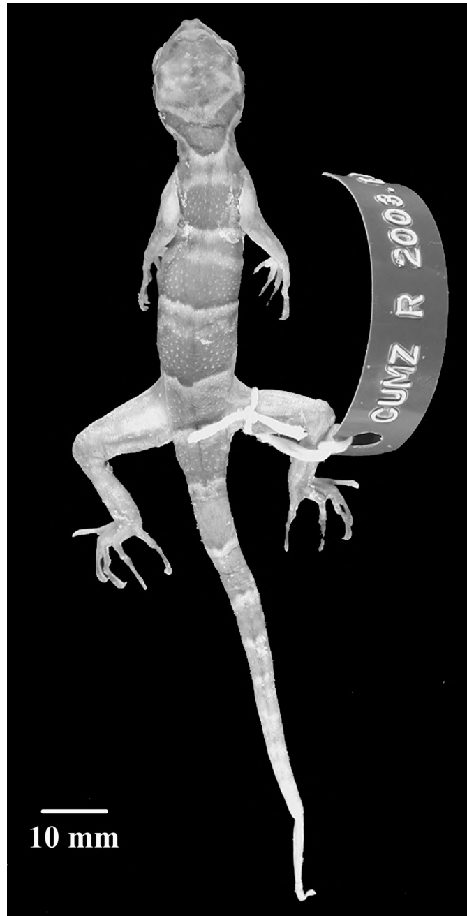
FIGURE 4. Holotype (IRSNB 2585) of Cyrtodactylus chanhomeae , sp. nov. from Phraya Chat-tan Cave, Phraputthabata District (Khun Khlon Subdistrict), Saraburi Province, Thailand. Note the elongate limbs and digits, and conspicuous dorsal markings.

Paratype. —Chulalongkorn University Museum of Zoology (CUMZ) R 2003.62, adult male; Thailand, Saraburi Province, Phraputthabata District, Khun Khlon Subdistrict, Thep Nimit Cave; 14°42'N 100°51'E; collected by Montri Sumontha, 23 May 2003 (15:50).