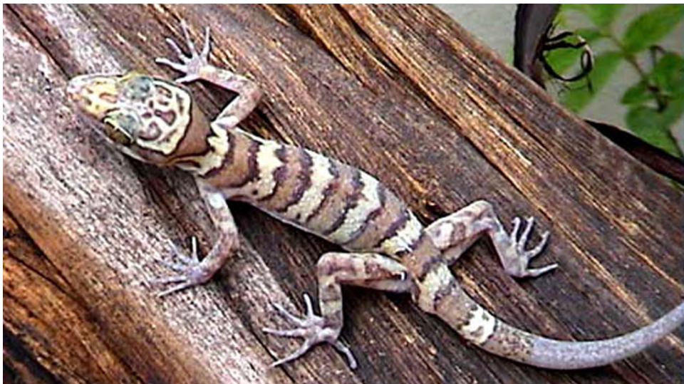
FIGURE 3. Living specimen of Cyrtodactylus tigroides , sp. nov. exhibiting a particularly bold dorsal patterning.