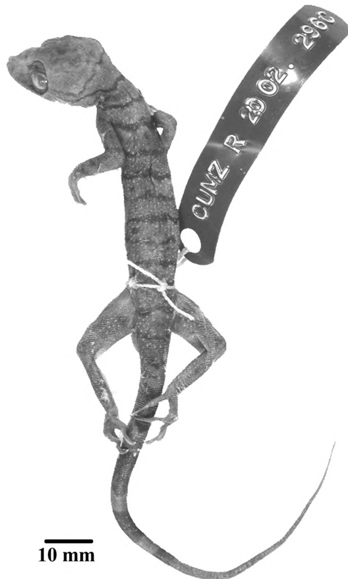
FIGURE 1. Adult male holotype of Cyrtodactylus tigroides , sp. nov. (CUMZ R 2002.296C) from Ban Tha Sao, Sai-Yok District, Kanchanaburi Province, Thailand.

Description (based on holotype, CUMZ R 2002.296C).—Adult male. Snout-vent length 83.22 mm. Head relatively long (HeadL/SVL ratio 0.28), wide (HeadW/HeadL ratio 0.67), not markedly depressed (HeadH/HL ratio 0.43), distinct from slender neck. Lores and interorbital region weakly inflated, canthus rostralis not especially prominent, frontonasal region strongly concave. Snout elongate (SnEye/HeadL ratio 0.43), pointed; longer than eye diameter (OrbD/SnEye ratio 0.63); scales on snout and forehead small, rounded, granular, homogeneous; scales on snout larger than those on occipital region. Eye