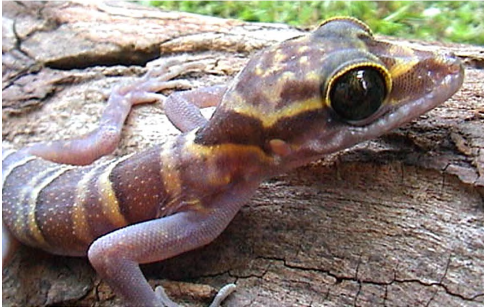
FIGURE 6. Adult male holotype of Cyrtodactylus chanhomeae , sp. nov. (IRSNB 2585) in life. Note the large eyes and pale yellowish markings.

Enlarged basal subdigital lamellae 5–6–7–7–7 (manus), 6–7–7–9–7 (pes); narrow lamellae distal to digital inflection and not including ventral claw sheath: 12–12–13–13–13 (manus), 12–13–14–14–16 (pes). Transversely widened subcaudal plates evident even on regenerated portion of tail. Color pattern similar to holotype, but head markings more pronounced.