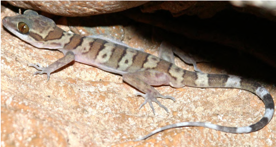
FIGURE 2. Living specimen of Cyrtodactylus tigroides , sp. nov. showing the very long tail, elongate, slender limbs and digits, and characteristic dorsal banding pattern of the species.

acal pores separated from series of 5–7 femoral pores in enlarged scales on each thigh (males and females), absence of precloacal groove, and dorsal color pattern consisting of alternating light and dark bands.