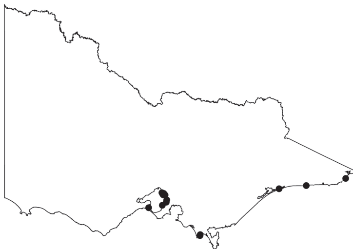
Figure 5. Distribution of Arthonia banksiae .

In his original description of A. banksiae , Müller also noted similarities to the tropical species, A. microsperma , from which his new species differed by