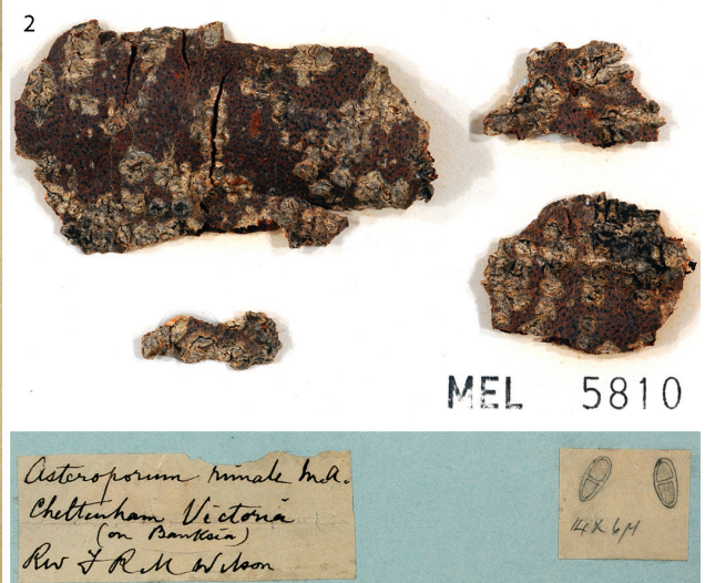
Figure 1. Lectotype of Arthonia banksiae Müll. Arg. (G).