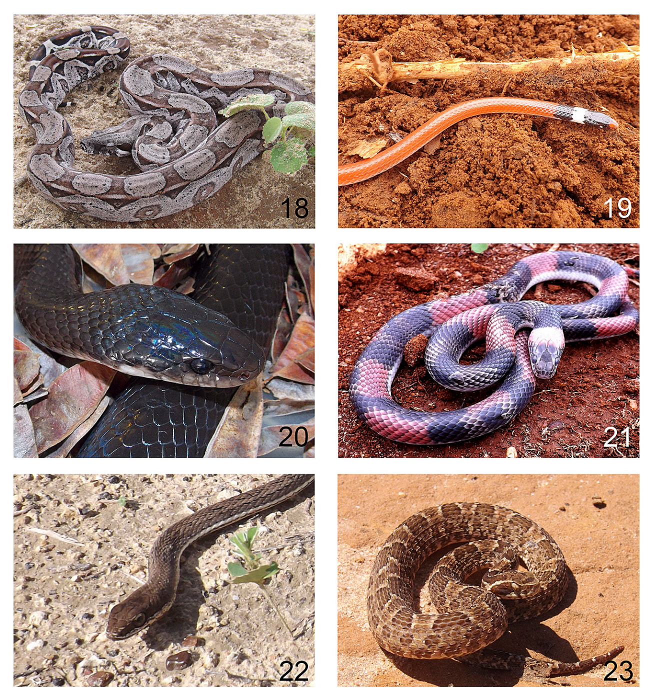
Figures 18–23. Herpetofauna recorded in João Câmara, Rio Grande do Norte, Brazil. 18. Boa constrictor. 19. Apostolepis cearensis. 20. Boiruna sertaneja. 21. Oxyrhopus trigeminus. 22. Philodryas nattereri. 23. Bothrops erythromelas.