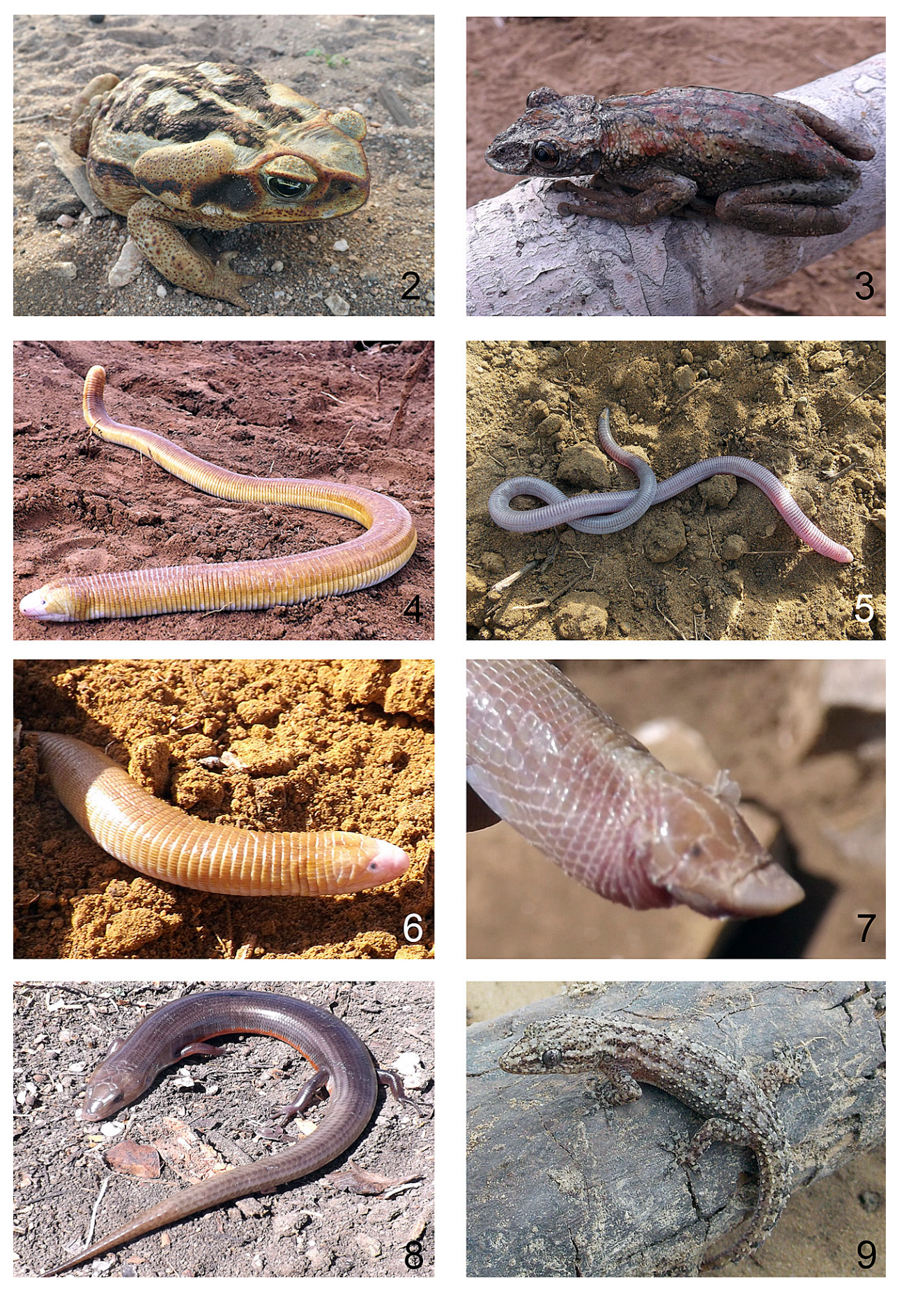
Figures 2–9. Herpetofauna recorded in João Câmara, Rio Grande do Norte, Brazil. 2. Rhinella jimi . 3. Corythomantis greeningi . 4. Amphisbaena alba . 5. Amphisbaena littoralis . 6. Amphisbaena pretrei . 7. Leposternon polystegum . 8. Diploglossus lessonae . 9. Hemidactylus agrius .