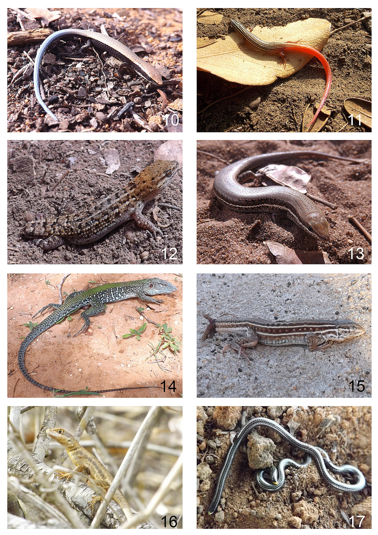
Figures 10–17. Herpetofauna recorded in João Câmara, Rio Grande do Norte, Brazil. 10. Micrablepharus maximiliani . 11. Vanzosaura multis cutata . 12. Gymnodactylus geckoides . 13. Brasiliscincus heathi . 14. Ameica ameiva . 15. Ameivula ocellifera . 16. Tropidurus hispidus . 17. Epictia borapeliotes .