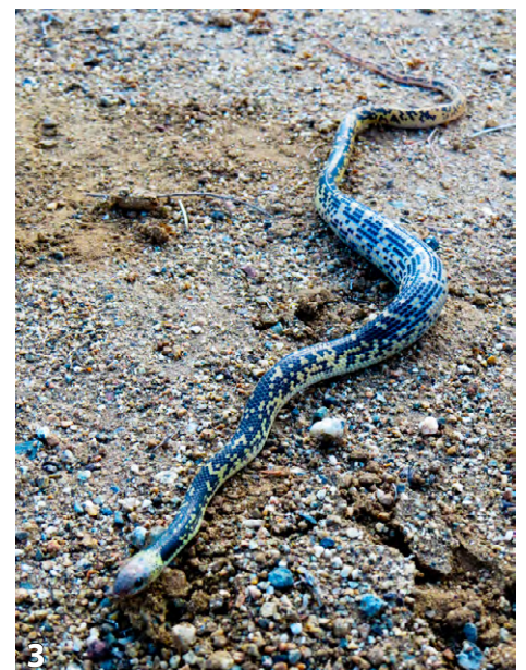
Figures 2, 3. Oxyrhopus fitzingeri . 2. Sex undetermined, length 110 cm. Record of 22 May 2013 (CL-F photo). 3. Sex undetermined length 45 cm. Record of 26 September 2016 (CL-F photo).