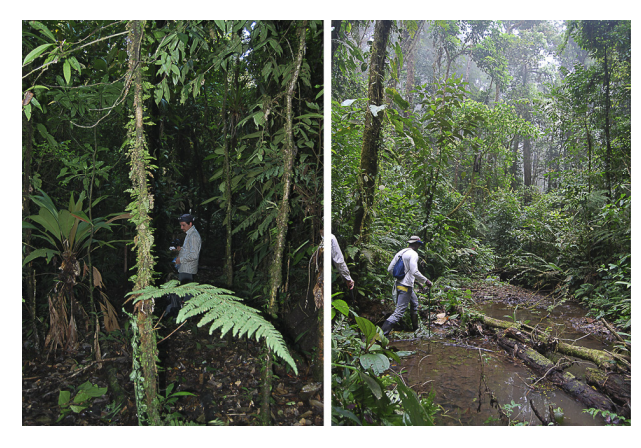
Figure 3. Vegetation type of the habitat where specimens of Imantodes phantasma were recorded at the Cerro Tacarcuna, Unguía municipality, department of Chocó, Colombia.

We collected 3 female adults of I. phantasma (Fig. 2) between 19:30–23:10 h, in a field survey using active searching sampling. These specimens were found on woody vegetation up to 170 cm above ground level, near a creek, in a rainforest with a dense closed canopy exceeding 30 m in height (Fig. 3). The understory where the snakes were found consists of palms, Arecaceae ( Euterpe precatoria , Oenocarpus mapora , Socratea exhorriza , Dyctiocaryum lamarckianum ), and arboreal species of the families Elaeocarpaceae ( Sloanea sp.), Rubiaceae ( Faramea sp., Psychotria sp. and Bathysa sp.), Melastomataceae and Lauraceae, among others. The ground was 90% covered by a thick layer of leaf litter, up to 40 cm in some locations.