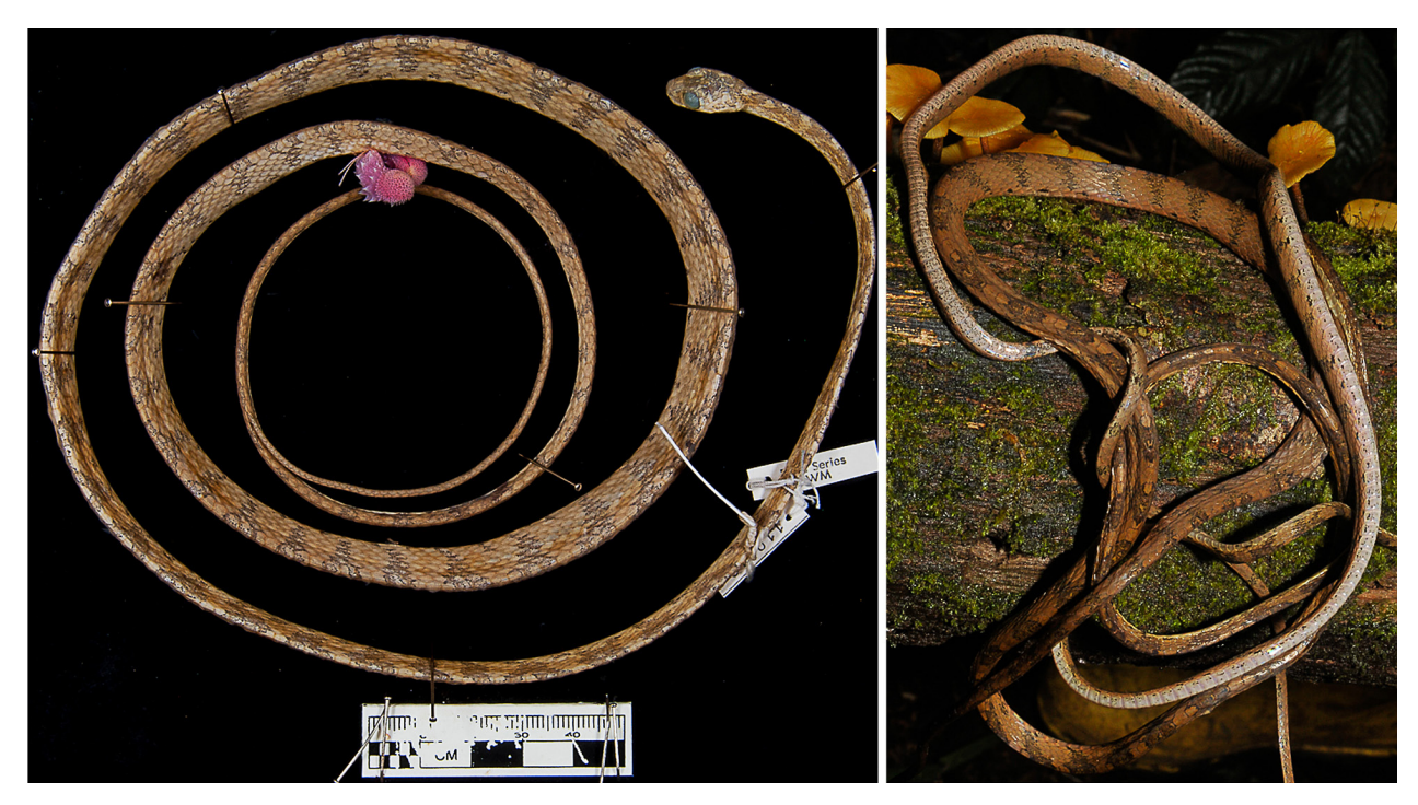
Figure 4. Comparison of the dorsal color pattern between the AMNH-R 109493 (paratype; left) and ICN-R 12801 (in life; right).