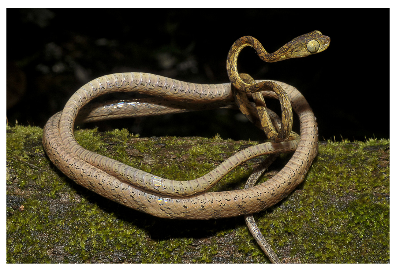
Figure 2. Adult female specimen ICN-R 12800 of Imantodes phantasma from Cerro Tacarcuna, Unguía municipality, department of Chocó, Colombia.

A field survey was carried out in rural area Unguía municipality, department of Chocó, Colombia by means of active searching method. The specimens were euthanized using 2% Xylocaine, fixed in 10% formalin, preserved in 70% ethanol, and tissue samples for DNA analysis were taken. Specimens were deposited at the reptile collection of the Instituto de Ciencias Naturales, Universidad Nacional de Colombia, Bogotá, Colombia, under the catalogue numbers ICN-R 12800, 12801, and 12830. Specimen identification was verified by R.A. Moreno-Arias and J.D. Lynch, and through comparison with images of the paratype AMNH-R 109493. The specimens