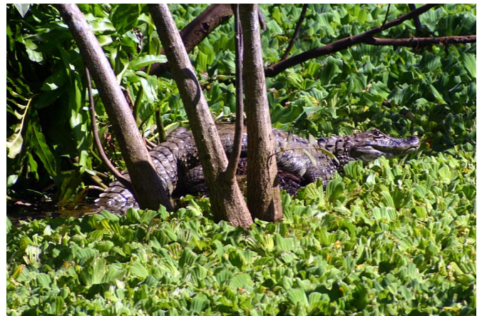
FIGURE 5. Specimen of Caiman latirostris at Parque Botânico da Vale.

The occurrence of A. radiolata at Vitória is based on a carapace found at the surroundings of Parque Estadual da Fonte Grande . Although the species has been listed as Near Threatened in IUCN, it is also said that it needs updating. The North American Red-eared Slider, T. scripta elegans , was observed in a lake at the Campus Goiabeiras of the Universidade Federal do Espírito Santo (Ferreira and Mendes 2010) and can also be currently found at the Parque Pedra da Cebola . Tortoises Chelonoidis denticulata and Chelonoidis carbonaria can be found there as well (Figure 6). This park is known for receiving donated pets. The species C. carbonaria has a large distribution range, occurring naturally in Amazonian formations, Caatinga, and Cerrado, and a portion of Atlantic Rainforest in southern Bahia (Iverson 1992), but there is not a report of the species within a natural environment in the state. Despite its large distribution (mainly in the Amazonian domain, with some records in isolated areas in Cerrado, Caatinga, and Atlantic Rainforest), there is no previous record of C. denticulata in Vitória, but it has been reported within the political boundaries of the state of Espírito Santo, in the Rio Doce region (Iverson 1992), without further locality specifications.