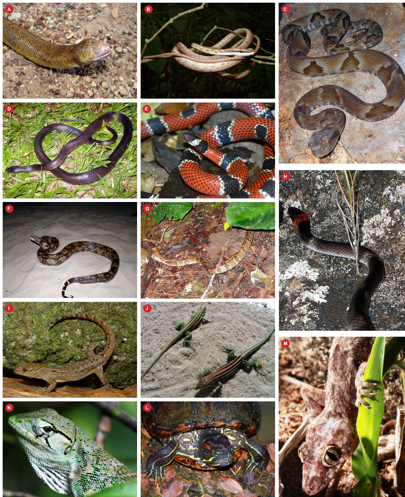
FIGURE 3. Some reptiles from the municipality of Vitória: A - Amphisbaenia alba ; B - Oxybelis aeneus ; C - Bothropoides jararaca ; D - Pseudoboa nigra ; E - Micrurus corallinus ; F - Boa constrictor ; G - Dipsas albifrons ; H - Oxyrhopus petola ; I - Gymnodactylus darwini ; J - Cnemidophorus natio ; K - Polychrus marmoratus ; L - Trachemys scripta elegans ; M - Hemidactylus mabouia.

(Peloso et al. 2008), and habitat use (Dias and Rocha 2005; Peloso et al. 2008). This lizard is presently included in the Brazilian List of Endangered Species (MMA 2003) and in the list of reptiles threatened with extinction in the state of Espírito Santo (Almeida et al. 2007), due to the intensive process of destruction of its habitat. This is the first report