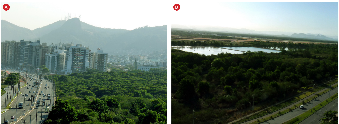
FIGURE 2. Panoramic images of the Reserva Ecológica Municipal Restinga de Camburi.