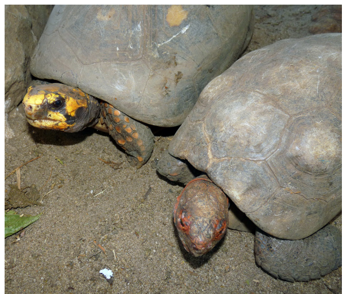
FIGURE 6. Specimens of Chelonoidis denticulata and C. carbonaria at Parque Pedra da Cebola.