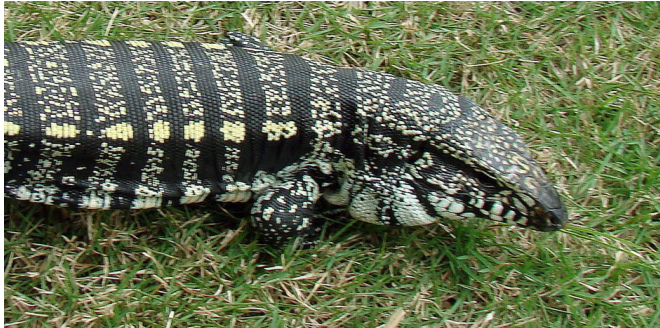
FIGURE 7. Specimen of Tupinambis merianae at the Campus Goiabeiras of the Universidade Federal do Espírito Santo.

In spite of the enormous anthropogenic disturbance in Espírito Santo, the municipality still houses a diverse range of reptiles including some endangered species, such as the lizard Cnemidophorus natio , five chelonians, and other species that are no longer listed as threatened, such as Caiman latirostris . Hemidactylus mabouia is a non-native species that is commonly found throughout