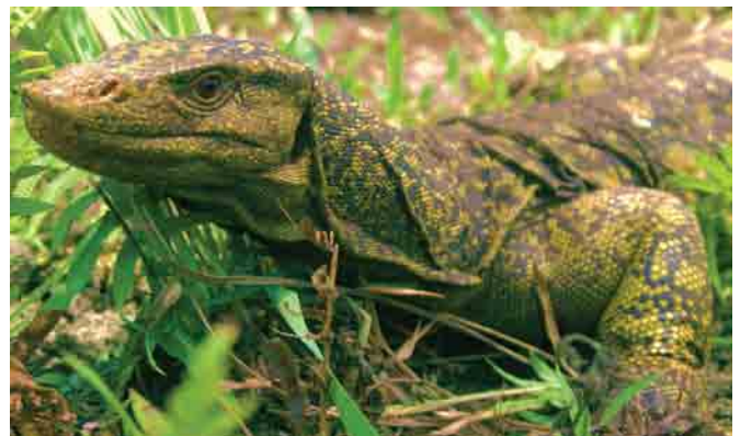
FIGURE 29. Varanus bitatawa in life (PNM 9728 ; Location 6).

A single individual of this newly described frugivorous species of monitor lizard was salvaged from a hunter (Welton et al. 2010b). This species is morphologically distinct from Varanus olivaceus , which is known to occur in the small remnant forest patches in southeastern Luzon, The Bicol Peninsula, Catanduanes, and Polillo Islands (Auffenberg 1988; Welton et al. 2010b). Frugivorous monitors in the Philippines have been documented to eat the fruits of several palm species ( Corphyra elata , Livistonia rotundifolia , Caryota sp.), fig species ( Ficus altissima , F. merritti , F. benjamina , F. balet ), and pandanus ( Pandanus tectorius ) fruits (Auffenberg 1988). According to the local community, the species is commonly collected by hunters and individuals in the area have been observed in coastal disturbed and secondary-growth forest. Figure 29. Location 6: PNM 9728 (formerly KU 320000).