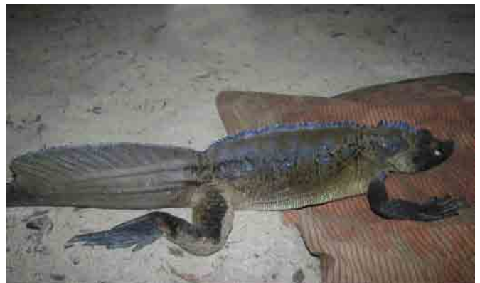
FIGURE 26. Hydrosaurus pustulatus in life (KU 325294; Location 6).