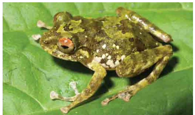
FIGURE 19. Platymantis sp. 1 “green” in life (KU 322144; Location 1).