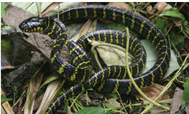
FIGURE 31. Boiga dendrophila divergens in life (KU 323366; Location 4).

This species was observed near rivers in disturbed and secondary-growth forest and in mangrove forest habitats. Individuals were encountered on the ground while actively hunting at night. This polytypic species occurs throughout the Philippines, and consists of four subspecies (Leviton 1970): B. dendrophila divergens (Luzon and Polillo Islands), B. dendrophila latifasciata (Mindanao Island), B. dendrophila levitoni (Panay Island), and B. dendrophila multicincta (Balabac and Palawan Islands). Figure 31. Location 4: KU 323366; Location 6: KU 323365.