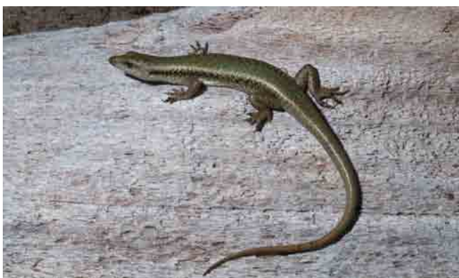
FIGURE 27. Emoia atrocostata in life (KU 323195; Location 6).

We collected two specimens of this species on sandy habitat near the coast at Casiguran. This species is widely distributed but seldom collected in recent years, most likely due to ubiquitous coastal development throughout the country. Figure 27. Location 6: KU 323195-6.