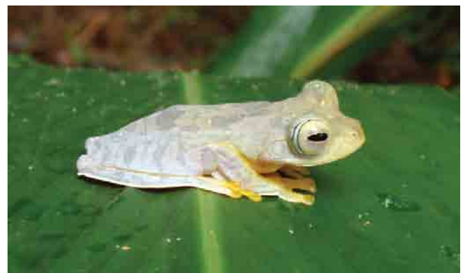
FIGURE 23. Rhacophorus bimaculatus in life (KU 323006; Location 2).

Specimens of this species were collected on the branches and leaves of shrubs near swampy habitat and pools of water in disturbed and secondary-growth forest. This species is known to have a widespread distribution throughout much of the Philippines, and is known to build foam nests on vegetation above stagnant pools of water. Figure 23. Location 2: KU 322207-8, 323006.