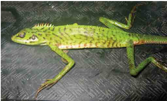
FIGURE 24. Bronchocela marmorata (KU 323045; Location 2).

We found this species asleep at night on branches of trees and shrubs in disturbed forest. Several specimens ostensibly match the definition of B. marmorata while others can be keyed out (Hallermann 2005) to B. cristatella (Kuhl, 1820). However, we hesitate to definitively identify two sympatric taxa given the slight character differences that putatively distinguish the two forms and the absence of genetic data suggesting the existence of two species on Luzon (Brown, Siler, Welton, and Diesmos, unpublished data). Individuals were often found 2-4 m above the ground. This species is widely distributed in the Philippines. Figure 24. Location 2: KU 323044-5; Location 3: KU 323046-9; Location 4: KU 323051; Location 6: KU 323050.