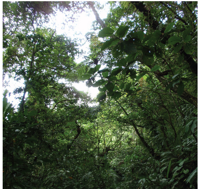
FIGURE 11. Forest habitat at Location 5.