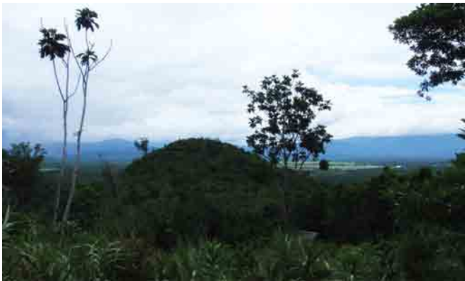
FIGURE 8. Lowland habitat at Location 3.