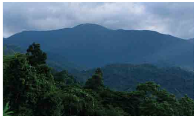
FIGURE 5. Mountain view at Location 2.