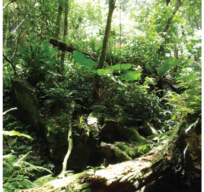
FIGURE 10. Forest habitat at Location 4.