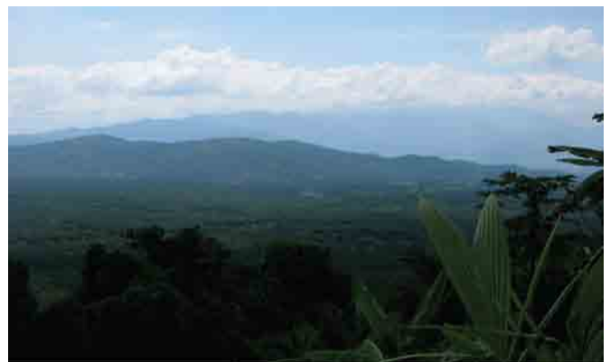
FIGURE 6. View of lowlands from Location 3.