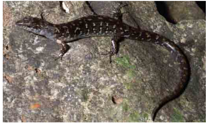
FIGURE 28. Sphenomorphus leucospilos in life (KU 323925; Location 5).

Prior to the collection of a single individual in 2000, this rare species was known from only two specimens collected on Luzon Island (Brown et al. 2000b). We observed this species active during the day on boulders on the banks of rapidly flowing river systems. When disturbed, individuals dove into the water or quickly crawled into crevices between rocks. Figure 28. Location 5: KU 323920-30.