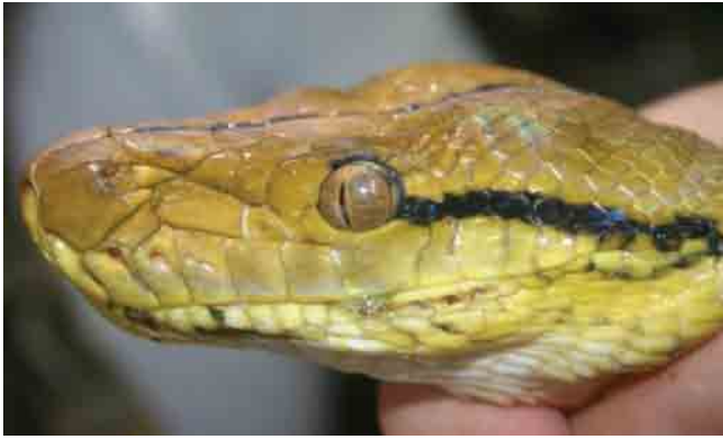
FIGURE 37. Python reticulatus in life (KU 325296; Location 2).

The results of our surveys provide additional baseline data on the diversity of amphibians and reptiles in the southern Sierra Madres mountain range, Aurora Province (Table 1, Figure 1). The species encountered during the surveys include many interesting discoveries, potentially new and endemic species, and additional information on rare species known previously from few observations and specimens. Although much of the habitat we explored in recent surveys was secondary-growth regenerating forest at best, high species diversity was encountered at all sites. Several species, previously believed to be rare, have turned out to be quite common, including the stream frog Sanguirana tipanan , the “Polillo” forest frog P. polillensis , and the skink Sphenomorphus leucospilos . Unfortunately, we suspect that habitat disturbance brought about by rapid development of Aurora Province is most likely having a negative impact on the local herpetofauna. At all sites visited by us, signs of low-level timber harvesting was apparent. The invasive and introduced species Rhinella marina and Kaloula pulchra were observed during this survey, in contrast to their absence during the Brown et al. (2000b) inventory. Additionally, the recent