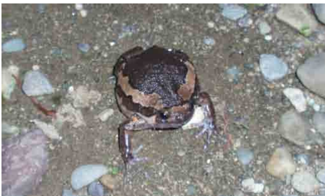
FIGURE 21. Kaloula pulchra in life (KU 322393; Location 3).

We collected this species under loose soil and leaf litter in a residential yard in the town of Baler. Until recently, this species was known to have a widespread distribution throughout much of southeast Asia except for the Philippines; however, it has now been introduced to the country, has recently been documented on Luzon (Diesmos et al. 2005), and likely occurs on other Philippine islands. Figure 21. Location 3: KU 322393.