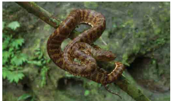
FIGURE 36. Parias flavomaculatus in life (KU 323400; Location 5).