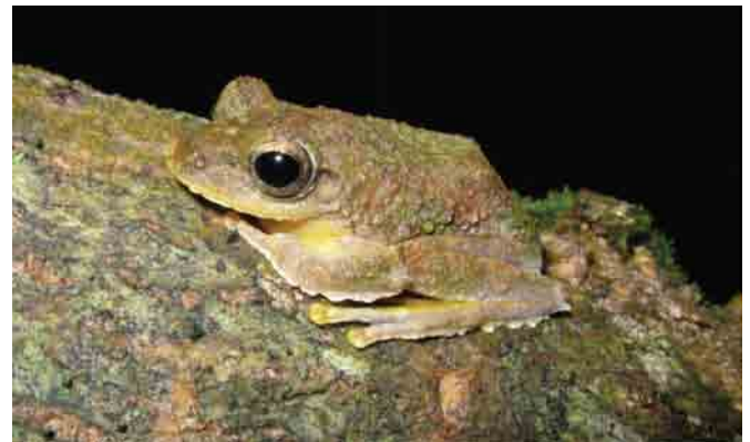
FIGURE 22. Rhacophorus appendiculatus in life (KU 322251; Location 2).

This infrequently encountered species is thought to have a widespread distribution throughout the Philippines, occurring in disturbed, secondary- and primary-growth forest. We encountered a large chorus of many dozens of individuals, situated on vegetation surrounding a stagnant, swampy pool in selectively logged forest. This is one of several Philippine anuran species known to build foam nests on vegetation overhanging pools of water (Brown and Alcala 1982b). Individuals were collected on the branches and leaves of shrubs surrounding small pools of water and swampy habitat. Figure 22. Location 2: KU 322209-53, 323413, 323418.