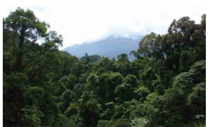
FIGURE 4. Mountain view at Location 2.