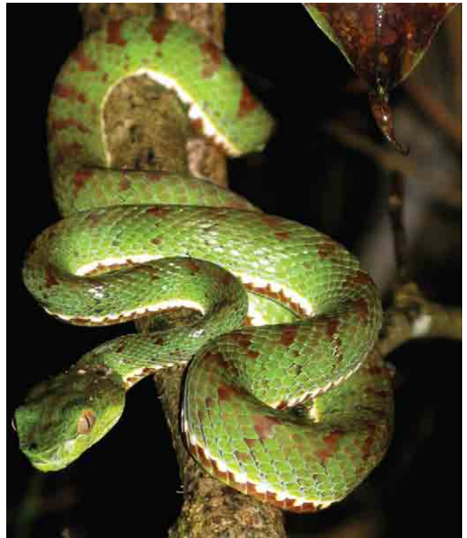
FIGURE 35. Parias flavomaculatus in life (KU 323395; Location 2).