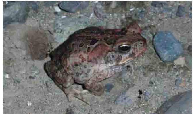
FIGURE 12. Rhinella marina in life (KU 321853; Location 3).

We observed individuals of this introduced and invasive species around the Aurora State College of Technology campus and in the town of Baler. This species is common in highly disturbed habitats and can often be heard calling in loud breeding choruses in flooded agricultural fields. Figure 15. Location 3: KU 321853-62.