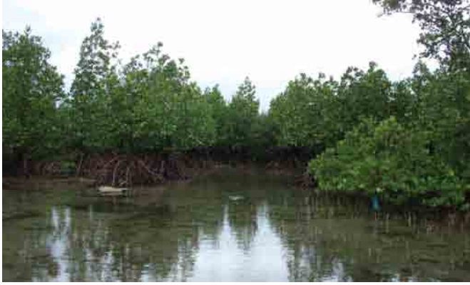
FIGURE 7. Mangrove forest at Location 3.