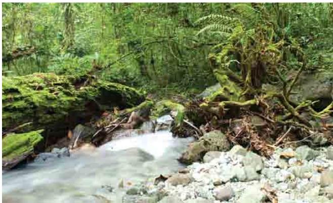
FIGURE 13. Rocky, river habitat at Location 5.