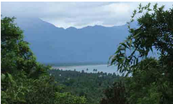
FIGURE 9. View of lowlands from Location 3.