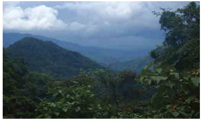
FIGURE 3. Mountain view on hike to Location 1.