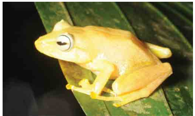
FIGURE 18. Platymantis polillensis in life (KU 322125; Location 1).