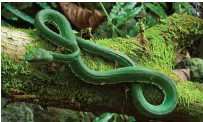
FIGURE 34. Parias flavomaculatus in life (KU 323399; Location 5).

We collected individuals of this species of pit viper coiled and asleep at night on branches of trees in secondary-growth forest. This polytypic species occurs throughout the Philippines and consists of three subspecies (Leviton 1964a): P. flavomaculatus flavomaculatus (Bohol, Camiguin, Catanduanes, Dinagat, Jolo, Leyte, Luzon, Mindanao, Mindoro, Negros, and Panay Islands), P. flavomaculatus halieus (Polillo Island), and P. flavomaculatus macgregori (Batanes Island Group). Some of our specimens clearly key out to P. f. halieus , and others (from the same population) key out to P. f. flavomaculatus . This suggests to us that the single color character used to distinguish the two “subspecies” is a color polymorphism that occurs throughout the range of this single, widespread species and does not correspond to a valid taxonomic entity that is endemic to Polillo Island. Figure 34-36. Location 2: KU 323394-6; Location 5: KU 323399-401.