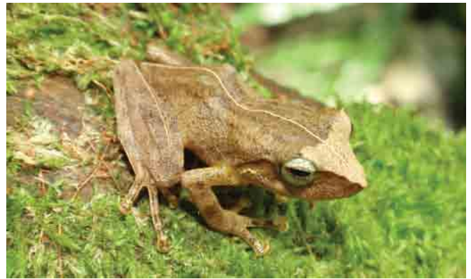
FIGURE 17. Platymantis polillensis in life (KU 322423; Location 5).

A third small-bodied P. hazelae group species (Brown et al. 1997a) has been identified in Aurora Province. This small, tuberculate form calls from saplings and understory leaves above 900 m and 2-3 m above the ground; its call sounds to the human ear like a loud, intense “Pssst!” This undescribed species has also been encountered on Mt. Mangan, Aurora Province (specimens in FMNH). Figure 19. Location 1: KU 322134-56.