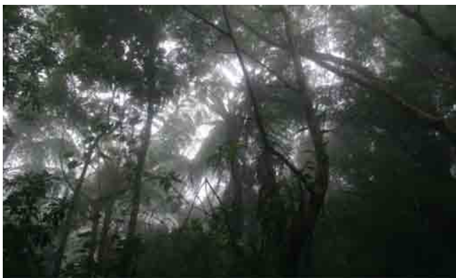
FIGURE 2. Cloud forest at Location 1.