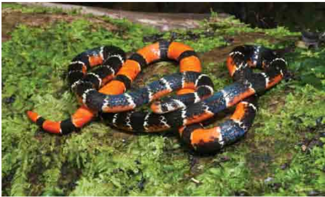
FIGURE 33. Hemibungarus calligaster calligaster in life (KU 323337; Location 5).

extirpation efforts around the country, the species appears to have become rare on many islands. We collected a single individual of this species on the surface of the forest floor in secondary-growth forest. Location 2: KU 322351.