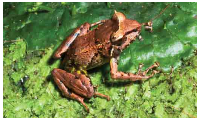
FIGURE 16. Platymantis cf. cornutus in life (KU 322471; Location 5).

We collected individuals of this species on low hanging tree branches, leaves, and shrubs, in similar habitat to Platymantis cf. luzonensis (see below). Males were frequently heard at Locations 2 and 4, calling from forest canopy, with advertisement calls identified by their rapid note repetition rate and relatively high numbers of notes per call. Figure 16. Location 1: KU 321985-93, 322051-64, 323412; Location 2: KU 321953; Location 4: KU 322463-5, 323415; Location 5: KU 322469.