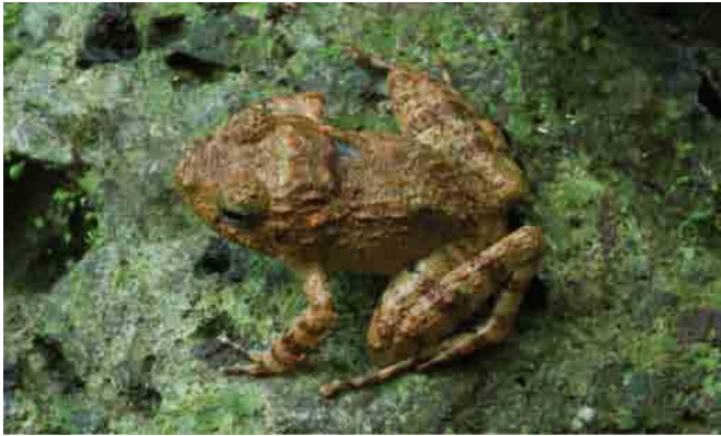
FIGURE 20. Platymantis sp. 2 "meeyak" in life (KU 322435; Location 5).

P. biak (Siler et al. 2010c), and P. insulatus (Brown and Alcala 1970). The calls of male individuals were quiet when compared with the calls of other sympatric species in the genus; males were observed calling solely from cascading stream banks, within the spray zone of high gradient and rapidly flowing water. Several were collected midstream on rocky and gravel banks. Figure 20. Location 1: KU 322042-50; Location 2: KU 322041; Location 4: KU 322437-42; Location 5: KU 322433-6.