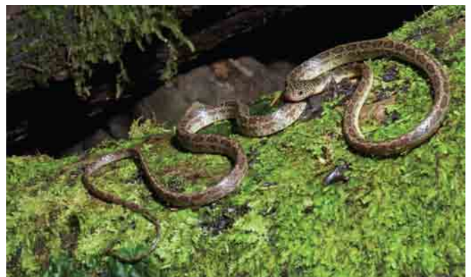
FIGURE 32. Lycodon muelleri in life (KU 323384; Location 5).

We collected this species on leaf litter on the forest floor in secondary-growth forest. This species of wolf snake has been recorded on Batan, Luzon, Mindoro, and Polillo Islands (Leviton 1965a). Figure 32. Location 2: KU 323383; Location 5: KU 323384-5.