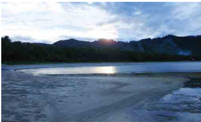
FIGURE 14. Coastal forest habitat at Location 6.