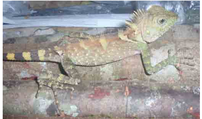
FIGURE 25. Gonocephalus sophiae in life (KU 323153; Location 2).

We collected individuals of this species at night asleep on the trunks of small trees and saplings in secondary-growth forest. It was often found perched on sapling trunks in an upright position 1-2 m above the ground. We believe this is the same species as the unidentified species of Gonocephalus collected during the Brown et al. (2000b) expedition. Figure 25. Location 2: KU 323153-6; Location 5: KU 323157-8; Location 6: KU 323159.