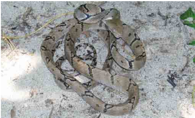
FIGURE 30. Boiga cynodon in life (KU 322354; Location 6).

We collected this species in arboreal habitats in disturbed and secondary-growth forest. Individuals were encountered actively hunting at night on branches of trees and shrubs in the forest. This species is currently recognized to occur on Palawan, Mindanao, Luzon, and Panay Islands (Leviton 1963b; 1970; Alcalá 1986; Ferner et al. 2000; Gaulke 2001). Figure 30. Location 2: KU 322355; Location 3: KU 322356-7, 323367; Location 6: KU 322354.