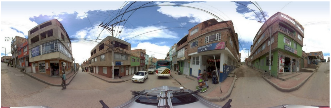
Figure 3. Street view panoramic from Colombia.