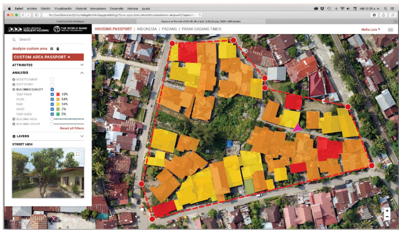
Figure 2. Results of building quality assessment, Padang, Indonesia.

The key product derived from street level imagery to support the FFP land tenure methodology is the georeferenced street panorama. Although FFP land tenure can be completed using just drone imagery, the georeferenced street panorama derived from street view imagery can add further support to the FFP land tenure process. It can be used to perform measurements, help interpretation of the urban landscape and support allocation of street addresses. However, the street view imagery supports ML to extract building