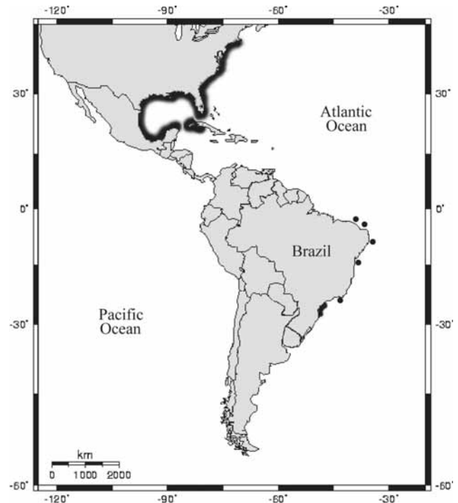
Figure 6. Geographic range of Zaops ostreum .

BALECH, E. 1951. División zoogeográfica del litoral sudamericano.