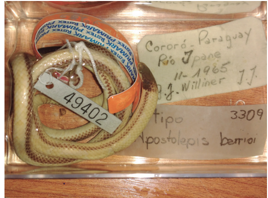
Figure 4. Holotype of Apostolepis barrioi (MACN 49402).

Diagnosis. — Apostolepis barrioi differs from its congeners by the following characteristics: absence of white nuchal collar; presence of a complete black nuchal collar; venter immaculate white; prefrontal uniformly black; gular region white; narrow dorsolateral stripes