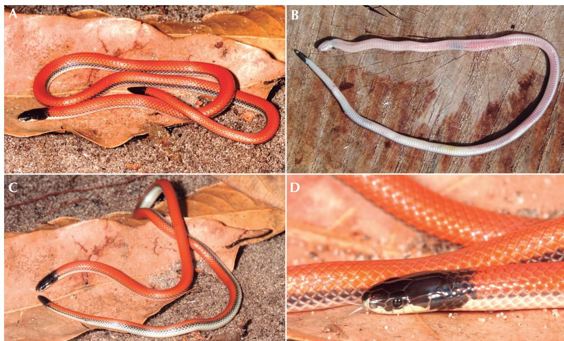
Figure 1. Apostolepis barrioi from Laguna Blanca, Paraguay. (A) Dorsal view; (B) ventral view, showing the absence of black coloration on ventral scales; (C) dorsal view showing the black dorsolateral stripes not reaching the ventral scales; (D) details of the head.

Paraguay, and when we compared data from a large sample ( N = 142 ) of A. dimidiata , we noted some differences between the albinistic and the other morphs. The analysis included three morphs: melanistic, belly with a narrow white midventral area, and albinistic. The albinistic form occurs in Paraguay and Brazil (Figure 2) and is characterized by the immaculate white venter, and dorsolateral black stripes that do not reach the ventral scales (Figure 3). The other two morphs occur in Argentina, Brazil, and Paraguay and have completely dark venters or dark coloration on the edges of the ventral scales, lateral dark stripes that always reach the ventral scales, and an incomplete vertebral stripe (Giraudó 2002). In A. barrioi , ventrals range from 222–256 and subcaudals from 23–35; in A. dimidiata , ventrals range from 214–264 and subcaudals from 22–39. The Table 1 summarizes