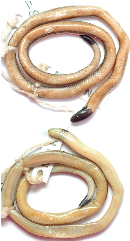
Figure 3. Dorsal and ventral view of Apostolepis barrioi (MNHNP 11548) showing the immaculate white ventral coloration.

Distribution. —From Minas Gerais and São Paulo to Mato Grosso do Sul states, Brazil, to northern and central Paraguay (Figure 2).