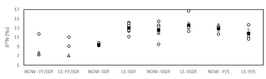
Fig 4. Macroinfaunal feeding guild \delta^{15} N signatures in North Water Polynya (NOW) and Lancaster Sound (LS). Individual taxa are marked with open symbols and feeding guild averages (± SE) with filled symbols. Circles represent polychaete groups and triangles other taxa. Every data point represents different taxa assigned to this feeding guild. P/S = predator/scavenger, SDF = surface deposit feeder, SSDF = subsurface deposit feeder, FF/SDF = facultative filter/surface deposit feeder, FF = obligate filter feeder. For FF/SDF the average is not shown to illustrate the switching between feeding modes depending on the taxa.

https://doi.org/10.1371/journal.pone.0183034.g004