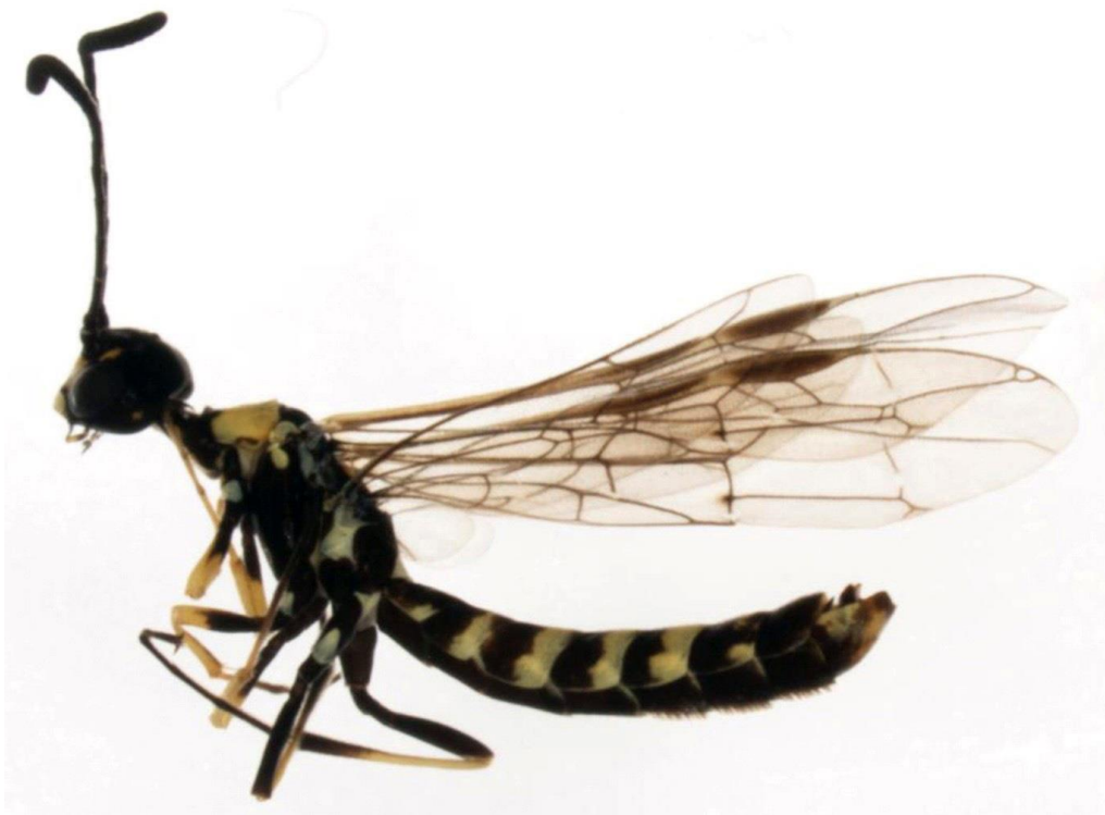
Figure 2. Trachelus libanensis (André, 1881) (♂).