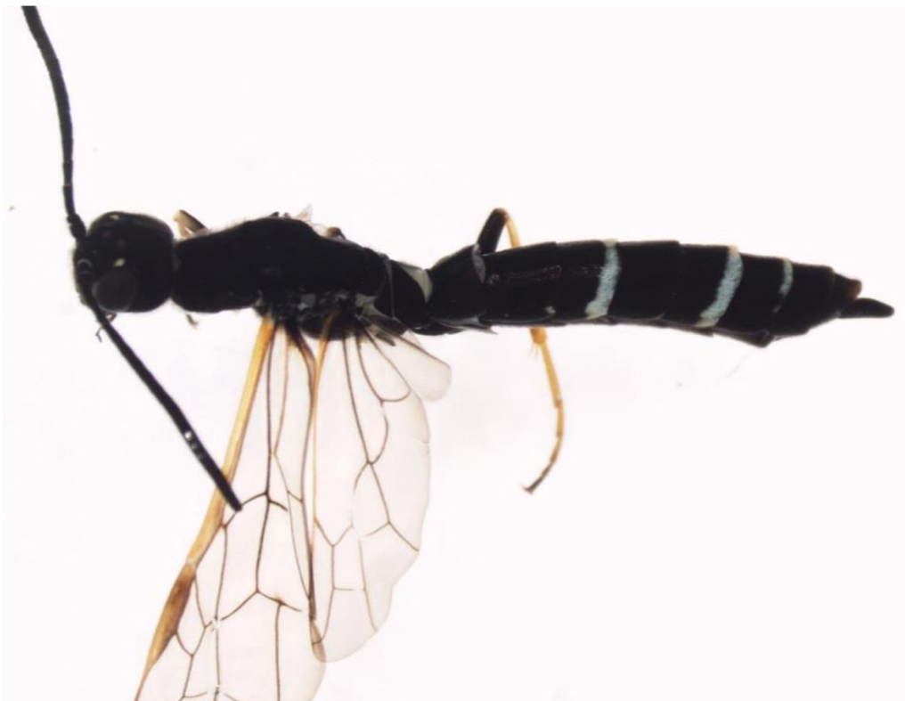
Figure 3. Phylloecus niger (M. Harris, 1779) (♀).