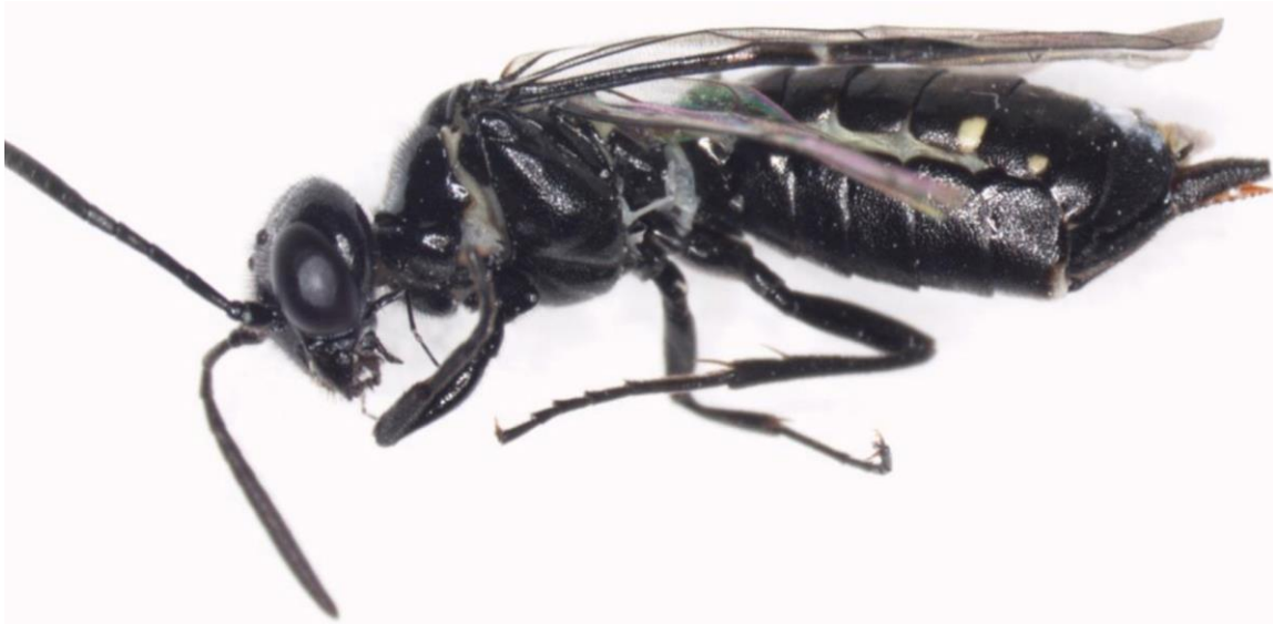
Figure 4. Pachycephus smyrnensis smyrnensis J.P.E.F. Stein, 1876 (♀).

The authors declare that there is no conflict of interest regarding the publication of this paper.