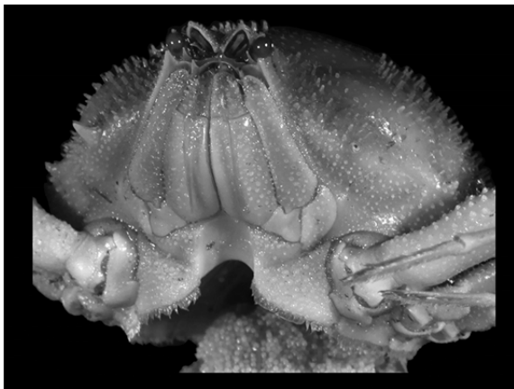
Figure 2. Arcania brevifrons Chen, 1989. SMNH AR29689, ovigerous female, cl 30.0 mm, Ashdod, Israel. Cephalothorax frontal view.

1437, 17°11'S; 178°46'W, 160–177 m, 02 March 1999, coll. P. Bouchet et al., 1 female cl 26.4 mm MNHN-IU-2016-10933 (= MNHN B27435).