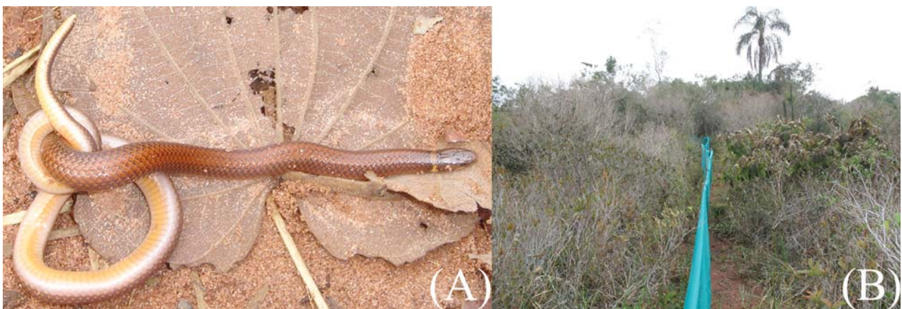
Figure 1. (A) Phalotris lativittatus from Parque Estadual do Morro do Diabo (PEMD), municipality of Teodoro Sampaio, São Paulo, Brazil. (B) Line of pitfall trap with drift fences at cerrado sensu stricto , Parque Estadual do Morro do Diabo (PEMD).

Paulo, southeastern Brazil, collected during field samplings in February and May 2006. Both specimens, a male (MZUSP 15295) and a female (MZUSP 15296), were deposited at Museu de Zoologia of Universidade de São Paulo . Ventral and subcaudal scale counts of the male (198 and 30 scales, respectively) agree with the description given by Ferrarezzi (1994) (ventral scales: 182-199, mean = 187.7; subcaudal scales: 32-39, mean = 35.5), as well as the temporal formulae of both male and female specimens (0+1). Ventral scale counts of the female (205 scales) also agree with description of Ferrarezzi (1994) (196-208 scales, mean = 201.1), but subcaudal counts (51 scales) are higher than the values in his study (23-33 scales, mean = 27.2). The specimens were captured by pitfall traps with drift fences (30 units of 100 L buckets and 330 m of drift fences) installed in a natural patch of cerrado sensu stricto physiognomy in PEMD (22°28'07.3" S, 52°20'33.1" W; Figure 1B).