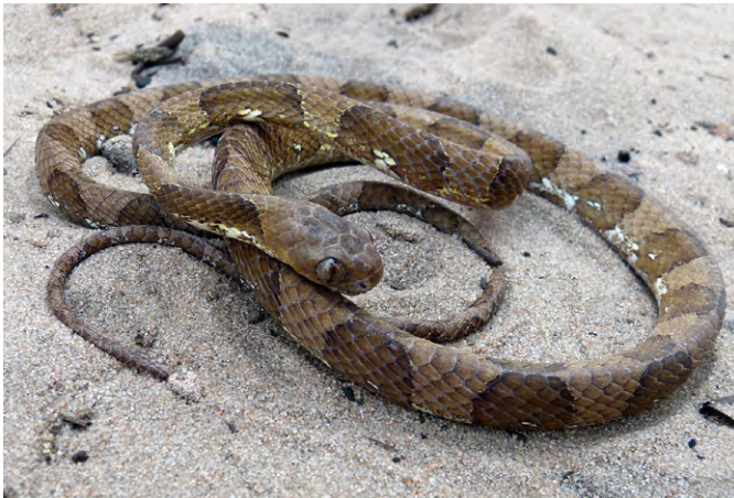
Figure 3. Dipsas cisticeps (CZPLT-H 866).

from San Pedro department. This species is considered Critically Endangered nationally (Motte et al. 2009, Smith et al. 2013).