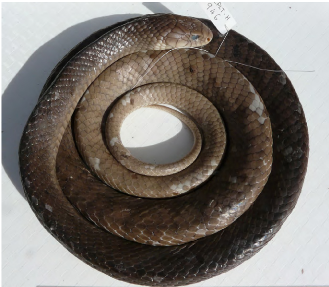
Figure 2. Drymarchon corais (CZPLT-H 946).