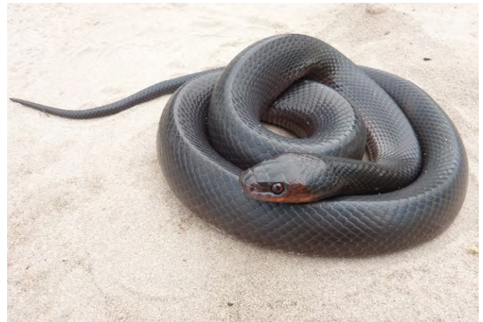
Figure 4. Rhachidelus brazili (CZPLT-H 890).

CZPLT-H 844 (SVL: 487 mm; TL: 55 mm; dorsals: 19-19-17; ventrals: 181; subcaudals: 56). A dead specimen was collected on 9 June 2015 by Jorge Ayala, in sandy soil on the edge of a eucalyptus plantation. The specimen had recently consumed a small rodent (CZPLT-M 461). Oxyrhopus rhombifer rhombifer is known in Paraguay from a single specimen collected in the Mesopotamian grasslands of Itapúa department (Cacciali et al. 2016). This is the first record for San Pedro department and the Paraguayan Cerrado, although it is known to occur in Cerrado in neighboring Brazil (Cacciali et al. 2016). Oxyrhopus rhombifer is considered Least Concern nationally