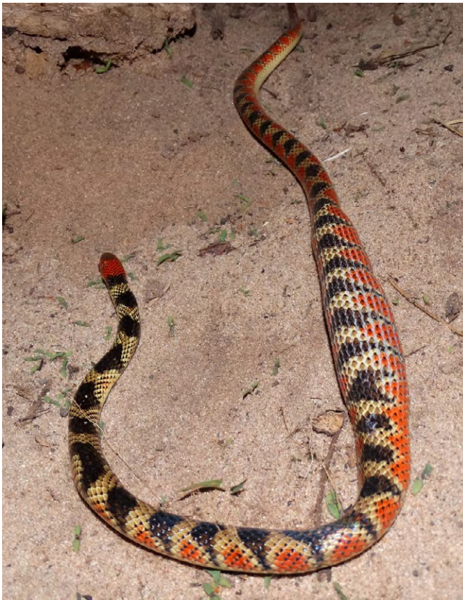
Figure 5. Oxyrophis rhombifer rhombifer (CZPLT-H 844).

RNLB can now be considered Data Deficient nationally.