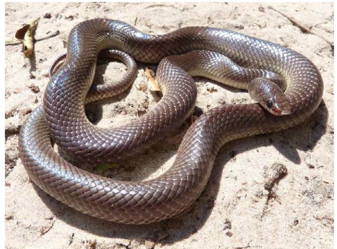
Figure 6. Phimophis guerini (CZPLT-H 882).