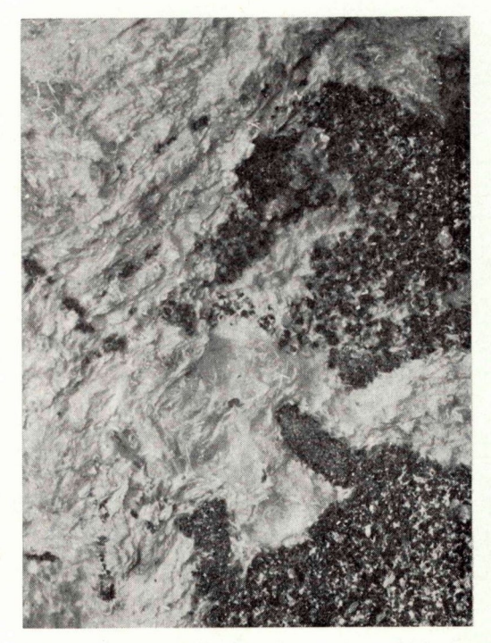
Fig. 1. Rankamaite with simpsonite and black cassiterite. 10 \times .

Specimens of rankamaite have been found as nodules up to 100 g in weight. The mineral constitutes the silky, fibrous (asbestiform) matrix in which corroded grains of simpsonite and crystals of cassiterite are seen (Fig. 1). The colour of rankamaite is white to creamy-white or yellowish due to iron staining. The fibres are generally wavy but tufts of straight fibres can be seen in small cavities. The hardness is approximately 3—4; specific gravity about 5.5 (meas.) and 5.84