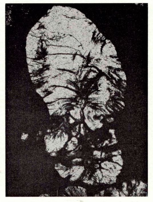
Fig. 3. Corroded simpsonite partly replaced by fibrous rankamaite. 30 ×.