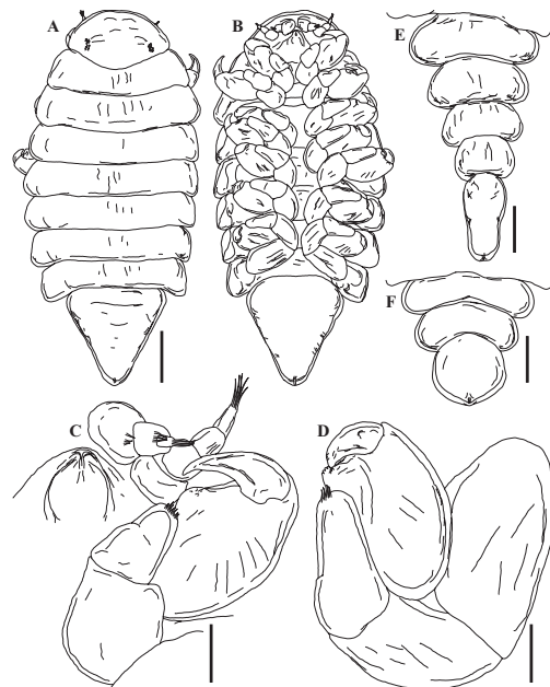
Fig. 4: Anuropodione amphiandra (Codreanu, Codreanu & Pike, 1966) n. comb., male specimens USNM 1492250 (A-D), USNM 1492279 (E), USNM 1492241 (F). A, D, dorsal view. B, E, F, ventral view. C, mouthparts, left antennule (top), left antenna (bottom) and left pereopod 1. D, left pereopod 7. E, pleon with 5 segments. F, pleon with 3 segments. Scale bars = 250 \mu m (A, B, E, F), 50 \mu m (C, D).

in March 2017 or August 2018 (USNM 1492241; Fig. 1) (all other specimens cited below with same collection data); 1 dextral ovigerous female (8.6 mm), 1 mature male (4.8 mm, pleon elongate with 5 pleomeres), from right branchial chamber of unknown sex and size M. rullanti (USNM 1492244); 1 dextral ovigerous female (7.5 mm), 1 mature male (1.7 mm, pleon short with all pleomeres coalesced), from right branchial chamber of unknown sex and size M. rullanti (USNM 1492250); 1 sinistral ovigerous female (7.0 mm), 1 mature male (pleon elongate with 5 pleomeres), from left branchial chamber of unknown sex and size M. rullanti (USNM 1492279); 1 dextral ovigerous female (5.5 mm), 1 mature male (pleon short with all pleomeres coalesced), from right branchial chamber of male M. rullanti (15 mm CL) (USNM 1492233); 1 dextral ovigerous female (7.3 mm), infesting unknown size and sex M. rullanti (MNHN-IU-2017-72).