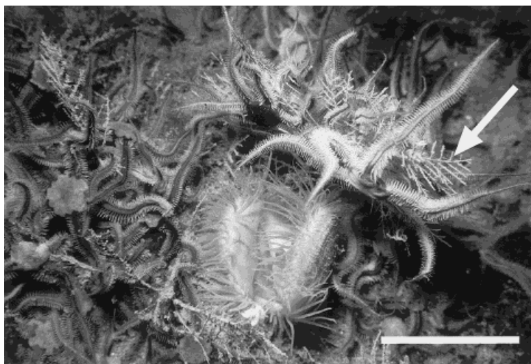
Figure 2. Adult L. hians (bottom centre) emergent from a nest at –15 m Creag Gobhainn, Loch Fyne, October 1999. The nest surface is covered in attached hydroids (arrow) and vagile brittlestars. Scale bar = 3 cm.

Step (1927) interpreted Limaria nests as providing protection against predation by cod, which, he wrote, 'have a weakness for Lima flesh'. That being the case (cf. Côté, 1995 and Reimer and Tedengren, 1997 on Mytilus ), the feeding activities of shoals of juvenile cod noted on the surface of Limaria reefs (Figure 4) might naturally enhance byssal production and thereby strengthen nest defences. However, a few apparently healthy L. hians were occasionally seen outside their protective byssus nests (Figures 1 and 2),