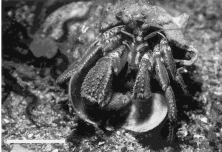
Figure 3. Pagurus bernhardus feeding on a L. hians exposed and damaged by the passage of Newhaven scallop dredges at -18 m Creag Gobhainn, Loch Fyne, October 1999. Scale bar = 4 cm.

but were not attacked by predators. It seems likely that undamaged L. hians are less attractive to predators than damaged individuals since healthy L. hians may escape predation by swimming and, if captured, can autotomize pallial tentacles that secrete a viscous, acrid-smelling mucus, which sticks to predators such as fish and crabs (Gilmour, 1967).