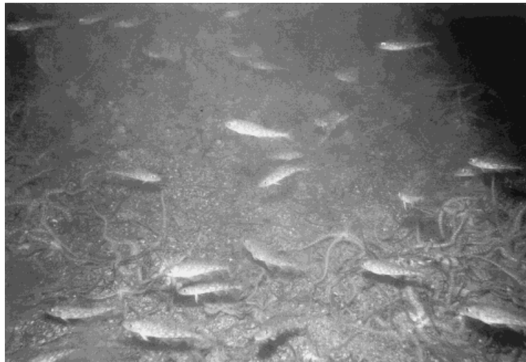
Figure 4. School of 8–10 cm long juvenile cod ( Gadus morhua ) feeding on the surface of a L. hians reef at -15 m Creag Gobhainn, Loch Fyne, October 1999.