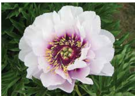
Cora Louise ITOH $60 (Anderson, 1986)

Bright violet-pink, single, midseason, 32" tall, fertile hybrid. A bright color that attracts attention in the garden. Stands up nicely without support.