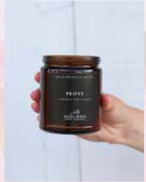
Peony Candle $30