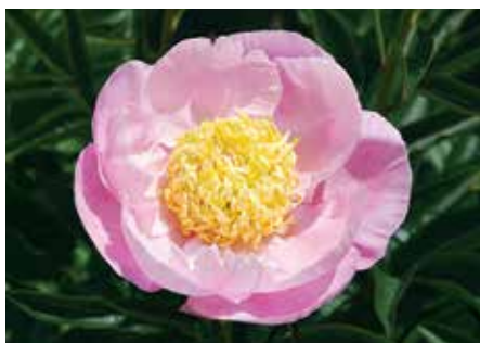
Garden Lace $20 (Hollingsworth, 1992)

White, double, very fragrant, early, 36" tall, lactiflora. Its sterling qualities of growth, color and fragrance make it most desirable even after 150 years! Red flecking on petals.