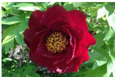
Sonoma Guy Saval $80 (Tolomeo/Gamoletti, 2021)

Yellow, double, fragrant, very early, lutea hybrid tree peony. A huge yellow flower edged deep pink. The heavy flowers tend to hang down on the plant.