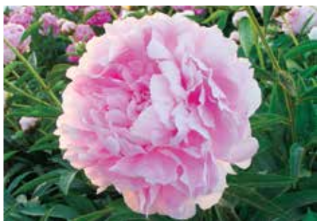
Marietta Sisson $24 (Sass, 1933)

Pink to cream, semi-double to double, mid-season, lightly fragrant, 28" tall, intersectional. Flowers open a pink color and will flush out in a creamy white with color edgings. The petal color transitions will keep you entertained.