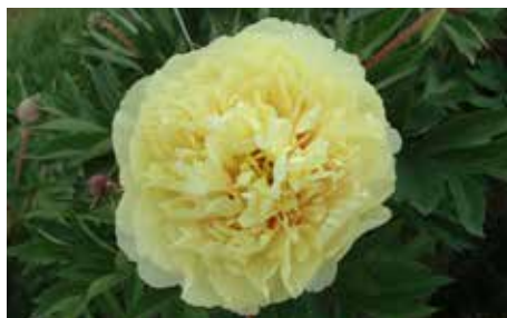
Sonoma YeDo (Tolomeo, 2010) ITOH $150

White, single, fragrant, midseason, 34" tall, lactiflora. Large wavy white petals encircle golden stamens and green carpels. Very attractive.