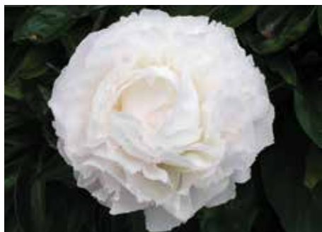
Shirley Temple $26 (Smirnow before 1948)

Yellow, semi-double, fragrant, midseason, 48" tall, intersectional. Yellow in its entirety with many blooms.