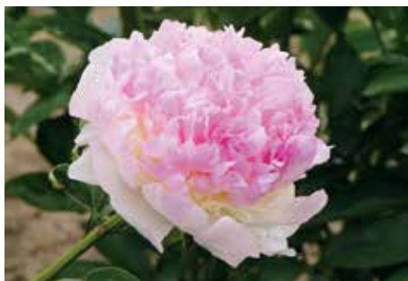
Raspberry Sundae $20 (C. Klehm, 1968)

Dark pink, double, fragrant, late-midseason, 34" tall, lactiflora. This enormous full double flower is a rich rose-pink with strong stems. APS Grand Champion 1974.