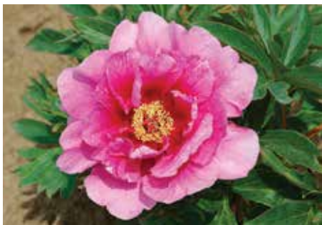
Sonoma Amethyst ITOH $55 (Tolomeo, 2001)

White, double, lightly fragrant, midseason, 34" tall, lactiflora. Medium-sized, pale pink fading to white blossoms with petals arranged in whorls. Very delicate appearance.