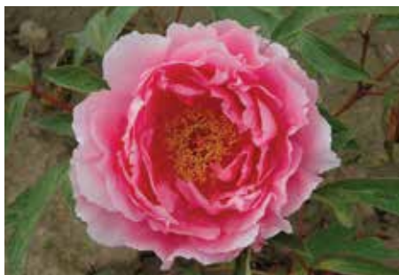
Princess Chiffon $75 (Domoto/ R. Klehm, 1995)

Pink, single to semi-double, early, 30" tall, lutea hybrid tree peony. A beautifully formed flower on a short plant. Named after the painter of the same name.