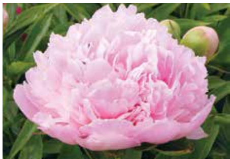
Pink Pearl $32 (Sass, 1937)

Dark pink, double, midseason, 33" tall, lactiflora. A dark pink full double with darker paint flecks on the petals. Red buds sit atop strong stems.