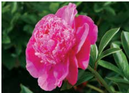
Pink Pom Pom $20 (D. Reath, 1991)

Coral, semi-double, fragrant, early, 34" tall, hybrid. Opens a redder coral than other corals, with notched petal edges and a center of yellow stamens. APS Gold Medal 2000.