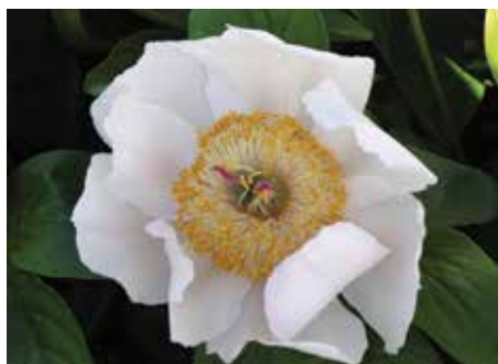
Chalice $24 (Saunders, 1929)

Scarlet red, semi-double, lightly fragrant, midseason, 34" tall, hybrid. Striking color on a vigorous upright plant. Petal numbers may increase with plant maturity.