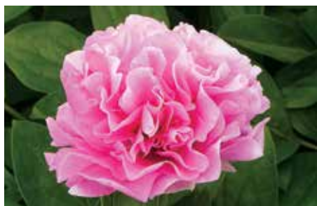
Carnation Bouquet $40 (Seidl, 1996)

Pink, double, very fragrant, midseason, 32" tall, hybrid. Petals of uniform size give a carnation appearance. Wonderful spicy fragrance. Unusual bud form.