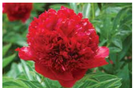
Many Happy Returns (ALM) $28 (Hollingsworth, 1986)

White, double, midseason, 24" tall, lactiflora. Creamy puffball white with yellow petals at the base. Shorter plant with strong plant habit.