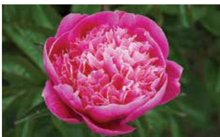
Belleville (H. Wolfe/Hollingsworth, 1998) $22

White, double, lightly fragrant, midseason, 35" tall, lactiflora. A full flower with red flecks on petal edges. Excellent cut flower.