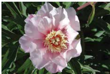
Ballarena de Saval (ITOH) $45 (Tolomeo, 2001)

Light Cyclamen purple, anemone-bomb, lightly fragrant, midseason, 34" tall, lactiflora. Striking color contrast of darker guard petals surrounding a mound of smaller, lighter center petals. May need support.