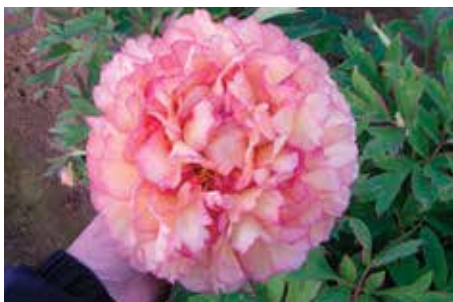
Souvenir de Maxime Cornu $85 (Henry, 1907)

Red-white, semi-double, very early, suffruticosa tree peony. Each flower can be different. Young plants may display solid red flowers, sometimes a white flower, but mostly the red/white stripe is evident.