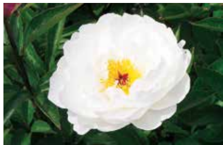
Minnie Shaylor (Shaylor, 1919)

Lilac, single, very fragrant, early, 32" tall, hybrid. A cup shaped bloom that stays lilac in our cool climate. Large light green rounded foliage makes it a nice landscape contrast.