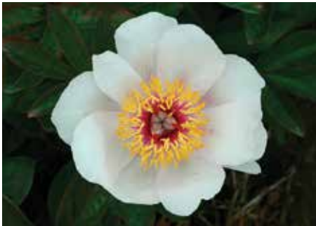
Halcyon RARE $34 (Saunders, 1948)

White, double, lightly fragrant, midseason, 34" tall, lactiflora. A magnificent large, pure white double. Strong stems and dark foliage.