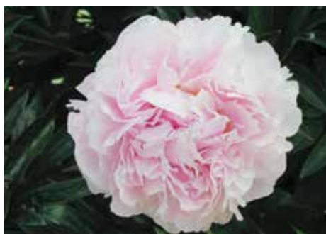
Lottie Dawson Rea (Rea, 1939)

Blush-white, double, late midseason, 32" tall, lactiflora. Very large flower with a flat face. On opening it is tinged with delicate flesh pink centers that fade to a pale blush white.