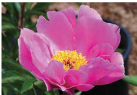
Sparkling Star (Bigger, 1953) $20

Red, single, midseason, 32" tall, intersectional. Ranging from red and white stripes to a solid strawberry color with curly yellow stamens centered with strawberry carpel tips. Every flower is a marvel in color!