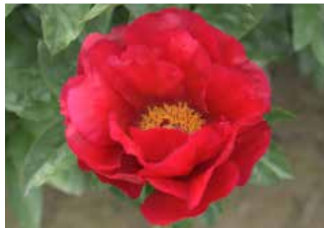
Alexander Woollcott (Saunders, 1941) $70

Red, Japanese, slightly fragrant, midseason, 30" tall, lactiflora. Glossy and lustrous foliage. Center petaloids edged with gold/white. No support needed.