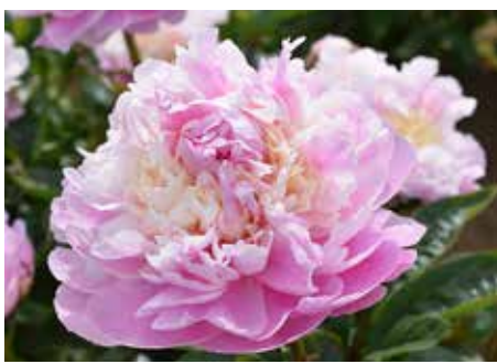
Chestine Gowdy $34 (Brand, 1913)

Cream, single, very early, 36" tall, hybrid. This bloom is the largest single flower I have seen. As a macrophylla x lactiflora cross it has very large glossy leaves. One of our very first to bloom.