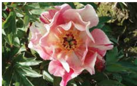
Strawberry Blush (Anderson, 2010) ITOH $75

Yellow, double, midseason, 30" tall, intersectional. A large yellow bloom that will astound your visitors. The red flares in the center vary in prominence. Side buds are present providing a long bloom season.