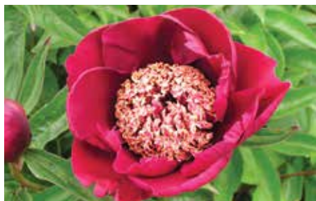
Nippon Beauty $20 (Auten, 1927)

Light pink, semi-double to double, early midseason, 30" tall, hybrid. Flowers in a shell pink color, held a little above broad green leaves. Unique color for its bloom time.