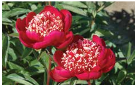
Ada Niva (Niva/Snelson, 1999) $24

ALM This award is granted to peonies that have outstanding landscape and growth characteristics. It was designed to provide information on particular peony varieties that would be desirable for landscapers to use in their garden designs. Included in characteristics are the ability to stand up in inclement weather and to be disease resistant. The first round of nominations were made by APS members in 2008 and the awards were presented by the respected and knowledgeable committee members. A handful of varieties have been added each year since.