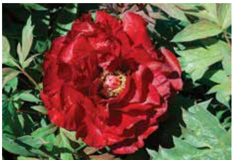
Hephestos $85 (Daphnis, 1977)

Strawberry red, single, lutea hybrid tree peony. An artist's mix of strawberry red with a yellow backside showing excitingly different tones each day.