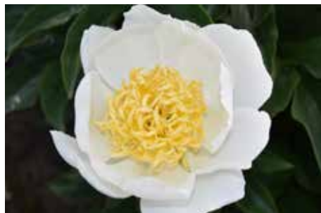
Jan van Leeuwen $26

Yellow, semi-double, midseason, 30" tall, intersectional. A delightful flower that changes color as it matures. A lovely landscape plant.