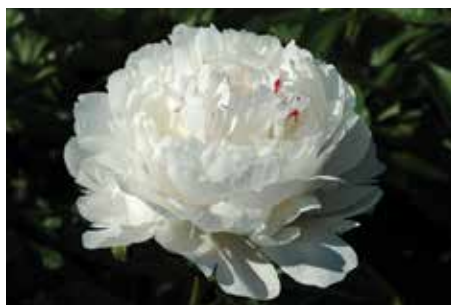
Festiva Maxima $20 (Miellez, 1851)

White, double, very fragrant, early, 36" tall, lactiflora. Its sterling qualities of growth, color and fragrance make it most desirable even after 150 years! Red flecking on petals.