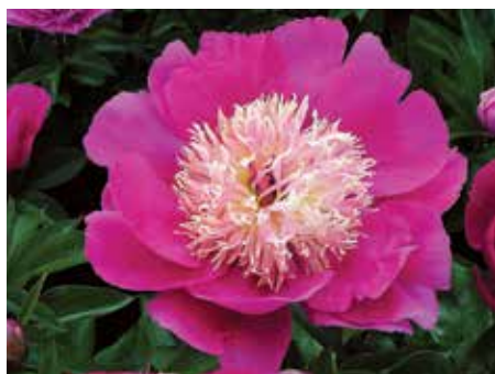
Comanche ALM $28 (Bigger, 1957)

Red, double, fragrant, midseason, 30" tall, hybrid. A recent introduction of a bright red tight bloom that stands upright on a strong stem.