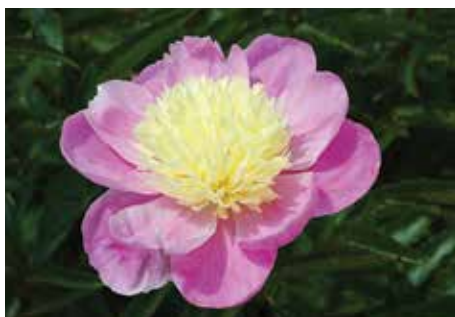
Lauren $20 (Niva/Snelson, 1999)

Blush, double, very fragrant, midseason, 36" tall, lactiflora. The pale mauve-pink flowers lighten in the center. A much loved heirloom variety with a loose, romantic form.