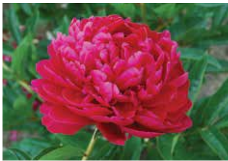
Paul M. Wild $24 (Wild, 1964)

Carmine-red, semi-double, midseason, 20" tall, hybrid. A glowing red, tulip shaped flower on a rounded, tidy, dwarf plant suitable for borders.