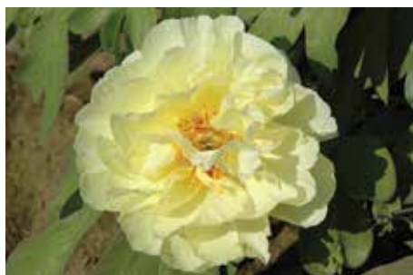
Daffodil $38 (Saunders, 1948)

Yellow, semi-double, very early, lutea hybrid tree peony. A daffodil yellow symmetrical bloom. A clear yellow with a golden tuft of stamens in the center and no flares. APS Gold Medal 1983.