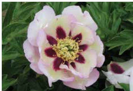
Pastel Splendor $45 (Anderson/Seidl, 1996) ITOH

Ruby-red, double, lightly fragrant, late-midseason, 36" tall, lactiflora. Large, luscious velvety red flowers that are fully double and resist fading.