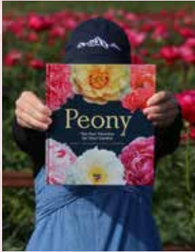
Peony Book $30

Here is an example of our merchandise for sale, please check our website www.peonyparadise.com for a complete selection and variation. All merchandise items ship for free.