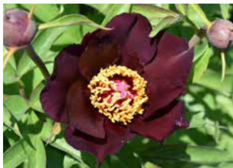
Dark Eyes (Laning, 1996)

White, double, light fragrance, late, 34" tall, lactiflora. A romantically fluffy full bloom with an inner yellow glow with a bonus of fragrance.