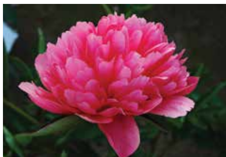
Lorelei (Hollingsworth, 1996)

Pink, japanese, midseason, 38" tall, lactiflora. Deep pink guard petals surround a spiky center of lighter petaloids etched in peach. Many side-buds for a longer bloom period.