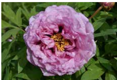
Waucedah Princess RARE $75 (D. Reath, 1988)

Red, single, early, lutea hybrid tree peony. Deep red ruffled petals surround golden stamens, average height.