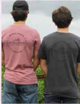
Peony Shirt $25