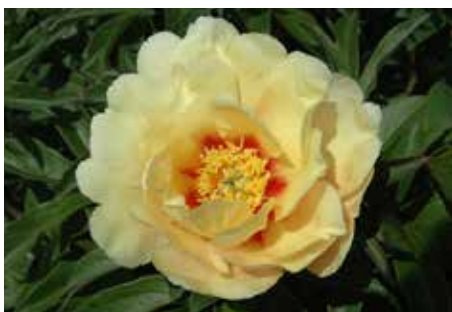
Sonoma Sun (Tolomeo, 1996) ITOH $38

Red-yellow, single, midseason, 34" tall, intersectional. Irene named it Floozy because it is a brassy red that fades to yellow with red speckles.