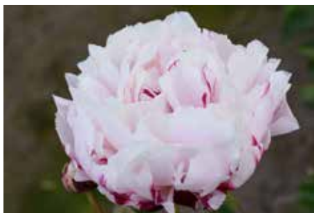
Peppermint $50 (Nicholls/Wild & Son, 1958)

Creamy pastel pink, double, early midseason, 30" tall, hybrid. A most romantic new color in peonies. Pink fades to an elegant cream tone. Strong stems, and good landscape plant.