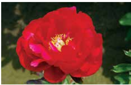
Cherry Ruffles $32 (Hollingsworth, 1996)

Pink, double, very fragrant, midseason, 32" tall, hybrid. Petals of uniform size give a carnation appearance. Wonderful spicy fragrance. Unusual bud form.