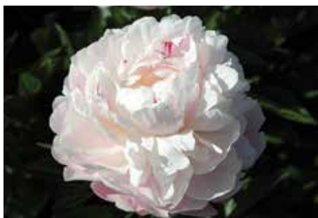
Norma Volz $26 (Volz, 1962)

Coral-pink, semi-double, lightly fragrant, midseason, 28" tall, intersectional. Luscious new color for a elegant bloom with striking foliage, excellent landscape plant.