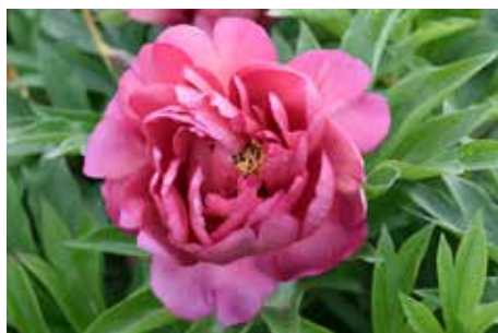
Magical Mystery Tour (Itoh) $68 (D.R. Smith, 2002)

Pink to cream, semi-double to double, mid-season, lightly fragrant, 28" tall, intersectional. Flowers open a pink color and will flush out in a creamy white with color edgings. The petal color transitions will keep you entertained.