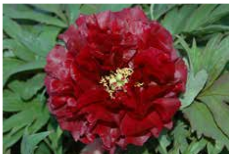
Vesuvian (Saunders, 1948)

Amber to cream, semi-double to double, early, 40" tall, lutea tree peony. The plant generously produces highly ruffled, very double blooms. Hardy in cold climates.