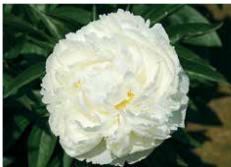
Bowl of Cream $24 (C. Klehm, 1963)

Pale pink to white, semi-double, early, 32" tall, fragrant, hybrid. A frilly pale pink bloom that glows from the red carpal tips. Strong stems and large, glossy foliage.