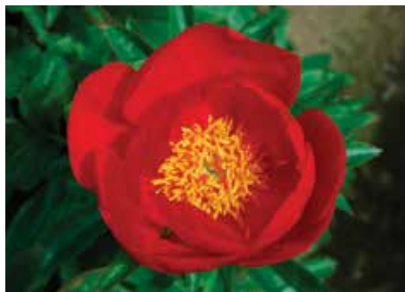
Scarlett O'Hara $30 (Falk/Glasscock, 1956) ALM

Pink, semi-double, midseason, 32" tall, hybrid. A cupped, warm salmon-pink delight with dark green glossy foliage. 2008 APS Gold Medal.