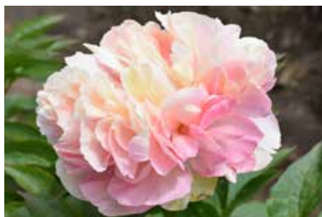
Lois' Choice (Laning, 1993)

Yellow, semi-double, midseason, 34" tall, intersectional. A delightful light yellow bloom that can have a lavender streak, or can even be half lavender.