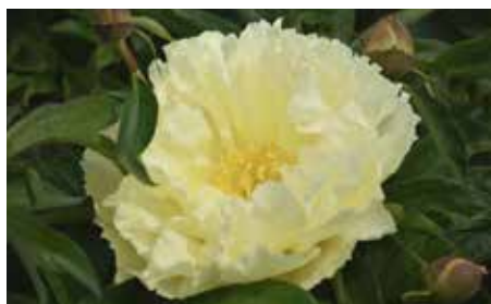
Fizzy $100 (Adelman, 2023)

White, single, early midseason, 36" tall, hybrid. Red accents make lovely simplicity on the white bloom. Nice rounded foliage. Many side buds for a good show of blossoms.