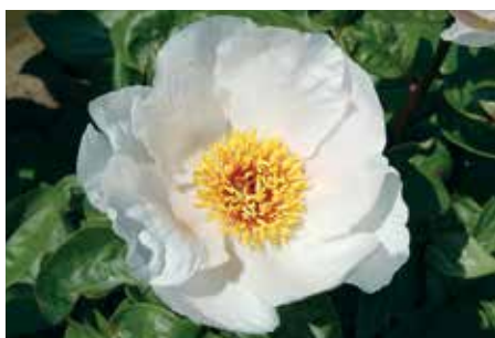
Garden Peace $26 (Saunders, 1941)

Lavender-pink, semi-double, lightly fragrant, early, 28" tall, intersectional. Pink to lavender semi-double with red flares that bloom in abundance at the top of the lovely plant.