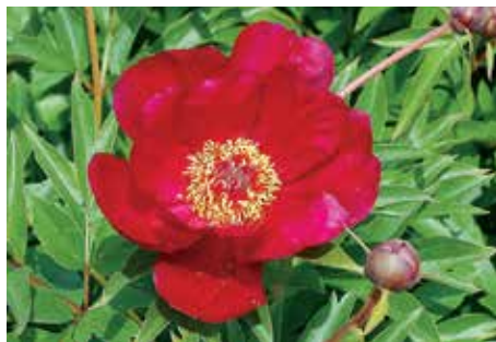
Scarlet Heaven $42 (Anderson, 1999) ITOH

Salmon, single, early, fragrant, 30" tall, hybrid. Three rows of light salmon-colored petals surround a center of yellow stamens accented by celery-green carpals tipped in pink.