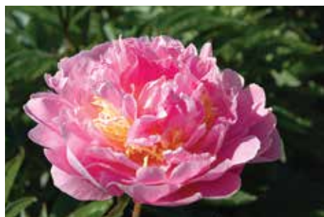
LaDonna $20 (Hollingsworth, 1997)

Pink double, lightly fragrant, late-midseason, 33" tall, hybrid. A fluffy, loose pink and yellow flower with an arching stem for a romantic appearance.