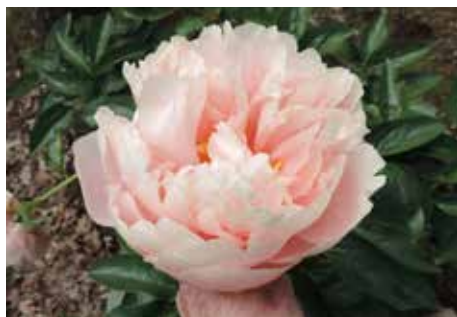
Nelda's Joy $125 (Hollingsworth, 2012)

Light pink, semi-double to double, early midseason, 30" tall, hybrid. Flowers in a shell pink color, held a little above broad green leaves. Unique color for its bloom time.