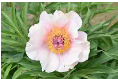
Nosegay $32 (Saunders, 1950)

Blush, double, late-midseason, 36" tall, lactiflora. Blush or light pink bloom with full rose flower form. An outstanding beauty. APS Gold Medal 1941 and 1969.