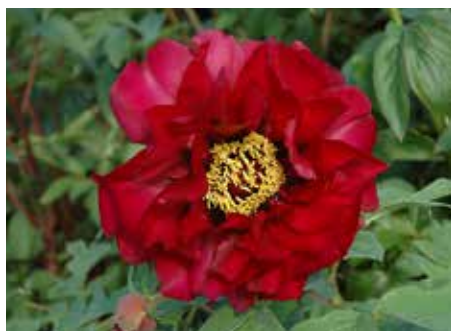
Pluto $70 (Daphnis, 1987)

Red, single, very early, 34" tall, lutea hybrid tree peony. Copper-red flowers with great simplicity on a lovely landscape bush.