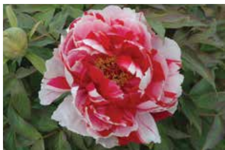
Shima Nishiki $80 (Japan)

Pink, semi-double, early, 40" tall, suffruticosa tree peony. Forms a nicely rounded bush with abundant salmon-pink with a stripe of maroon colored blooms.