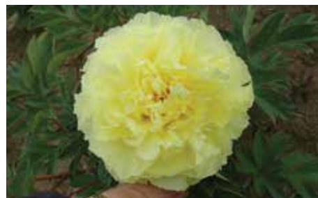
Sonoma Halo (Tolomeo, 2007) ITOH $150

Yellow, single, midseason, 35" tall, intersectional. Opening a rosy yellow and turning to clear yellow with small red center flares.