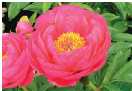
Cytherea (Saunders, 1953)