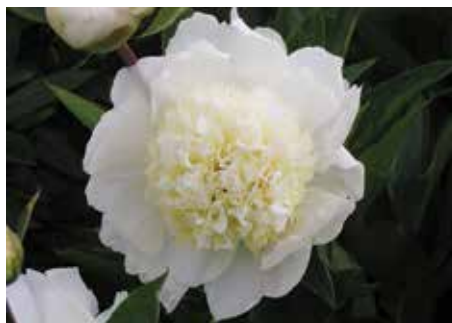
Charlie's White $20 (C. Klehm, 1951)

Pink, double, very fragrant, late, 34" tall, lactiflora. A romantically fragrant bloom of pink interspersed with creamy petals.