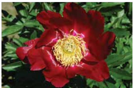
Mahogany (ALM) $28 (Glasscock, 1937)

Pink, double, very fragrant, late, 34" tall, lactiflora. Very large, warm flowers with a pleasant fragrance. Needs support.