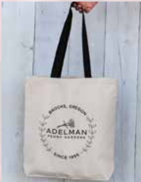
Tote Bag $20