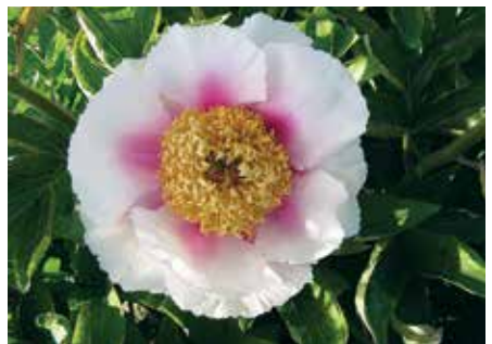
Athena (Saunders, 1955)

White, full double, very fragrant, late, 32" tall, lactiflora. Large, lovely, full double flowers need support. You'll love the rose fragrance!