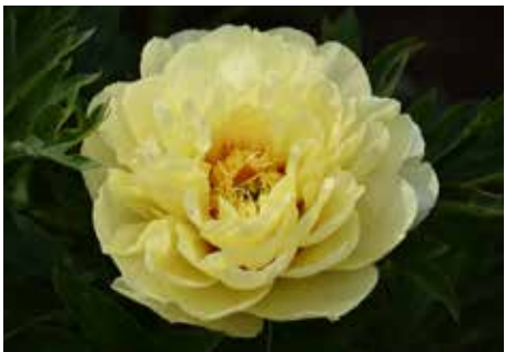
Bartzella (ALM) (ITOH) $45 (Anderson, 1986)

Red, bomb, very fragrant, early-midseason, 36" tall, lactiflora. Excellent flower on stiff stems. Good in hot climates. Love that fragrance - rare in red peonies!