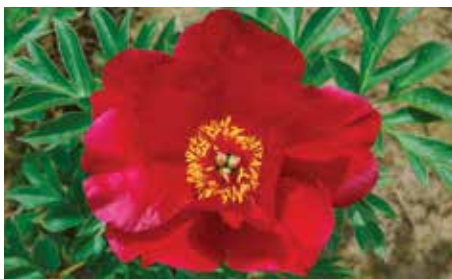
Sonoma Velvet Ruby (Tolomeo, 1999) ITOH $35

Brilliant pink, single, midseason, 39" tall, intersectional. Very bright pink with darker flares in center around yellow stamens and yellow carpel tips.