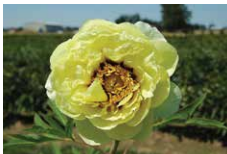
High Noon (Saunders, 1952) $65

Yellow, semi-double, fragrant, early, lutea hybrid tree peony. A robust yellow flower with dark center flares. Late summer blooms sometimes appear. APS Gold Medal 1989.