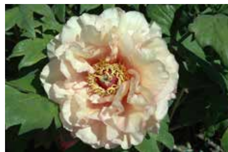
Sunrise $50 (D. Reath, 1995)

Deep red, single, early, lutea tree peony. Strong growing plant with ample medium sized blooms. Another wonderful variety from Irene Tolomeo's collection.