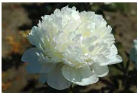
Princess Bride $22 (R. Klehm, 1988)

Blush, single, midseason, 36" tall, lactiflora. A lovely single that opens pink and fades marble and then white. Heavy bloomer. Delightful small flower!