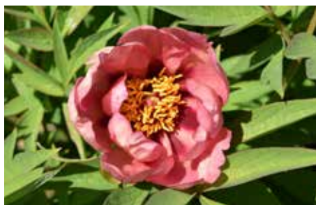
Sonoma Sisters $200 (Tolomeo/Adelman, 2023)

Purple, semi-double, early, 48" tall, suffruticosa tree peony. An exciting bright color that calls you to the garden.