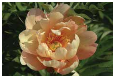
Singing in the Rain ITOH $55 (D. R. Smith, 2002)

Lavender, semi-double, midseason, 34" tall, intersectional. Abundant flowers on this appealing intersectional. Broad, dark green foliage.