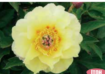
Garden Treasure $50 (Hollingsworth, 1984)

Light yellow, semi-double, midseason, 34" tall, intersectional. A sport found in Lemon Dream. It is set apart by the 'pinking shear' petal edges. Most blooms are fully yellow with a few showing a slight rosy blush in the center.