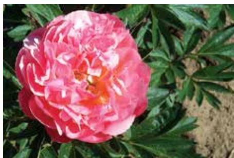
Pink Hawaiian Coral ALM $28 (R. Klehm, 1981)

Pink, double, very fragrant, midseason, 30" tall, lactiflora. A delicate flower on a shorter plant that holds the flowers up nicely.