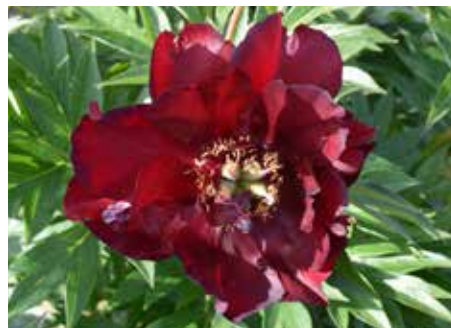
Chief Black Hawk ITOH $80 (Anderson/Kornder, 2008)

White, crown double, lightly fragrant, early, 36" tall, lactiflora. Large outer petals surround white center glowing yellow from inside.