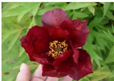
Thunderbolt RARE NEW $100 (Saunders, 1948)

Dark red, double, lightly fragrant, early, 25" tall, lutea hybrid tree peony. A compact, rounded plant with abundant full double dark red blooms.