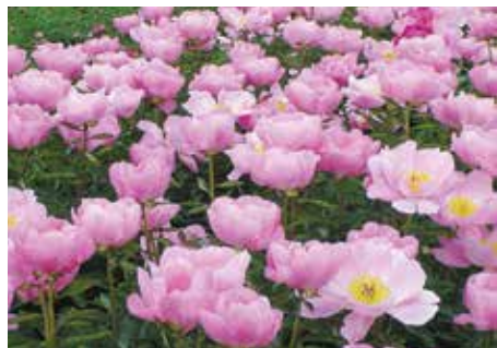
Dawn Pink (Sass, 1946)

Pink, double, very fragrant, late, 36" tall, lactiflora. Beautiful symmetrical blooms, shaped like a rose, with consistent dark pink color.