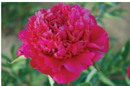
Big Ben (Auten, 1943) $20

Pale lavender, single, midseason, 32" tall, intersectional. A delicate lavender flower with color intensifying in the center. Outstanding landscape plant.