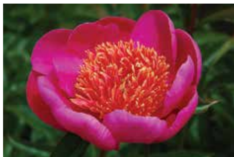
Leslie Peck (Niva/Snelson, 1999)

Multicolored, double, early, 30" tall, hybrid. A fluffy pink and yellow bloom that is fascinating in the color variation from light pink to yellow to a little darker pink.