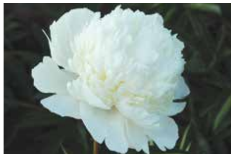
Capital Dome (Bigger, 1979) $20

Very dark red, semi-double, lightly fragrant, early, 30" tall, hybrid. Very dark almost chocolate-red petals are sprinkled with golden stamens. APS Gold Medal 2010.