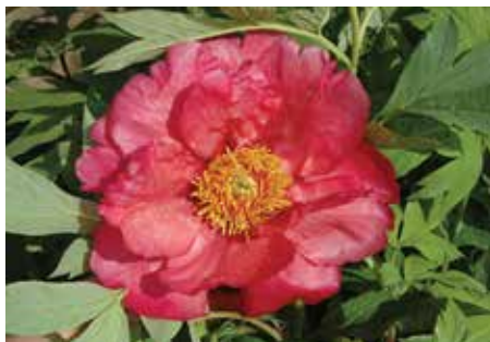
Renown $50 (Saunders, 1949)

Yellow with a blend of red, single, fragrant, early, 60" tall, lutea hybrid tree peony. A blend of colors alight with sunlight drawing you to its center.