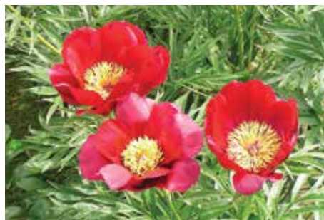
Merry Mayshine (Saunders/Smetana, 1994)

Deep pink, double, midseason, 24" tall, hybrid. A very deep pink double with outer petals that fade after opening. Outstanding color!