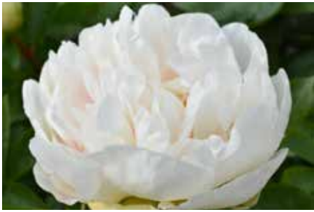
Greenland $75 (Pehrson/Seidl, 1989)

White, double, early, 30" tall, hybrid. Flower opens white, can be blush. Shaded green guard petals shown in bud or underneath once flower opens. No support needed.