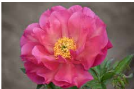
New Millennium ITOH $85 (Anderson, 2012)

Deep garnet, Japanese, lightly fragrant, late, 32" tall, lactiflora. The garnet blooms have petaloid tips flushed and edged in gold. Lovely in arrangements. A real bonus is reddish colored seedpods.