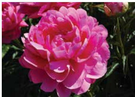
Princess Margaret $26 (Murawska, 1960)

Dark pink, double, fragrant, late-midseason, 34" tall, lactiflora. This enormous full double flower is a rich rose-pink with strong stems. APS Grand Champion 1974.