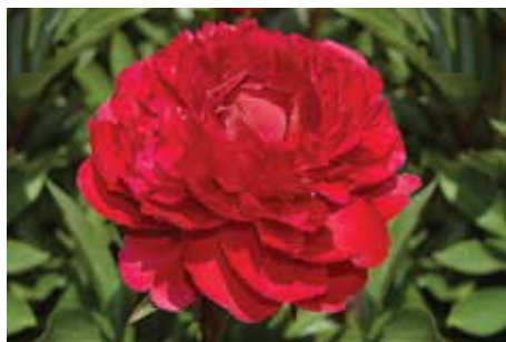
Shawnee Chief $20 (Bigger, 1940)

Red, double, fragrant, late-midseason, 36" tall, lactiflora. Outer 3 rings of petals are larger than center petals. Strong stems and a good cut flower.