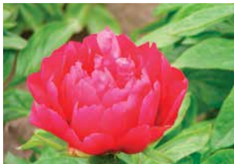
Paladin $20 (Saunders, 1950)

Carmine-red, semi-double, midseason, 20" tall, hybrid. A glowing red, tulip shaped flower on a rounded, tidy, dwarf plant suitable for borders.