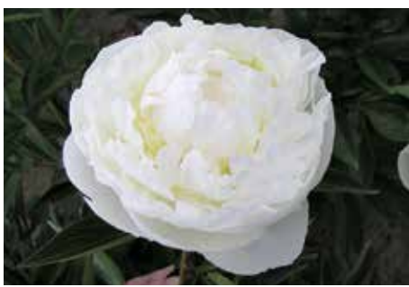
Duchess de Nemours (Calot, 1856)

Rose pink, single, lightly fragrant, midseason, 34" tall, lactiflora. Striking bright pink single with a glowing yellow center. A row in bloom makes a "sea of warm pink"!