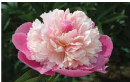
Bowl of Beauty $22 (Hoogendorn, 1949)

White, bomb, fragrant, midseason, 34" tall, lactiflora. An elegant ivory-white bloom with graceful form.