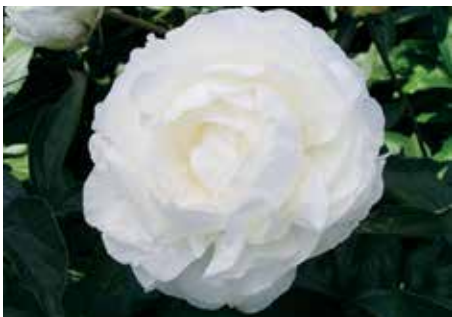
Ann Cousins (Cousins, 1946)

Pink, double, very fragrant, late-midseason, 32" tall, lactiflora. Rose-type flower with a deep pink hue on strong stems.