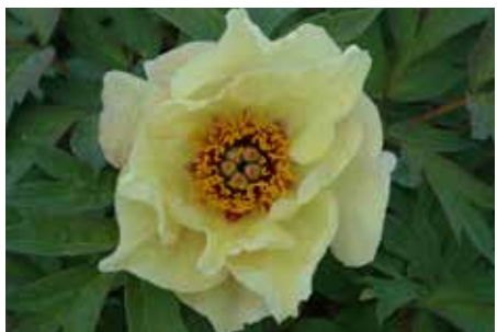
Tria $36 (Daphnis)

Pink, semi-double to double, fragrant, very early, 24" tall, lutea tree peony. Dark flares add to its lustrous presence. Opens glistening pink, fading to a pale, elegant pink.