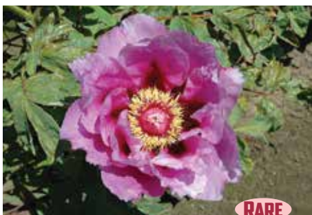
Guardian of the Monastery $65 (Gratwick, 1959)

Pale pink, single to semi-double, to 60" tall, suffruticosa tree peony. Dark purple flares in the center draw you to this delicate flower that fades from light pink to white.