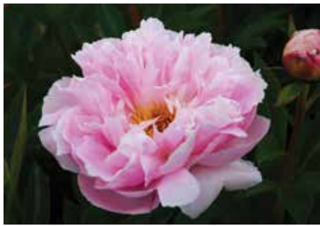
Anne Oveson (Tolomeo, 2005)

Cameo-pink, bomb, very fragrant, midseason, 32" tall, lactiflora. A charming pastel pink with a narrow band of ivory petals at the base. APS Gold Medal 2005.