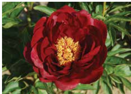
Red Glory $30 (Auten, 1937)

Raspberry-red, semi-double, midseason, 36" tall, hybrid. A very lovely color enhanced with a center of golden stamens. Reliable with strong stems.