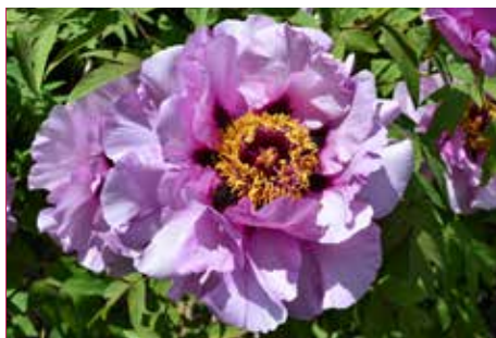
Angel Emily (Seid/Bremer, 2013) NEW $126

Other growers use a quick way to increase tree peonies by grafting a piece from the parent plant onto a piece of herbaceous root to provide a quick-start energy supply for the tree peony. Sometimes the vigorous herbaceous root takes over to the detriment of the tree peony. In some cases the herbaceous will come up and bloom beside the tree peony. Own-root peonies are also an advantage if the top is damaged by severe freezing or accidental cut down the root will send up more buds and stems that will be the same variety as planted.