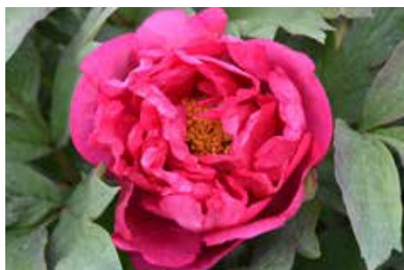
KC Red (Seidl/Bremer, 2018) $100

Red, single, early, up to 40" tall, lutea hybrid tree peony. Named for the mythological son of Daedalus. The pure red outer petals stretch out like wings.