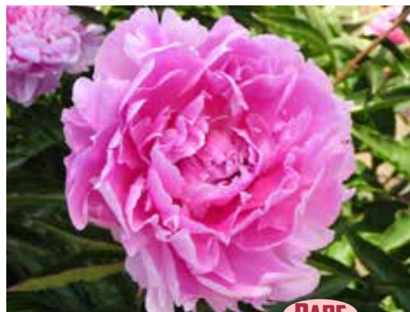
Queen of Hamburg $38 (H.P. Sass/Interstate Nurseries, 1937)

Pink, double, fragrant, midseason, 36" tall, lactiflora. Like a scoop of vanilla ice cream drizzled with raspberry topping. Distinctive coloring. Excellent cut flower.