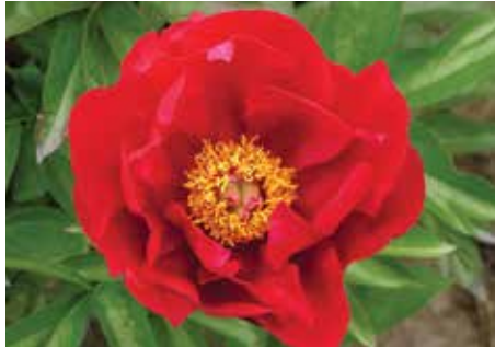
Blaze (Orville W. Fay, 1973) $18

Yellow, semi-double to double, lightly fragrant, midseason, 34" tall, intersectional. Lemon-scented flowers on an outstanding landscape plant. APS Gold Medal 2006.