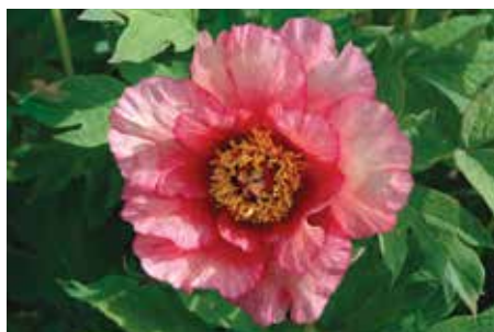
Ruffled Sunset $75 (D. Reath, 1988)

Red, semi-double, very early, 40" tall, lutea hybrid tree peony. A rich red ruffled bloom with dark flares behind the golden stamens.