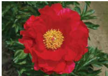
Carina (Saunders, 1944) $24

Creamy yellow with apricot hues in center, semi-double to double, lightly fragrant, midseason, 28" tall, intersectional. A wonderful color combination with healthy foliage.