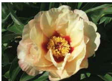
Sonoma Apricot ITOH $60 (Tolomeo, 1999)

Apricot, semi-double, lightly fragrant, midseason, 36" tall, intersectional. Bloom appears light orange upon opening, fading to yellow.