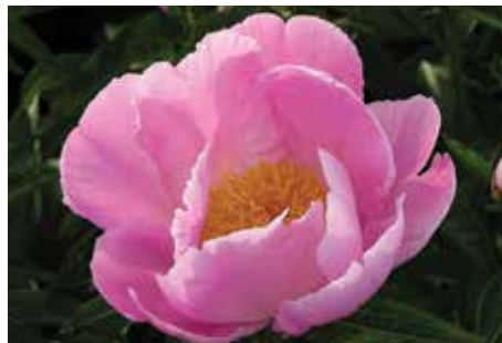
Sea Shell $20 (Sass, 1937)

Pink, double, fragrant, late, 36" tall, lactiflora. Double flowers of soft seashell pink with petals edged a trifle lighter with a few crimson flecks. Tried and true, lovely pink.