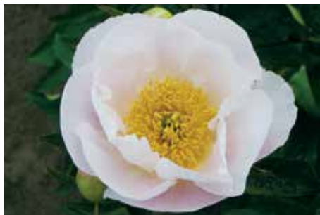
Stardust (Glasscock/Falk, 1964) $20

Light yellow, single, midseason, 33" tall, intersectional. The bloom opens apricot color and fades to a lively yellow. The plant has generous blooms and attractive leaves.