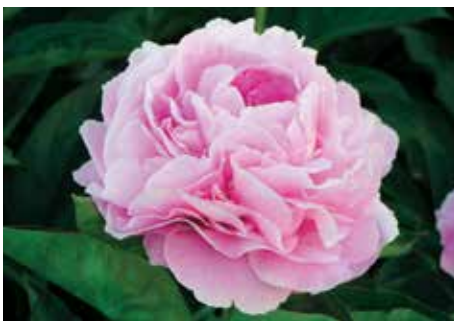
Dresden Pink (Wild & Son, 1957)

Red, single, light fragrance, early-midseason, 28" tall, intersectional. Very deep dark coloring. Smaller flowers on a strong bushy plant.