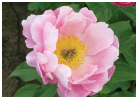
Salmon Chiffon $48 (N. Rudolph/R. Klehm, 1981)

Salmon, single, early, fragrant, 30" tall, hybrid. Three rows of light salmon-colored petals surround a center of yellow stamens accented by celery-green carpals tipped in pink.