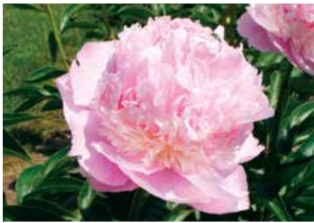
Angel Cheeks (C. Klehm, 1970)