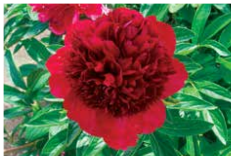
Red Charm $26 (Glasscock, 1944)

Pink, double, late midseason, 34" tall, lactiflora. Bright light shade of pink, gleams in the garden. Strong plant, although support may be needed.