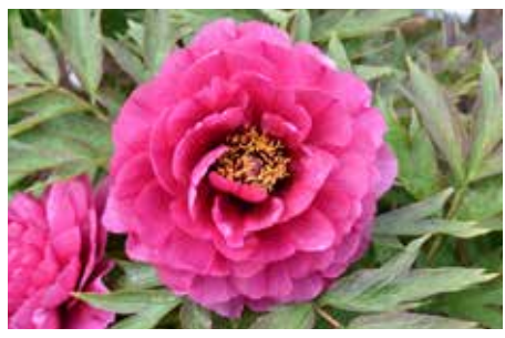
Leda (Daphnis, 1977) $75

Creamy white with purple flares, double, early, lutea hybrid tree peony. A white mutation of Age of Gold. Good, reliable grower.