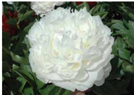
Amalia Olson (Olson, 1959) $32

Red, semi-double, early, 30" tall, hybrid. Rarely available. A strong, warm red bloom held high above the foliage. The glow on this shorter plant can brighten a spot in your garden.