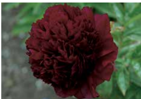
Commando RARE $42 (Glasscock, 1944)

White, double, fragrant, midseason, 36" tall, lactiflora. A creamy white full, fragrant bloom with pleasingly cupped petals.