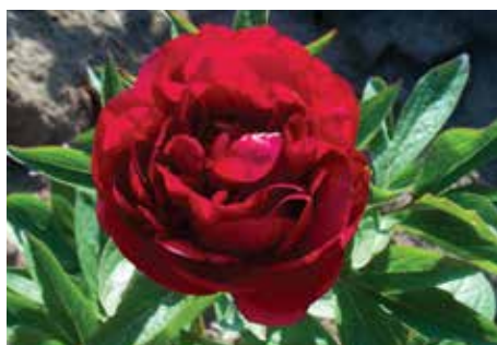
Rosedale $24 (Auten, 1936)

Deep red, bomb, fragrant, midseason, 32" tall, hybrid. The same color as Red Charm but with a flower so tightly petaled it is almost a complete globe. One large flower per stem.