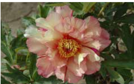
Sonoma Surprise (Tolomeo/Adelman) ITOH $100

Yellow, double, midseason, 34" tall, intersectional. A huge full yellow flower sometimes having a touch of red in the center. A 1st year plant had 5 large buds, one was taken to the APS show where it received Court of Honor.