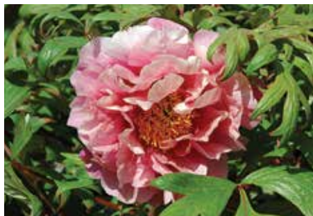
Marie Laurencin $52 (Daphnis)

Pink, single to semi-double, early, 30" tall, lutea hybrid tree peony. A beautifully formed flower on a short plant. Named after the painter of the same name.