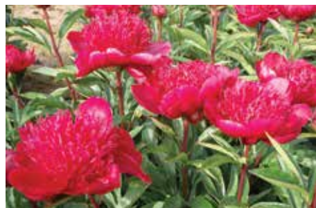
Jean Ericksen $20

Pink, double, midseason, 32" tall, lactiflora. Opens pink and fades to lovely picotee edgings. A shorter, nicely shaped landscape plant.