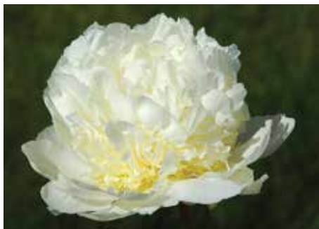
Bridal Shower $26 (R. Klehm, 1981)

Yellow, single, midseason, 22" tall, intersectional. This light yellow intersectional is short and bushy. Nice landscape plant.