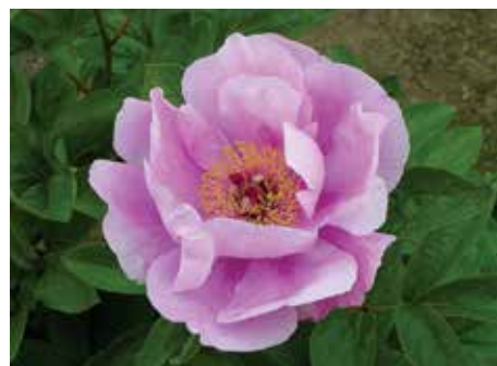
May Lilac (Saunders, 1950)

Red, single, fragrant, early, 30" tall, hybrid. Bright crimson flowers with yellow centers stand tall on the unusual ferny-leaved plant.