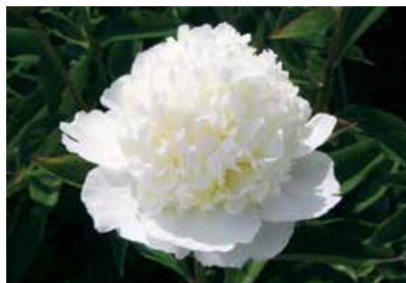
Lancaster Imp $20 (R. Klehm, 1987)

Pink, japanese, fragrant, midseason, 36" tall, lactiflora. Canary yellow centers set off the pink petals of a very upright flower on dark green foliage.