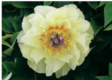
Border Charm ITOH $35 (Hollingsworth, 1984)

Creamy white, double, lightly fragrant, midseason, 34" tall, lactiflora. Very large, luscious cream-white flower. Wonderful cut flower! APS Gold Medal 1981.