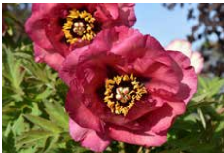
Gauguin $50 (Daphnis)

Lavender, semi-double, early, rockii hybrid tree peony. A striking contrast of lavender/mauve, yellow stamens and deep purple center flares within each large flower.