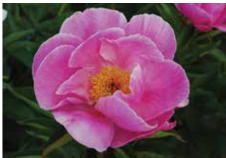
Color Magnet $20 (Hollingsworth, 1994)

Dark red, bomb, early, 36" tall, hybrid. The dark burgundy flowers are very compact with the guard petals presenting the center pouf delectably. One of our very darkest red peonies.