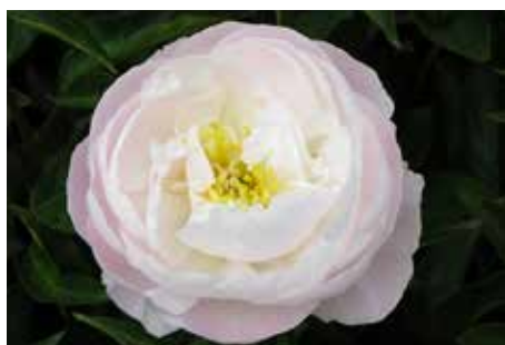
Miss America (Mann/van Steen, 1936)

Yellow, semi-double, early, 32" tall, hybrid. Semi-double to double, light yellow, fading to cream as the flower matures.