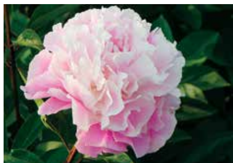
Lady Alexandra Duff $22 (Kelway, 1902)

Yellow, anemone to bomb, midseason, fragrant, 32" tall, lactiflora. White guard petals surround a mound of narrow lemon-yellow petals which mature to white with age.