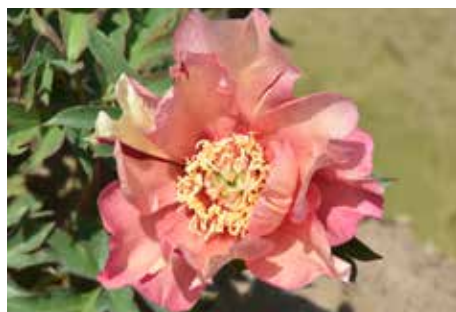
Sonoma Floozy (Tolomeo, 2001) ITOH $45

Red-yellow, single, midseason, 34" tall, intersectional. Irene named it Floozy because it is a brassy red that fades to yellow with red speckles.