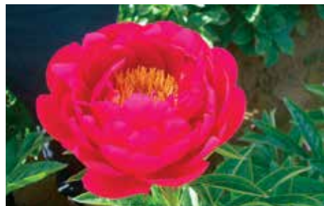
Raspberry Charm $28 (Wissing/R. Klehm, 1985)

Deep red, bomb, fragrant, early, 32" tall, hybrid. Gigantic bomb of deep crimson with a multitude of petals. Slight clove fragrance. One of our most popular peonies.