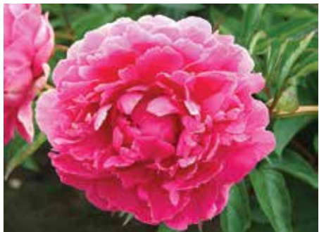
Armistice (Kelsey, 1938)

White, single, very early, 24" tall, hybrid. White flower with predominant dark pink to lavender veins present at opening and tend to fade out, good stem strength.