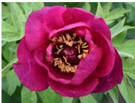
Wild Forest Blackberry $150 (Seidl/Bremer, 2017)

Yellow, single, very early, 40" tall, lutea hybrid tree peony. An apricot/yellow bloom with a delicate look of crumpled silk. Three flowers per stem make a long bloom period.