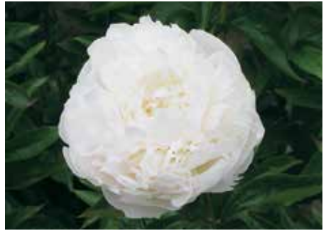
Henry Sass $24 (Sass/Interstate Nurseries, 1949)

White, double, early, 30" tall, hybrid. Flower opens white, can be blush. Shaded green guard petals shown in bud or underneath once flower opens. No support needed.