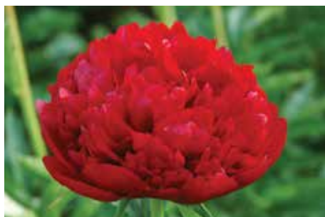
Christmas Velvet $50 (Anderson, 1992)

Red, double, fragrant, midseason, 30" tall, hybrid. A recent introduction of a bright red tight bloom that stands upright on a strong stem.