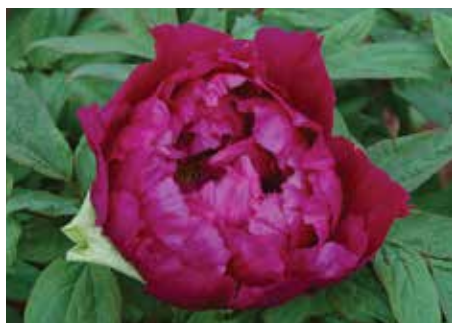
Shima Daijin $52 (K. Ikeuchi, 1952, Japan)

Purple, semi-double, early, 48" tall, suffruticosa tree peony. An exciting bright color that calls you to the garden.