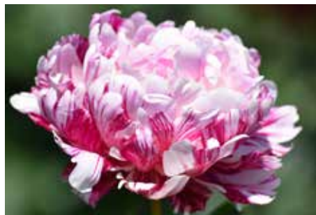
Candy Stripe (Anderson, 1992) $42

White, double, fragrant, midseason, 28" tall, lactiflora. A white rose-shaped bloom with a pink glow. APS Best of Show 2008.