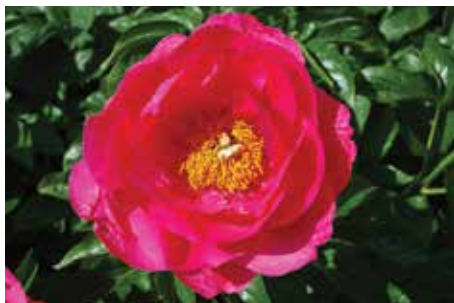
Paula Fay $24 (Fay, 1968)

Creamy white with maroon flares, single, midseason, 33" tall, intersectional. A multi-colored flower with a large center of carpels surrounded by purple flares.