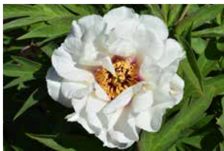
Ice Age (Seidl, 1996) $65

Pinkish red, semi-double, early, 54" tall, lutea hybrid tree peony. Ruffled petal edges on this uniquely colored plant. Steady reliable grower.