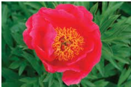
Pink Teacup $26 (Hollingsworth 2001)

Pink, single, early, 20" tall, hybrid. A compact plant with finely divided foliage and deep pink cupped flowers. A compact plant with narrow leaves.