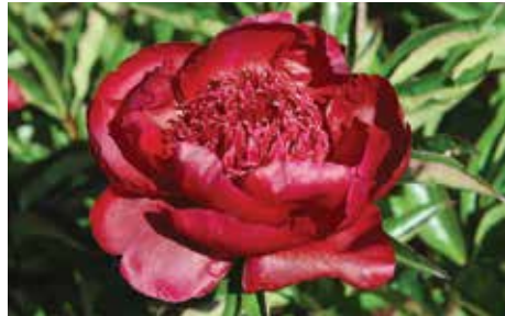
Hot Chocolate $32 (H. Sass/Reynolds, 1971)

Rich cardinal red, double, fragrant, midseason, 40" tall, hybrid. Heavy petal substance with a deep red sheen. Large flowers on long stems. May need support.