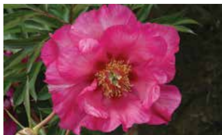
Sonoma Rosy Future (Tolomeo, 2005) ITOH $45

Yellow/peachy/purple, single, midseason, 34" tall, intersectional. The surprise is the variation of each individual bloom, from peachy apricot to yellow and some purple. Some instability due to two species being crossed.