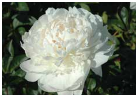
Class Act $24 (R. Klehm, 1991)

Magenta, japanese, lightly fragrant, midseason, 36" tall, lactiflora. A striking color contrast in a bright flower that will cheer the gardener.