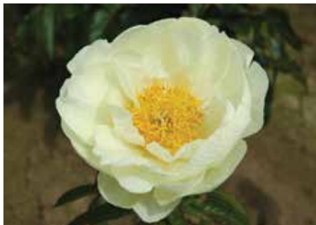
Prairie Moon $28 (Fay, 1959)

Pink, single, early, 20" tall, hybrid. A compact plant with finely divided foliage and deep pink cupped flowers. A compact plant with narrow leaves.