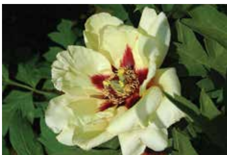
Golden Experience $36 (D. Reath, 2000)

Yellow, semi-double, very early, lutea hybrid tree peony. A daffodil yellow symmetrical bloom. A clear yellow with a golden tuft of stamens in the center and no flares. APS Gold Medal 1983.