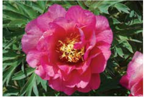
Hillary ALM ITOH $50 (Anderson, 1999)

White, single, early, 32" tall, hybrid. Crimson stems, stigmas and filaments accent the pure white petals. As near to perfection that a flower can get!