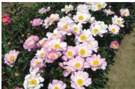
Polly Sharp $20 (Warner, 1996)

Red, single, lightly fragrant, midseason, 36" tall, lactiflora. A deep mahogany red cupped flower with large petals of substance.