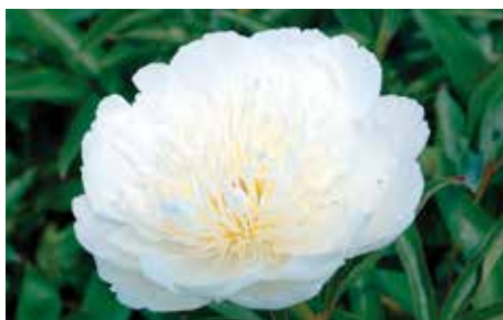
Bride's Dream $24 (Krekler, 1965)

Pink, japanese, very fragrant, midseason, 32" tall, lactiflora. Pink outer petals surround a creamy center. When vigorous it may send rose petals bursting from center!