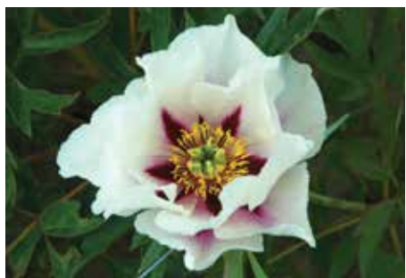
Ezra Pound $45 (Gratwick, 1985)

Yellow, semi-double, early, 48" tall, lutea hybrid tree peony. An open airy yellow with dark center flares. For hybridizing it is pod and pollen fertile.