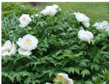
Ice Storm (Smithers, 1992) $60

Yellow, semi-double, fragrant, early, lutea hybrid tree peony. A robust yellow flower with dark center flares. Late summer blooms sometimes appear. APS Gold Medal 1989.