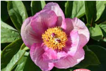
Anika (Burrell, 1995)

Pink, semi-double, fragrant, midseason, 35" tall, lactiflora. Strong stems hold the large up-facing 6"- 8" bloom erect. Rose red stigmas add liveliness.