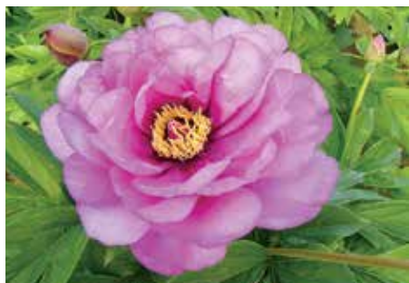
First Arrival $55 (Anderson, 1986)

Pink, japanese, lightly fragrant, midseason, 30" tall, lactiflora. Soft pink luminous petals cup a center of pale yellow lacy staminodes. Abundant fragrant flowers stand up well.