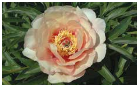
Sonoma Welcome (Tolomeo, 1999) ITOH $50

Light yellow, single, midseason, 33" tall, intersectional. The bloom opens apricot color and fades to a lively yellow. The plant has generous blooms and attractive leaves.