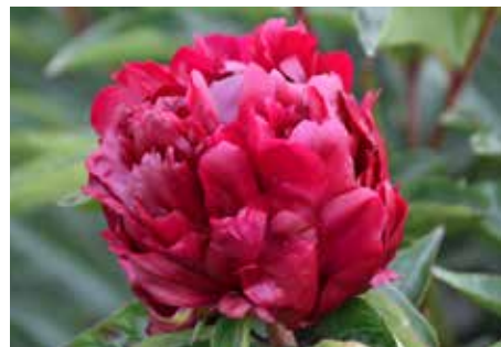
Judy Becker $32

Red, japanese, midseason, 36" tall, lactiflora. A deep red flower with feathery petals in the center. Compact and sturdy bloom that does not need support.