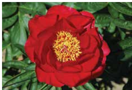
Red Red Rose $28 (Saunders, 1942)

Dark red, semi-double to double, lightly fragrant, early, 26" tall, hybrid. A deep red flower that resembles an old fashioned rose. A wonderful, compact border plant.