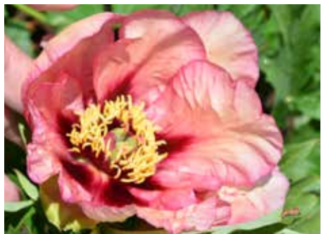
Ariadne (Daphnis, 1977) $75

Yellow, full semi-double, fragrant, early, 30" tall, lutea hybrid tree peony. Bright lemon-yellow with tightly packed petals that hang down on a short bush.