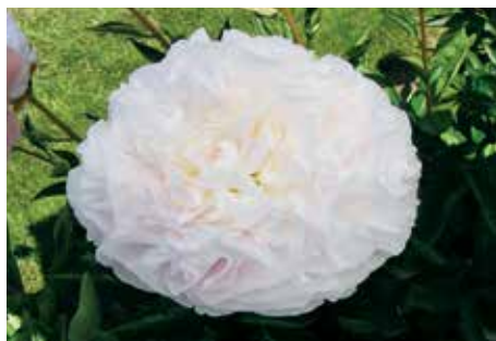
Lillian Wild (Wild, 1930)

Orange pink, bomb, fragrant, midseason, 26" tall, hybrid. Strong stems hold medium-size flowers that open orange-pink and fade to apricot-orange. Sweet/spicy fragrance.