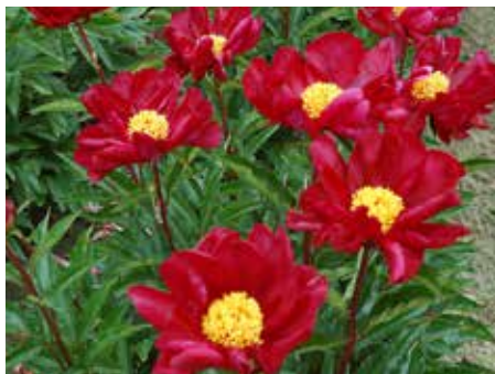
President Lincoln $32 (Brand, 1928)

White, japanese, fragrant, midseason, 36" tall, lactiflora. The white guard petals have a pink flush. The center is a mound of yellow staminodes creating a lacy pastel effect.