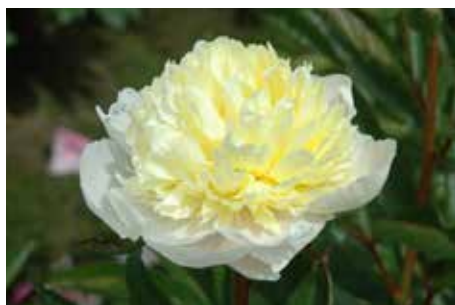
Laura Dessert $30 (Dessert, 1913)

Pink double, lightly fragrant, late-midseason, 33" tall, hybrid. A fluffy, loose pink and yellow flower with an arching stem for a romantic appearance.