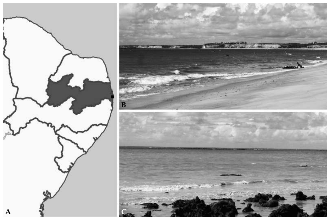
Fig. 1. A. Map of study area (northeastern Brazil: state of Paraíba). B-C. Photos of intertidal zone on Jacarapé Beach (state of Paraíba) showing sandy bottoms and diffuse rocky aggregations.