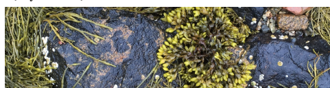
Figure 1: Intertidal lichen species in the genera Verrucaria and Wahlenbergiella (Black crusts on rocks)