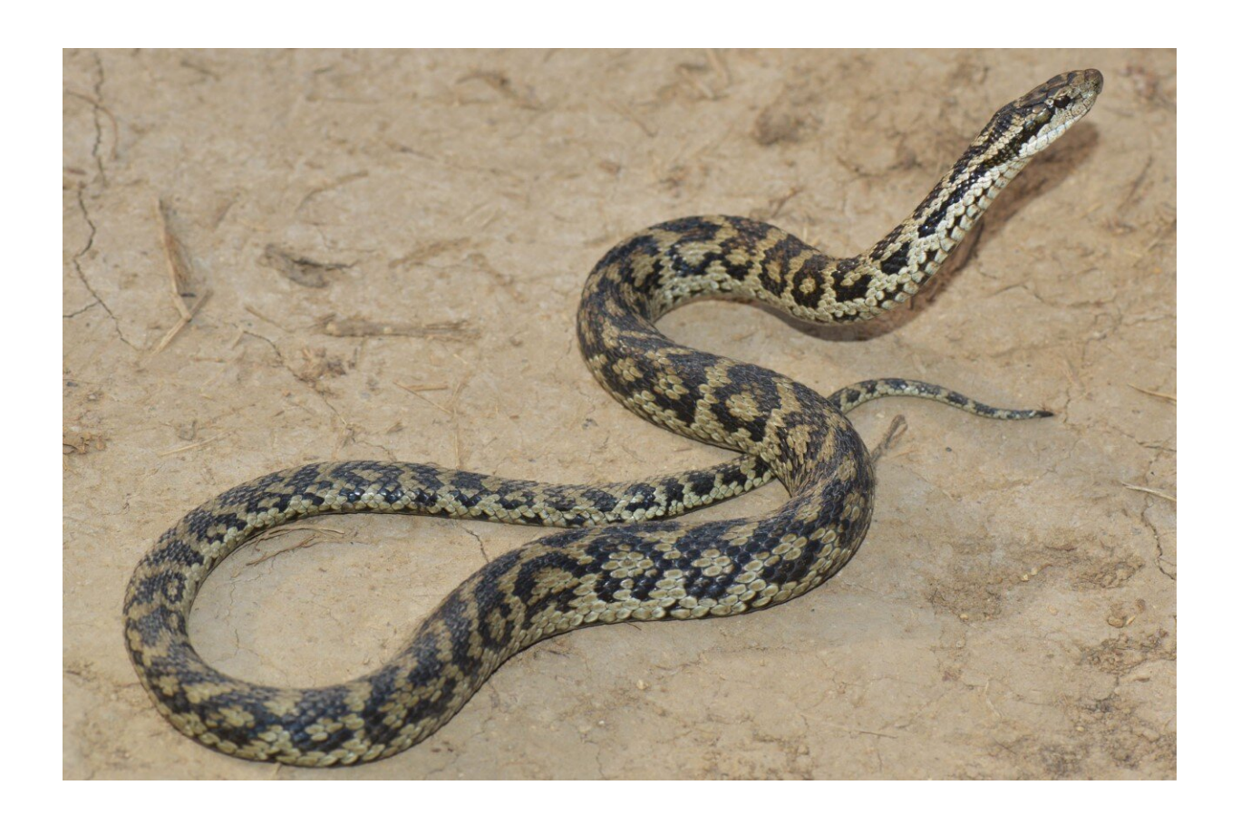
Nujiang pit viper (Gloydius lipipengi sp. nov).

Gloydius swild, the new species from Heishui, Sichuan, is in turn named after the SWILD Group, which studies the fauna and biodiversity of southewst China. They discovered and collected the snake during an <a href="mailto:expedition">expedition</a> to the Dagu Holy-glacier.