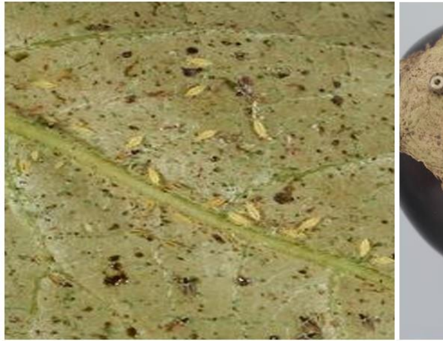
Fig. 3: Thrips feeding on the underside of a leaf.