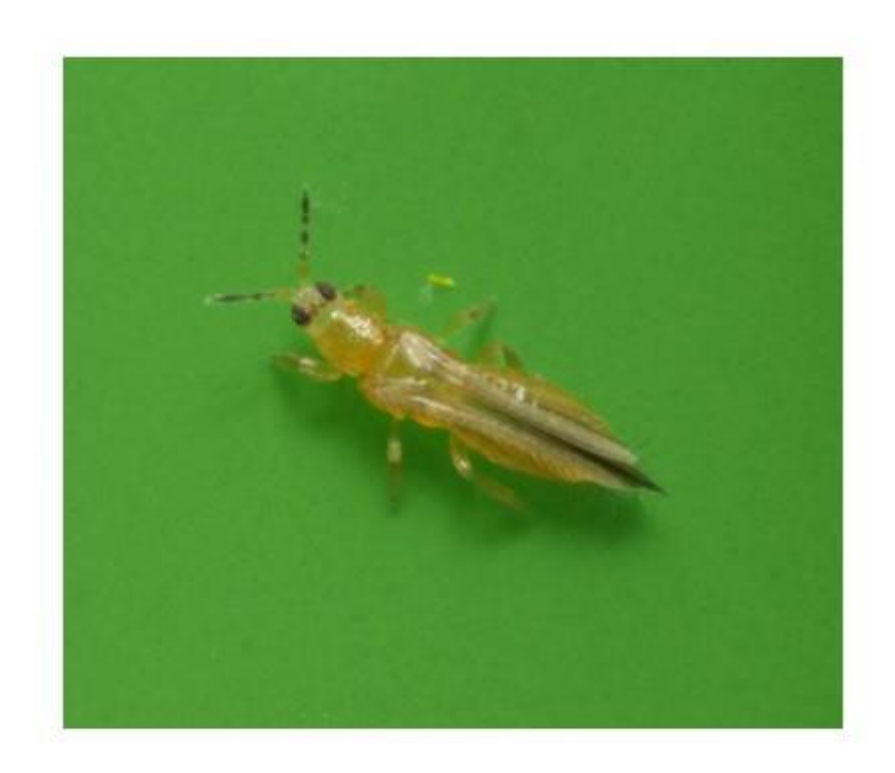
Fig. 1: Adult female Thrips palmi.