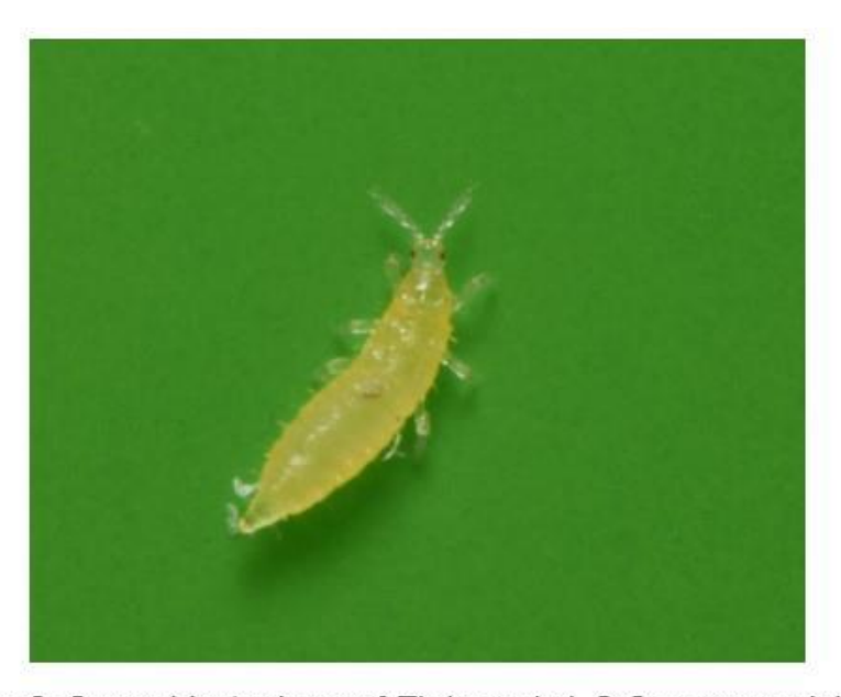
Fig. 2: Second-instar larva of Thrips palmi.

Thrips palmi adults are almost entirely yellow in colouration, although a dark longitudinal line is formed by the joining of the wings when they are held at rest (Figure 1.). The creamy-yellow larval (immature) stages lack wings, but are otherwise generally similar in appearance to the adults (Figure 2.). Identification of the thrips is hampered by both their small size (1.0-1.3 mm) and their great similarity to other yellow or predominantly yellow species of Thrips particularly T. flavus , a common but economically-unimportant flower thrips found throughout the UK. Within a glasshouse context, species that might be confused with T. palmi include the onion thrips ( Thrips tabaci ) and western flower thrips ( Frankliniella occidentalis ). Thrips palmi can only be distinguished with certainty from other species of thrips by means of laboratory examination.