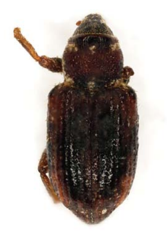
Figure 4. A rubbed specimen of L. bonariensis

The waxy scales and hairs are easily rubbed-off and are often missing from specimens (Fig. 4). This could potentially lead to specimens being overlooked. In addition there are other small brown weevils, some with scales that may be mistaken for Listronotus in the field.