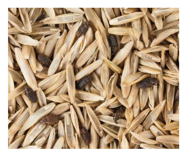
Figure 5. L. bonariensis amongst Lolium sp. seeds