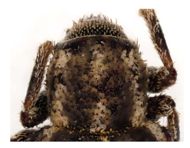
Figure 2 Elytra covered in waxy scales and stiff upright hairs (arrowed)