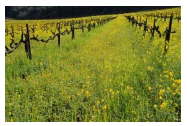
Volunteer field mustard cover crop in a California vineyard.

Cover crop: Field mustard is used as a winter annual or rotational cover crop in vegetable and specialty crops as well as row crop production. It has the potential to prevent erosion, suppress weeds and soil-borne pests, alleviate soil compaction, and scavenge nutrients (Clark, 2007). It has rapid fall growth, high biomass production, and nutrient scavenging ability following high input cash crops. Field mustard can be grown as a cover crop alone or in a mix with other brassicas, small grains, or legumes. In the Northeast, Mid-Atlantic, and Great Lakes bioregions, it appears to be a good tool as a biofumigant cover crop for control of nematodes, soil-borne diseases including the fungal pathogen (Rhizoctonia) responsible for damping-off, weeds, and other pests. When biomass is incorporated into the soil, soil microbes break down sulfur compounds in the plant into isothiocyanide, which can act as a fumigant and weed suppressant (Olmstead, 2006). Field mustard produces 2,000 to