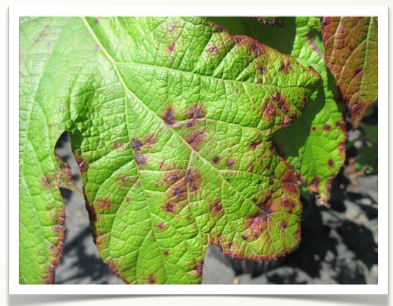
A leaf spot disease on oakleaf hydrangea.

preserve biological diversity, select plants with pest resistance, proper site selection. 2. Monitor: Frequently scout for pests on plants, monitor insect traps, monitor crop nutrient and pH levels.