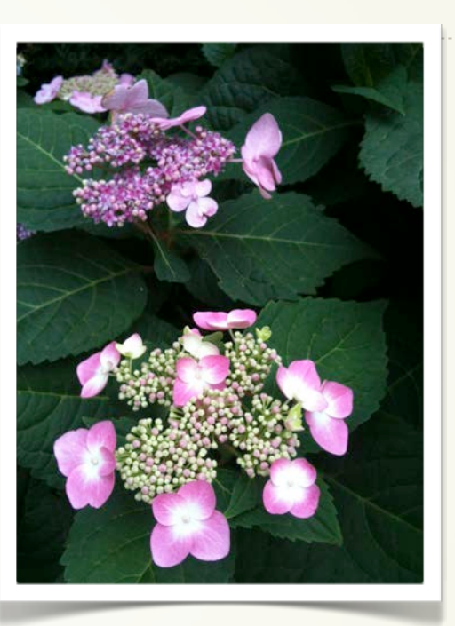
Table 3.2. Lacecap bigleaf hydrangea selections.