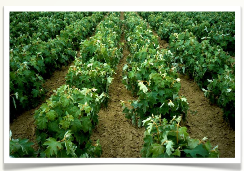
Hydrangea grow fastest with ample moisture and may require irrigation.

is more tolerant of alkaline soils than H. macrophylla but like H. macrophylla prefers consistent moisture and a soil enriched with organic matter (Dirr, 2004). Unlike H. macrophylla , it reliably flowers from Florida to Canada. Leaves (immature and mature) are more frost tolerant than those of H. macrophylla and H. serrata (Dirr, 2004). Fall color is often brown but some years a clear yellow.