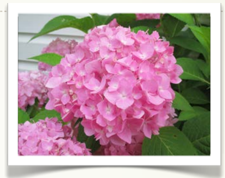
Table 3.3. Mopheaf bigleaf hydrangea selections.