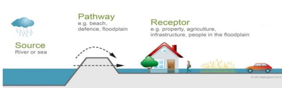
Figure 1. The Source-Pathway-Receptor (SPR) framing (Redrawn from Sayers et al. 2002)

People defended themselves against floods for thousands of years. In ancient times they built their houses on higher grounds or artificial mounds. Later they started building flood defences around agricultural land and villages. Yet history shows that nature is unpredictable and harsh. Extreme conditions that may lead to failures of flood defence often occur. This session provides a theoretical step-stone to flood emergency response. Preparedness for floods is discussed using the 'Source-Pathway-Receptor' framing principle (fig.1).