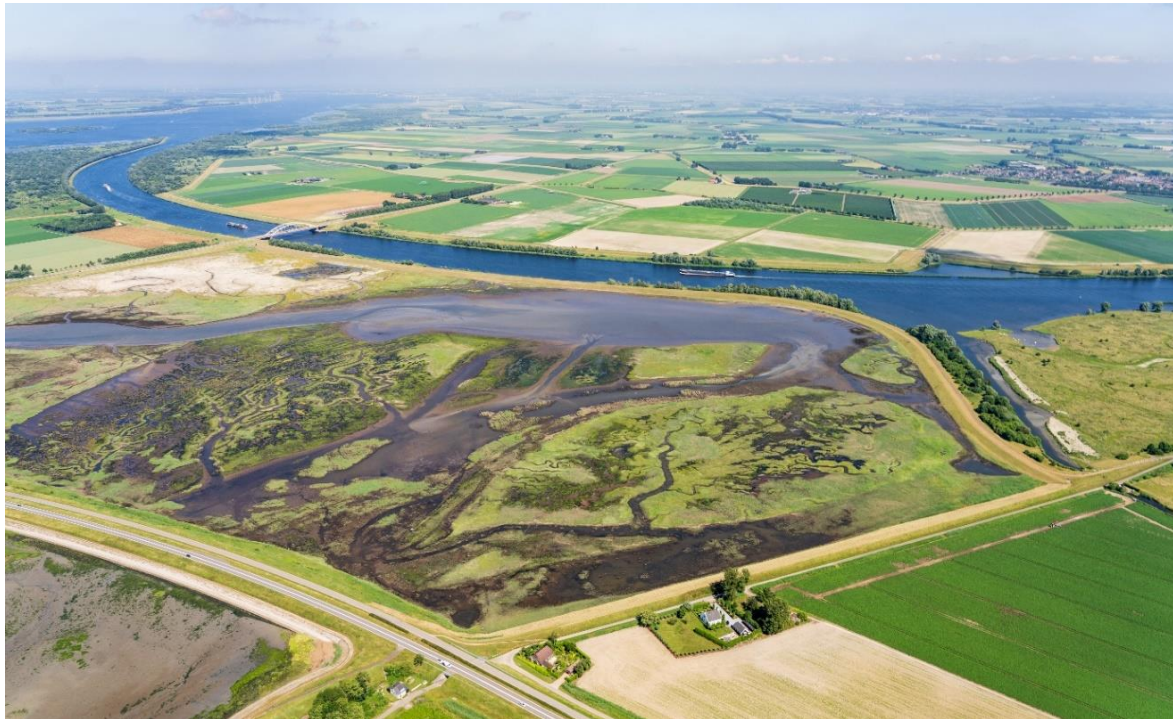
Figure 2. Aerial view of Rammegors tidal restoration area. The area was re-connected with the Eastern Scheldt in 2016 and has since then been monitored in terms of groundwater development, morphological changes and colonization by benthos and vegetation.

derived and transferred to the coastal landscape transition that is currently taking place in the Hedwige-Prosperpolder area.