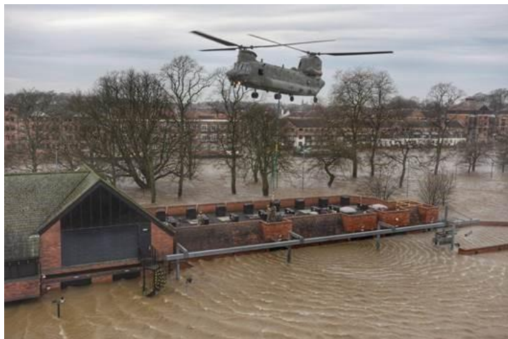
Figure 3. The overwhelmed York Foss barrier during the York floods of 2015.

Due to a relatively high frequency of extreme events that threaten the structural integrity of flood defences, the UK has developed important experience in flood emergency response. This is reflected in incident response procedures, governance and tacit knowledge among incident respondents. In this lecture the flood emergency response and incident communication governance and structure in the UK is introduced. Subsequently the case of the York floods of 2015 is discussed with a special tribute to the climate-proofing upgrades that the York Foss barrier is currently receiving.