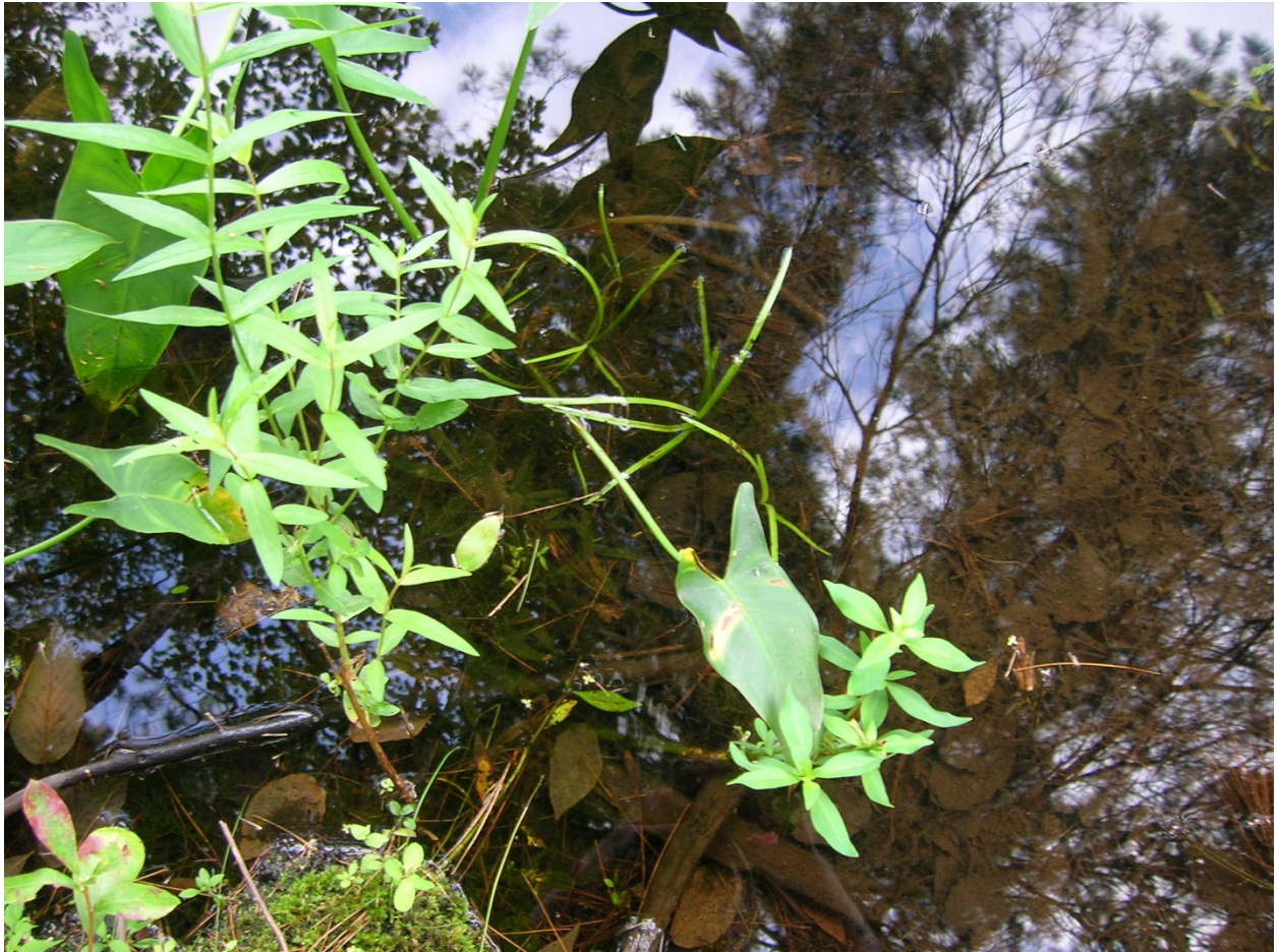
Photo of Small Bur-reed at the isthmus of Knops pond and Marshy cove. North of town beach.