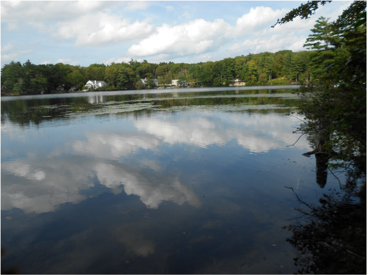
Photo taken from point north of Town Beach.