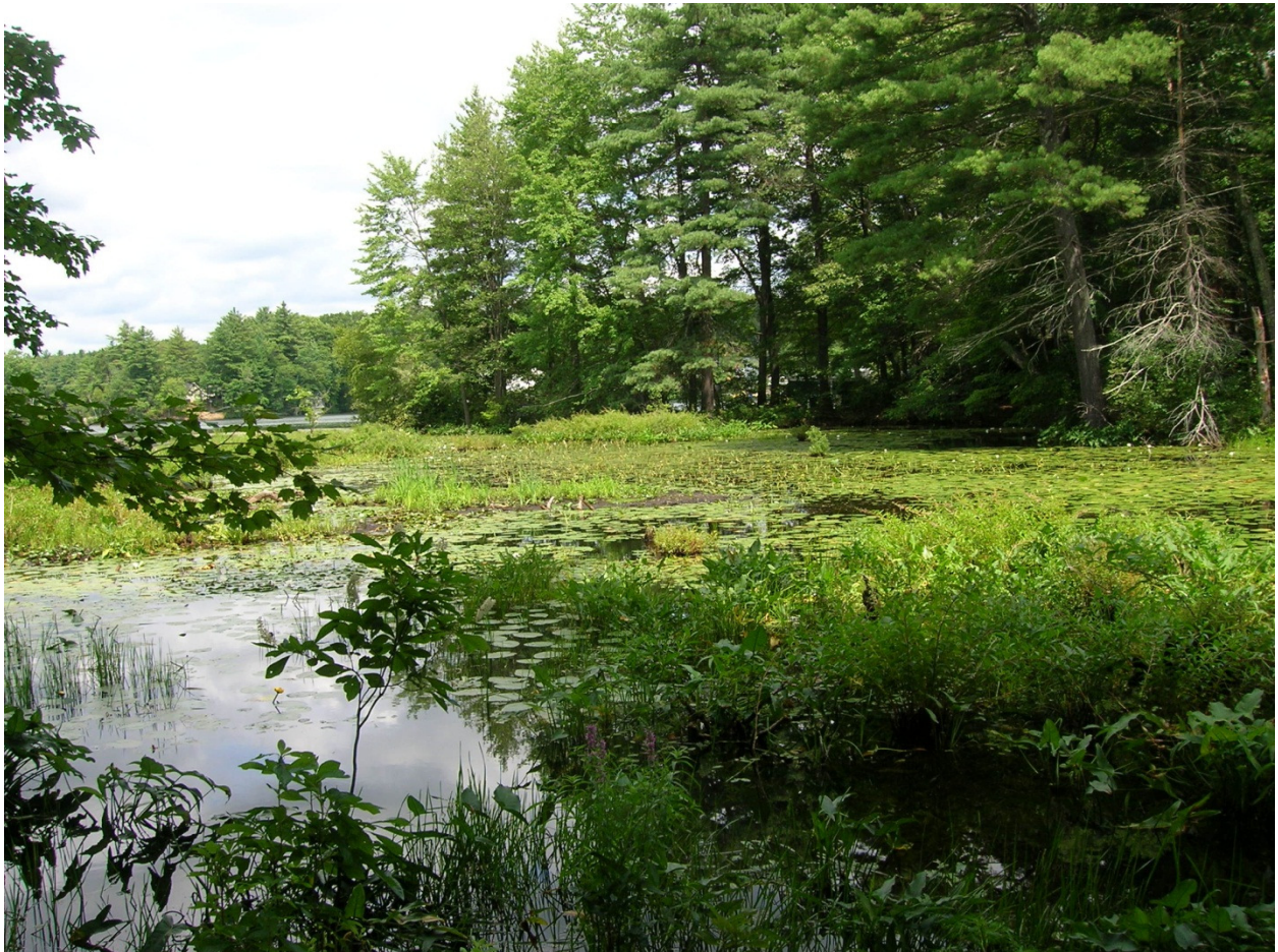
Photo of marshy cove taken from north of town beach