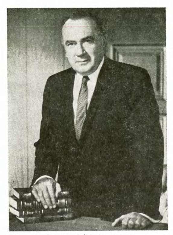
Governor Calvin L. Rampton