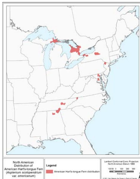
Figure 1. North American distribution of Hart's-tongue Fern (adapted from Kartesz 2011).