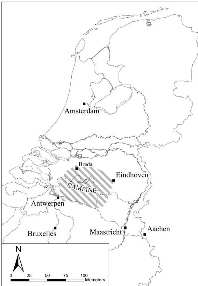
Fig. 1: The Benelux countries with some major towns and an indication of the location of the Campine. Abb. 1: Die Benelux-Länder mit einigen Größeren Städten und der Lage der „Kempen“.

To detect patterns in the species composition in the used dataset, we used the modified TWINSpan algorithm as suggested by ROLEK et al. (2009); only one subdivision was recognised and the results given by TWINSpan were refined subjectively on the basis of expert judgement. To compare differences in species composition, we made a combined synoptic table (in percentages, see the recommendations by DENGLER et al. 2006, p. 84) of the new association and the Rubetum silvatici . For the identi-