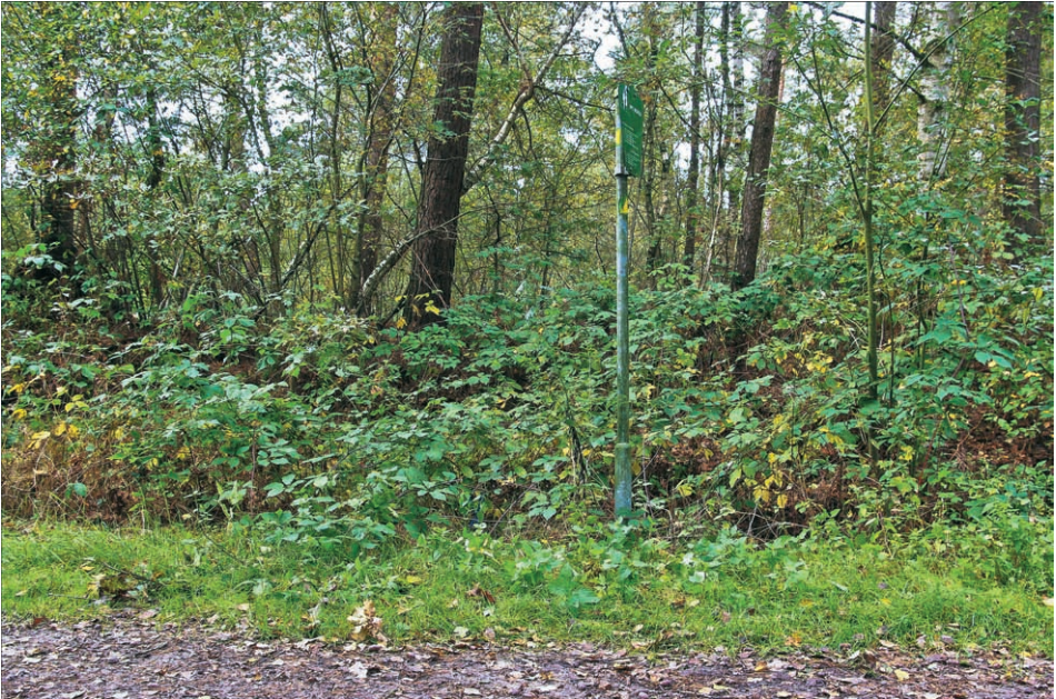
Fig. 3: The Rubetum taxandriae is usually found along forest edges. Here with Rubus taxandriae and R. gratus .

Abb. 3: Das Rubetum taxandriae wird gewöhnlich an Waldrändern gefunden, hier mit Rubus taxandriae und R. gratus .