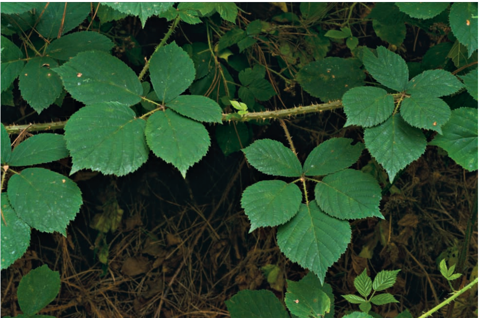
Fig. 4: Primocane with leaves of Rubus campaniensis , one of the character species of the Rubetum taxandriae .

Abb. 3: Das Rubetum taxandriae wird gewöhnlich an Waldrändern gefunden, hier mit Rubus taxandriae und R. gratus .