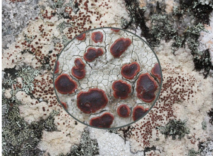
Ramboldia sanguinolenta – Stanthorpe on rock

Don't forget your magnifying glasses when you go bush. It's the little things that can make a walk very exciting. Once you discover the beauty of lichens along the way, you'll be hooked.