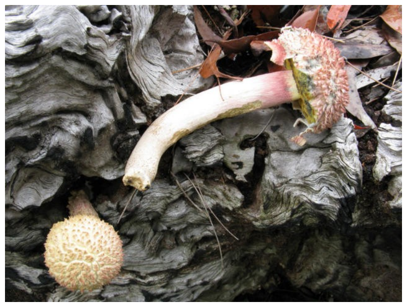
Boletellus emodensis on woody gall, note bluing reaction on pores.

Two named species and one new genus were added to our ongoing site list. Given there were so few new species there will be no species list in this report but if members are interested they can find a copy on the QMS field trip website.