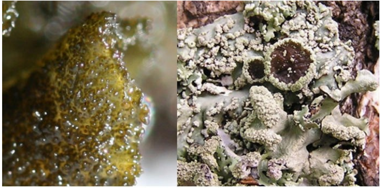
From left: Isidia on Leptogium sp, Indooroopilly; soralia on an unidentified lichen from Mt Nebo.

Lichens generally reproduce vegetatively via soredia or isidia, two structures on the thallus surface consisting of fungal hyphae and algal cells. Both easily break off and disperse to new locations where they may start a new lichen. Isidia are tiny often cylindrical or pimplelike protuberances on the thallus surface. Soredia mostly have a powdery appearance or develop in clusters called soralia.