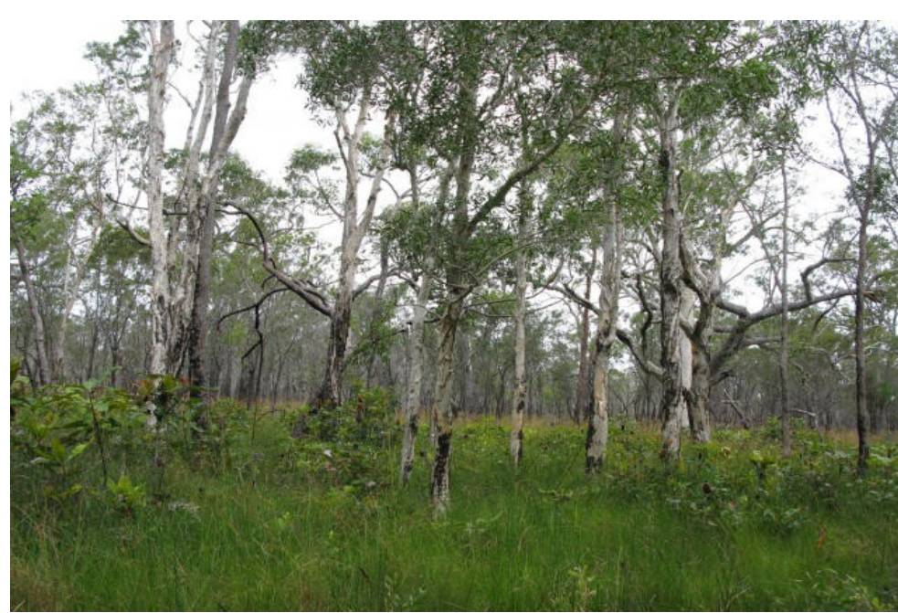
Wallum woodland at Cooloola National Park including Banksia robur.