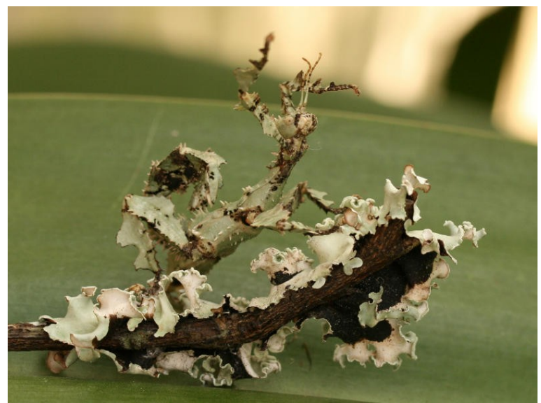
The juvenile Spiny Leaf Insect ( Extatosoma tiaratum ) has the appearance of a foliose lichen.