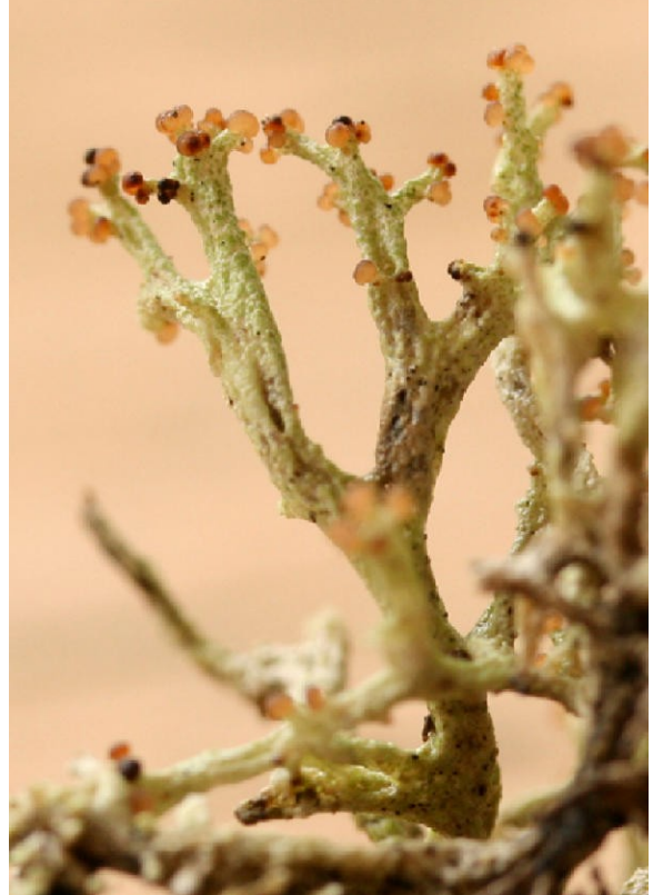
Cladonia sulcata, Mt Coot-tha.

to resemble lichens like the insect depicted on the left. Birds build nests with lichen fragments, and some of our small mammals are known to feed on lichens. Lichens are an important food source for the endangered Mahogany glider in Northern Queensland.