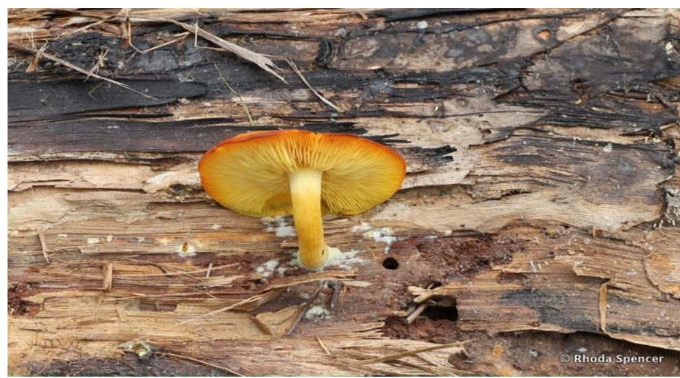
Single Gymnopilus sp. fruit body on log.

Pycnoporus but enough fresh material that the forayer's new to fungi got to see the bright orange regular. There was also a pretty orange Gymnopilus sp. but this was not collected as there was a single fruiting body and identification often requires veil characteristics of the immature