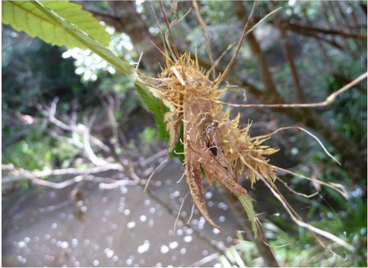
Mummified moth parasitized by a probable Akanthomyces fungus found on Gheerull Falls track, Blackall Range.

The white area's on the fungal branches are likely to be the conidiospores (asexual spores) which help the fungus spread around the environment. There is research into_entomopathogenic fungi to see if they can be used as biological control of pests. It seems to me that the natural world is endlessly complex and inventive. It is great that we have observant people who can bring such amazing things to our attention.