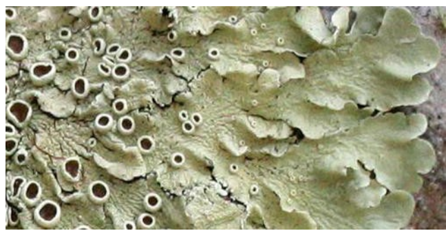
Foliose lichen Flavoparmelia rutidota, Stanthorpe

miniature shrubs with branches, attached to their substrate at one point only. These branches can resemble pendulous straps or have a cylindrical shape or even be hollow like the perforated pseudopodetia of Cladia retipora .