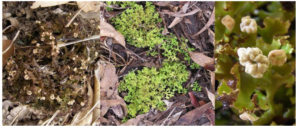
Fungimap target species Heterodea muelleri , a common ground lichen in open eucalypt forests of SE Qld

Lichen identification starts with the description of thallus structure, surface texture, and by distinguishing the reproductive methods. Thallus colour can be important but is unreliable as it varies with moisture content. Spot test are an important method. Very small amounts of chemicals are applied to the thallus. Any potential colour change in the affected area may give clues to the lichen's identify. This traditional method based on chemistry is relatively easy to apply but also limited. It has its improved continuation in the use of the more sophisticated thin layer chromatography where extracts of the lichen thallus are spotted onto a glass or aluminium plate and undergo a series of solvent and other treatments identifying their chemical components.