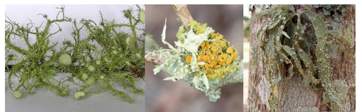
From left: fruticose lichens on bark Usnea scabrida subsp. elegans , Stanthorpe; Teloschistes sieberianus, , Toowoomba; and Ramalina celastri , Indooroopilly

Lichens are categorized according to their growth forms. They are aptly named fruticose when they have a shrubby appearance and can be hanging or grow upright. They can truly look like