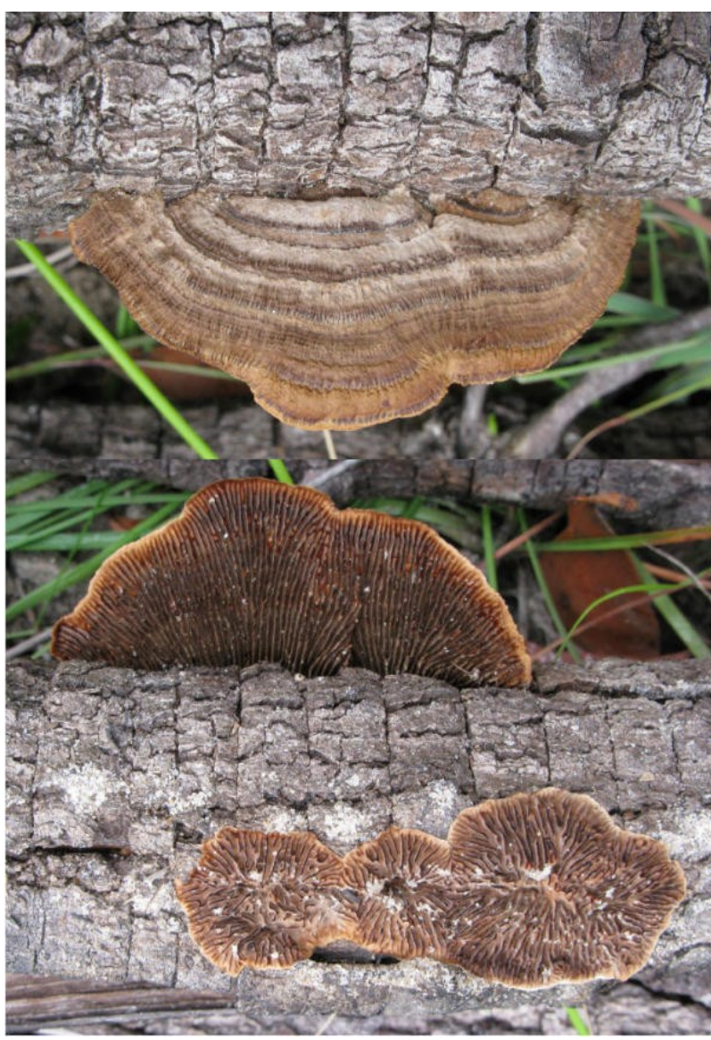
Gloeophyllum abietinum looks like a woody polypore from above but has gill-like hymenium underneath.

coloured, thick-walled cystidia, some of which had occasional encrustations. Based on these characters the species name abietinum was determined. This specimen will be lodged at the Queensland Herbarium.