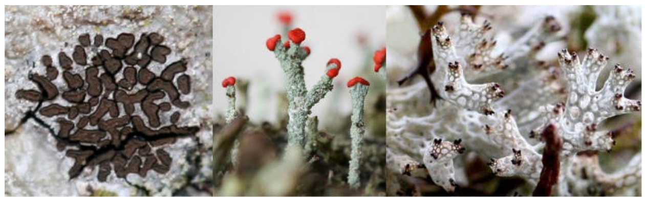
From left: Glyphis cicatricosa (on bark, Indooroopilly), ground lichens Cladonia floerkeana with bright red apothecia (Chapel Hill) and Cladia retipora with fungal fruiting bodies at tip of pseudopodetia (Stanthorpe)

Lichen identification starts with the description of thallus structure, surface texture, and by distinguishing the reproductive methods. Thallus colour can be important but is unreliable as it varies with moisture content. Spot test are an important method. Very small amounts of chemicals are applied to the thallus. Any potential colour change in the affected area may give clues to the lichen's identify. This traditional method based on chemistry is relatively easy to apply but also limited. It has its improved continuation in the use of the more sophisticated thin layer chromatography where extracts of the lichen thallus are spotted onto a glass or aluminium plate and undergo a series of solvent and other treatments identifying their chemical components.