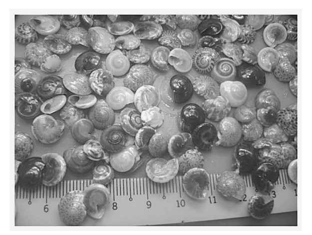
Fig. 3. Umbonium vestiarum, the dominant species on the sandy shore.

1988). The diversity in Teluk Aling intertidal shore is considered low as H' ranged from 0 to 1.42 while evenness, J' ranged from 0 to 0.31 when compared to the tropical American beaches or warm temperate Australian beaches. However, Teluk Aling is better off compared to the intertidal beaches of Portugal with a striking characteristic of having coarse sediment associated with intertidal density of less than 1 organism m<sup>2</sup> (Dexter, 1989).