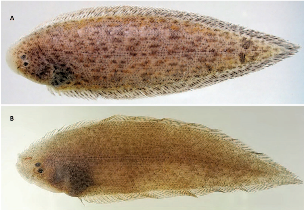
Fig. 2. Comparison of color patterns and body shapes between Cynoglossus nanhaiensis , new species, and C. maccullochi (CSIRO H6548-01) taken off Queensland, Australia.

mm SL; 01 May 2011. SCF2011196; female, 115.5 mm SL; 01 May 2011. SCF2011197; male, 123.2 mm SL; 01 May 2011. SCF2011187; female, 120.1 mm SL; 01 May 2011. SCF2011199; female, 109.2 mm SL; 01 May 2011. SCF2011200; female 105.7 mm SL; 01 May 2011. SCF2011186; female, 129.0 mm SL; 01 May 2011. SCF2011188; female, 120.2 mm SL; 03 Jan 2010. SCF2011205; male, 122.8 mm SL; 24 Nov 2011. SCF2011206; male, 127.1 mm SL; 24 Nov 2011. SCF2011207; male, 143.2 mm SL; 24 Nov 2011. SCF2011209; male, 131.5 mm SL; 24 Nov 2011. SCF2011210; male, 126.0 mm SL; 24 Nov 2011. SCF2011211; male, 121.9 mm SL; 24 Nov 2011. SCF2011212; male, 115.1 mm SL; 24 Nov 2011. SCF2011213; female, 128.1 mm SL; 24 Nov 2011. SCF2011214; male, 133.8 mm