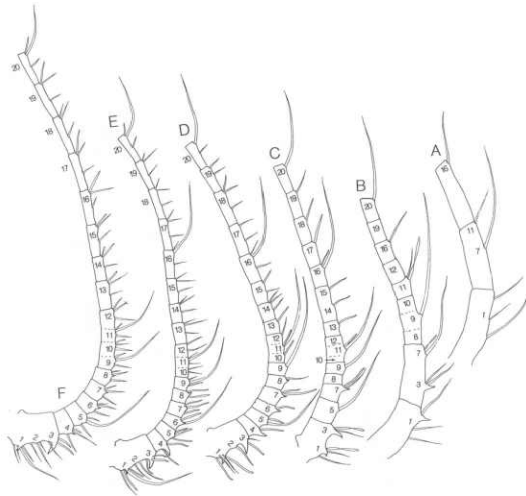
Fig. 3. Proximal section of antenna I of Pleuromamma xiphias . A, CI; B, CII; C, CIII; D, CIV; E, CV; F, CVI female. Dotted lines indicate incompletely formed arthrodistal membranes; remaining explanation as for Fig. 1.