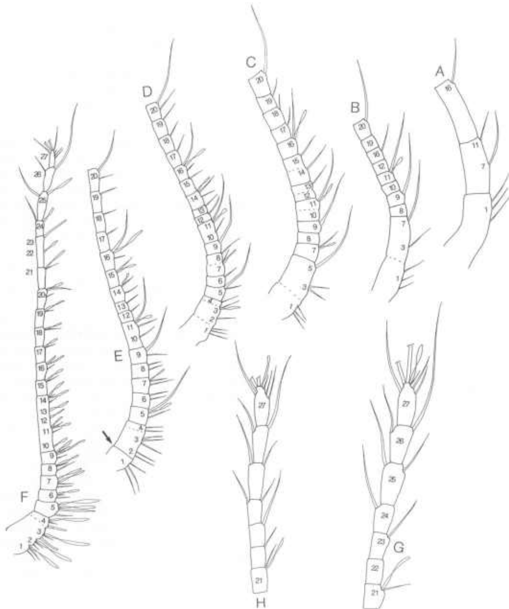
Fig. 5. Antenna 1 of Pseudocalanus elongatus . A, proximal section of CI; B, proximal section of CII; C, proximal section of CIII; D, proximal section of CIV; E, proximal section of CVI female (arrow indicates arthrodial membrane absent in CV; otherwise CV identical to CVI female); F, CVI male; G, distal section of CI; H, distal section of CII (distal section of CIII, CIV, CV, and CVI female is identical). Explanations as for Fig 2.

Boxshall (1991) with the exception of our distal setal group, which is represented by segments XXVII and XXVIII in the 28-segmented adult ancestor. As a result of this alignment, the geniculation on antenna 1 for the male of R. klausruetzleri and Pl. xiphias