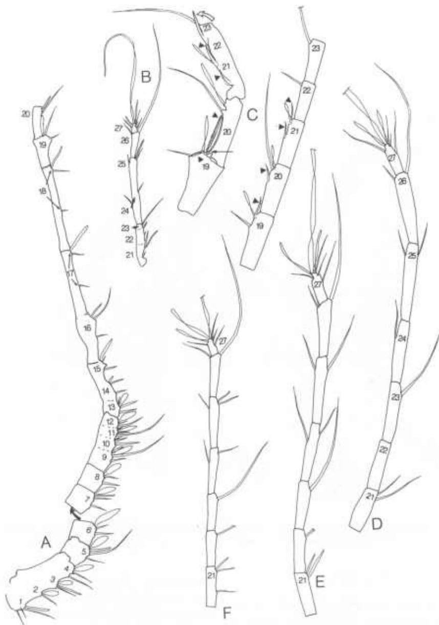
Fig. 4. Pleuromamma xiphias . A, proximal section of right antenna 1 of CVI male (curved arrow unites setal group 6 with setal group 7); B, distal section of right antenna 1 of CVI male; C, detail of setal groups 19–23 on CV (to right) and CVI (to left) male right antenna 1 (long arrow near articulation of the proximal seta of setal group 20; arrowheads near poorly articulated setae of setal groups 19–21; open arrow near attenuation of segment bearing setal group 22); D, distal section of CI; E, distal section of CII; F, distal section of CIII (distal section of CIV, CV, and CVI female is identical). Explanations as for Fig 2.

thek/quadrithek grouping is not the outcome for setal group 1).