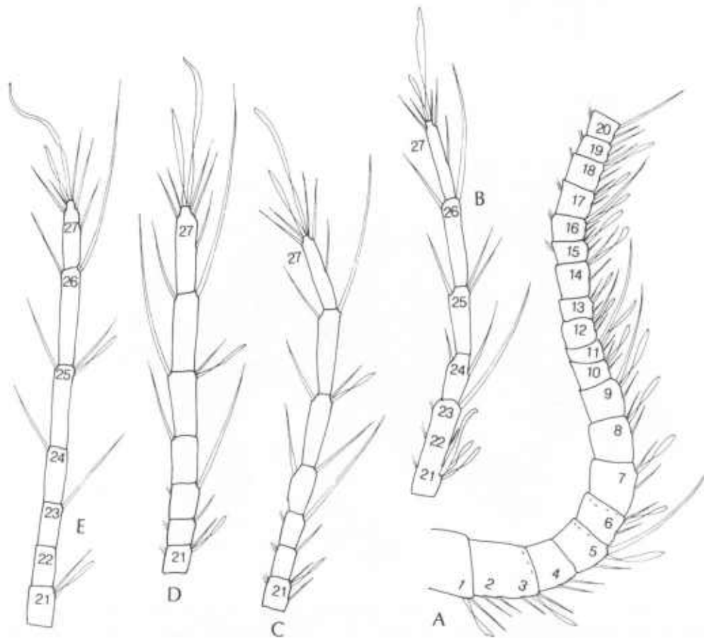
Fig. 2. Antenna 1 of Ridgewayia klausruetzleri . A, proximal section of CVI male; B, distal section of CVI male; C, distal section of CIII (distal section of CIV, CV, and CVI female is identical); D, distal section of CII; E, distal section of CI. Distal section includes setal groups 21–27; remaining explanation as for Fig. 1.

poorly expressed arthrodistal membrane within the second segment; there are 3, 7, 3, 2, 3, 2, 2, 4, 1, 1, 3, 2, 3, 1, 1, 1, 2, 2, 1, 1, 2, 2, 2, 7 setae (Fig. 5E, I).