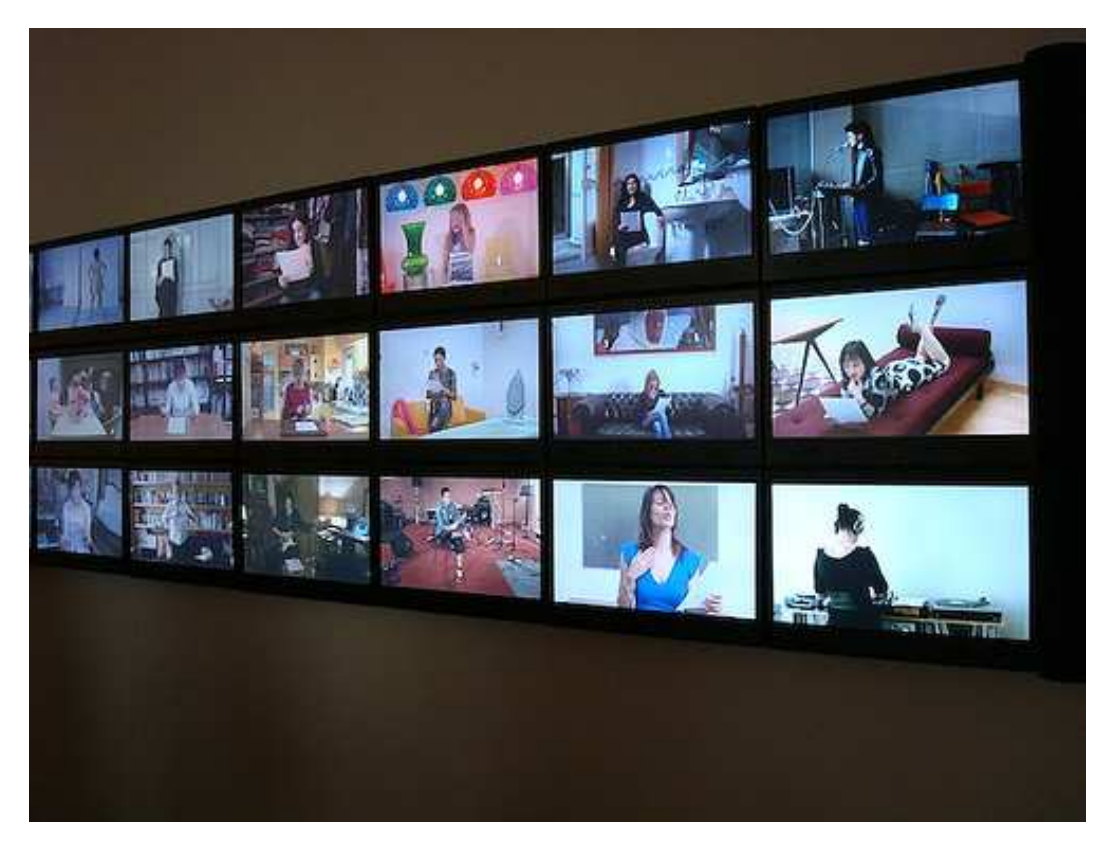
Figure 11. Sophie Calle, Take Care of Yourself , Venice Biennial, 2007. Photographs taken from the exhibition space.