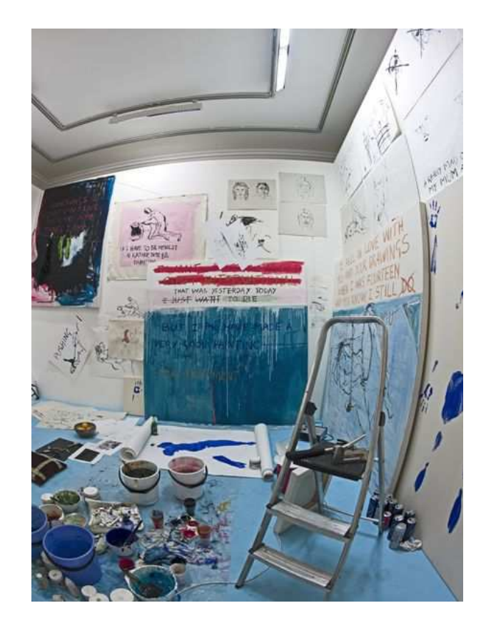
Figure 9. Tracey Emin, Exorcism of the last painting I ever made , 1996, Performance at Galeri Andreas Brändström, Stockholm 1996, Dimensions of room: 153 1/2 x 169 1/4 in. (390 x 430 cm).