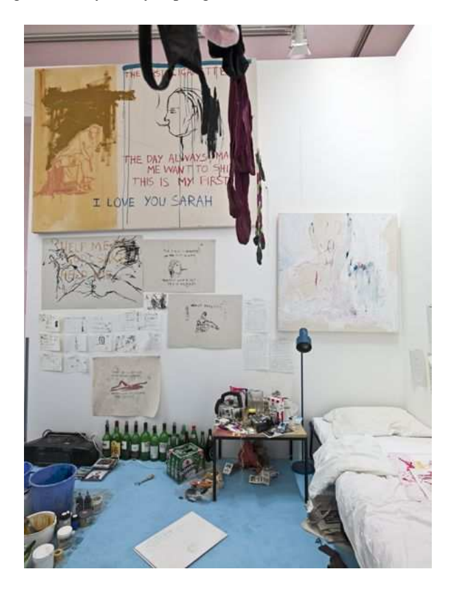
Figure 10. Tracey Emin, Exorcism of the last painting I ever made , 1996. Performance at Galleri Andreas Brändström, Stockholm 1996. Dimensions of room: 153 1/2 x 169 1/4 in. (390 x 430 cm).