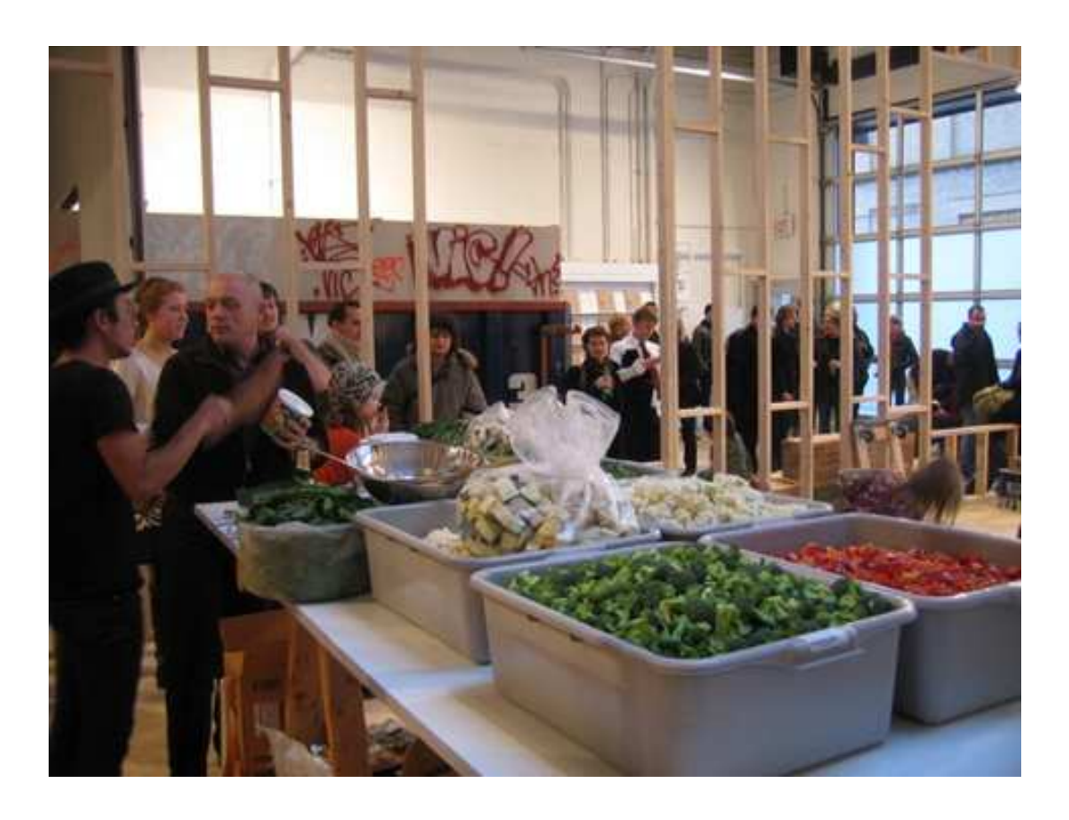
Figure 12 The opening of Rirkrit Tiravanija's Untitled 1992 (Free) at David Zwirner Gallery