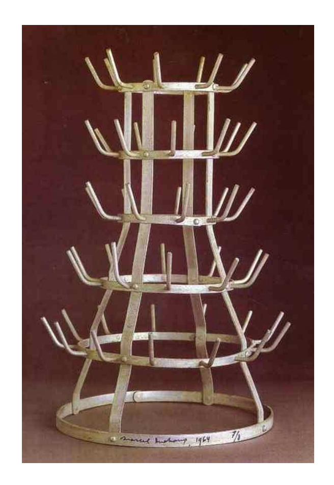
Figure 1. Bottle Rack/Egouttoir (or Porte-bouteilles), Marcel Duchamp, 1914/64. Readymade: bottle rack made of galvanized iron, 59 x 37 cm., Original lost, Replica, Private collection.