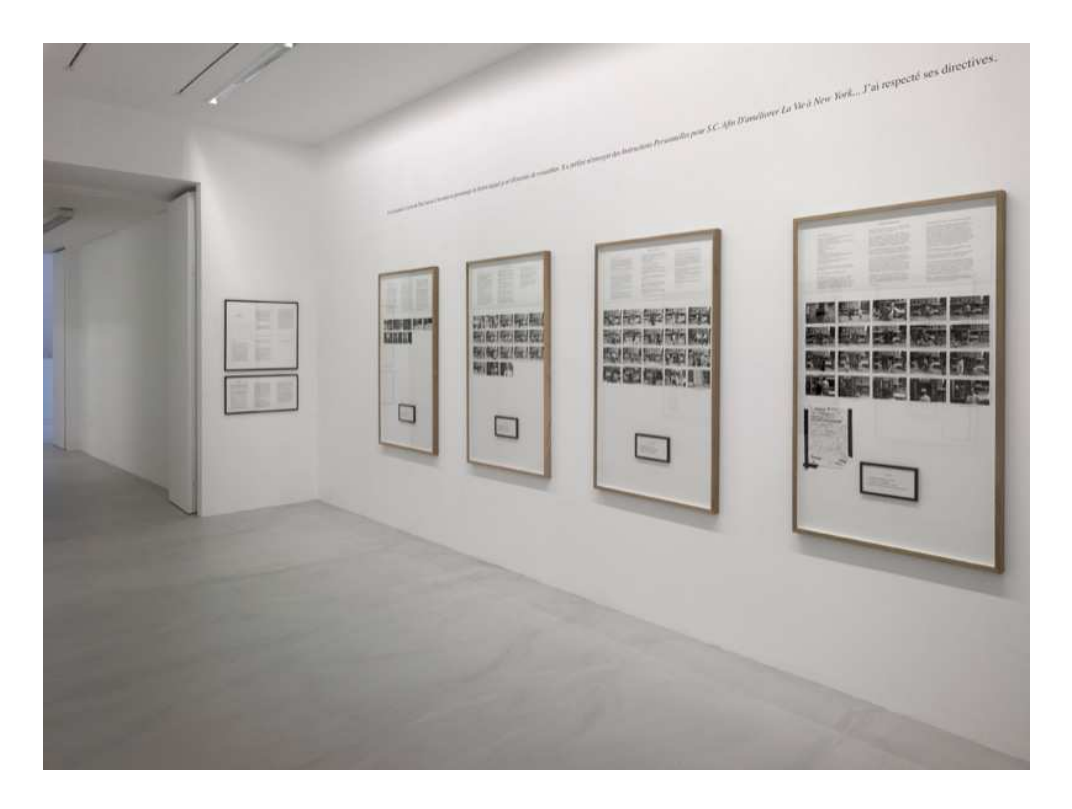
Figure 4. "Double Game", Sophie Calle, 1999, Camden Arts Centre, London (U.K.)