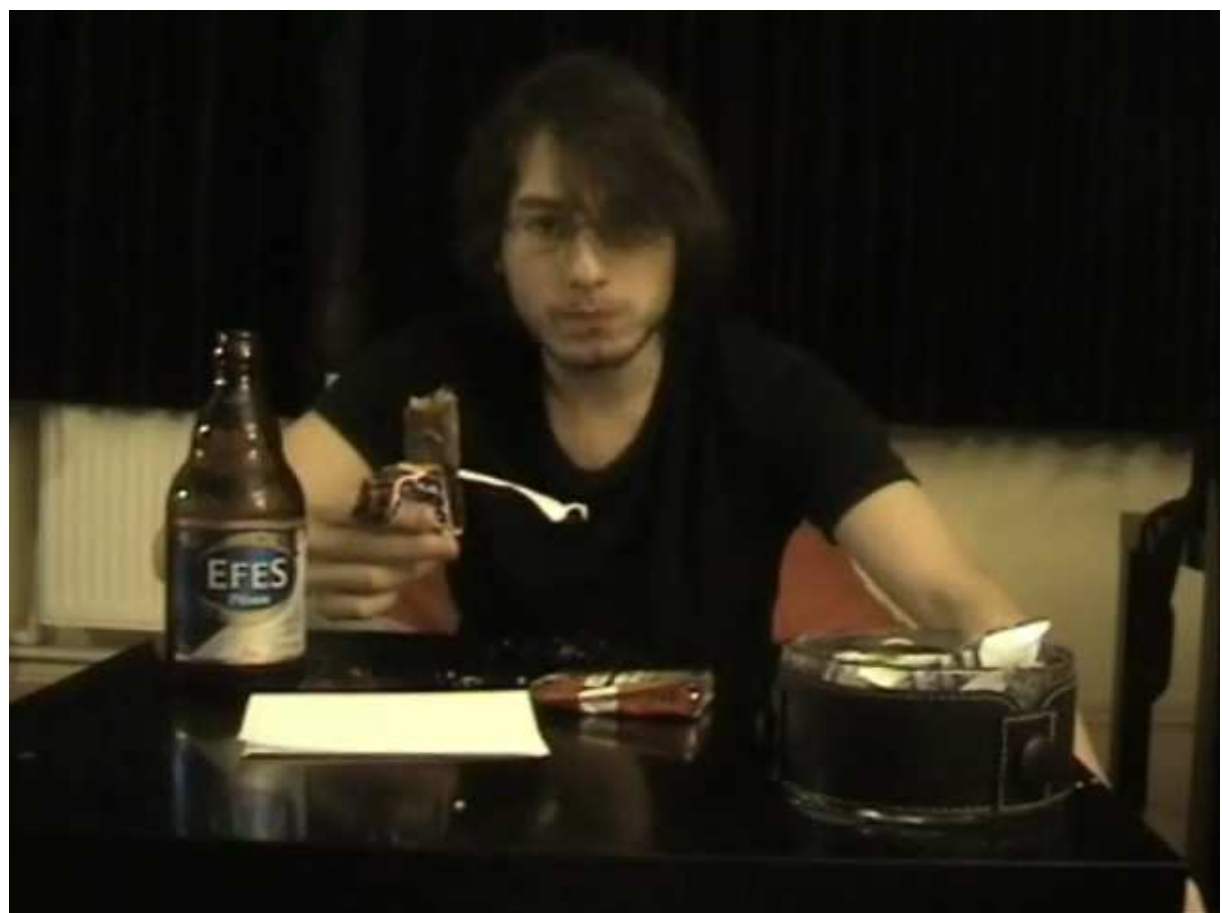
Figure 5. Shots taken from Batu ozoglu's "Day_01" from Make My Day (2009).