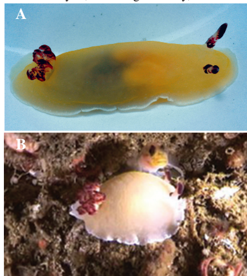
FIGURE 1. Living animals of Dendrodoris azineae sp. nov. (A) Holotype from La Jolla Canyon, California, 54 m depth (LACM 3035). (B) Specimen from Carmel Bay, California, 54 m depth, 30 mm long, not collected.

The heart is large and connects to the blood gland through a conspicuous aorta. The blood